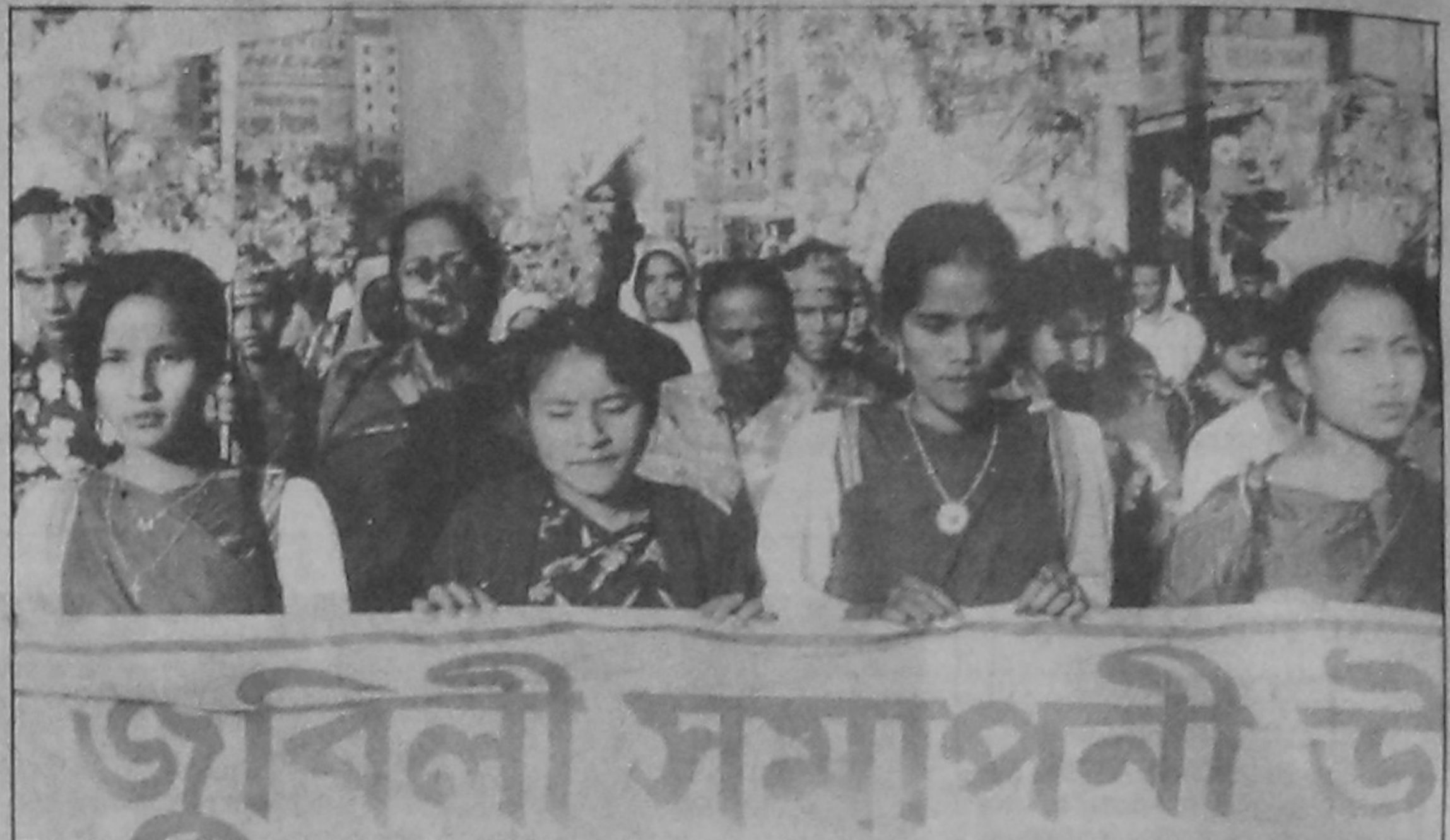
Members of the Christian community brought out a colourful procession in the city yesterday on the occasion of 'Great Jubilee 2000' marking 2000 years since the birth of Jesus Christ.