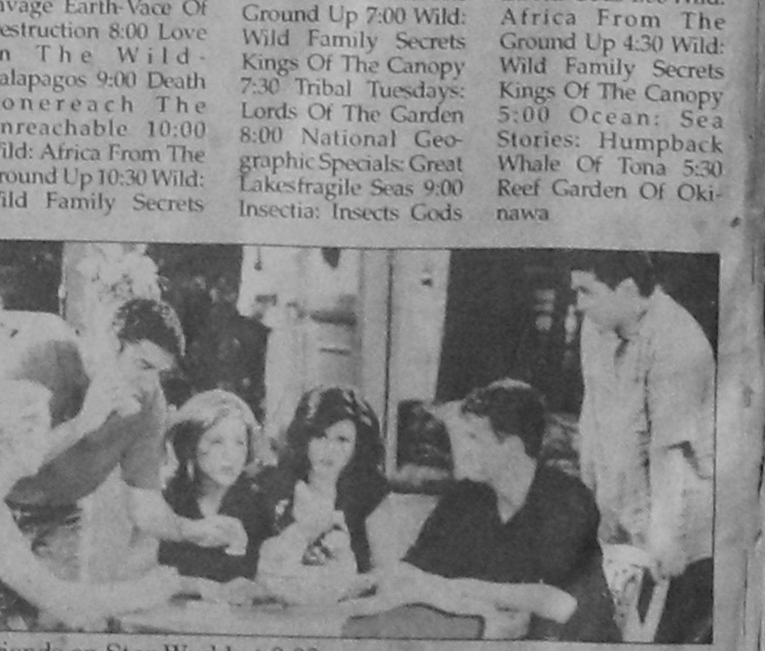
Friends on Star World at 9:00 p.m.