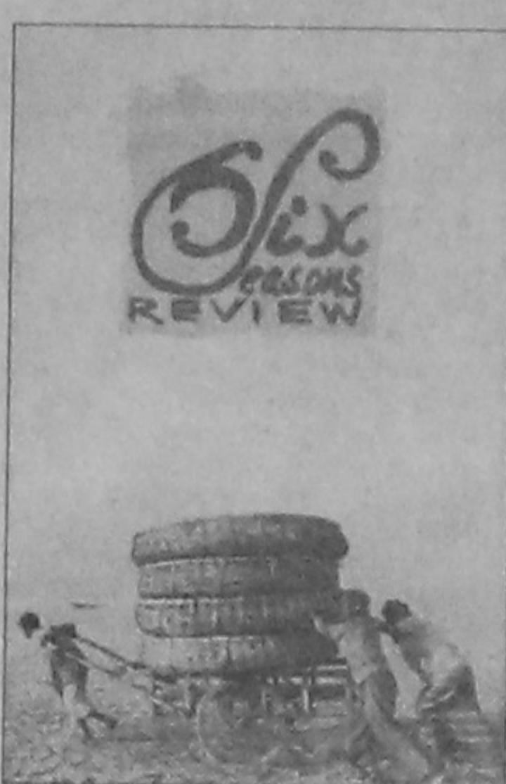
Six Seasons Review, Volume 1 Number 1, 2001, pages 194. ISBN 9840515640 (UPL). Price: TK 250