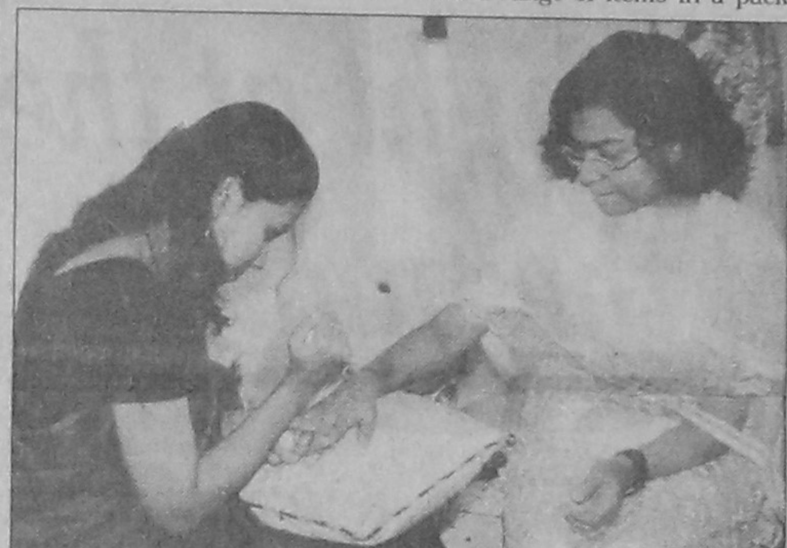
A designer applying henna on the palms of a young lady at the festival yesterday.