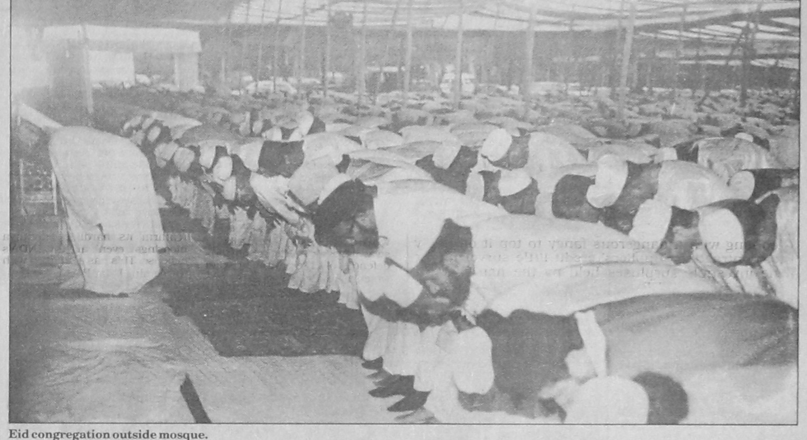
Eid congregation outside mosque.