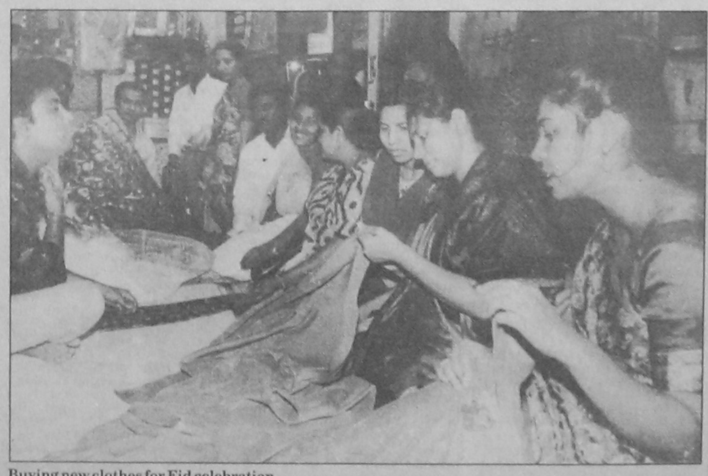
Buying new clothes for Eid celebration.

Great is the Congregation This day on the Eidgah In the world will prevail again The Islami Dispensation indeed Those who unconscious lay buried in tears and sighs Seek Firdaus this day on rising from sleep with the newer fervour of life. You too come and join The great congregation For getting wordly worries. The writer, is Principal, South Sandwif College.