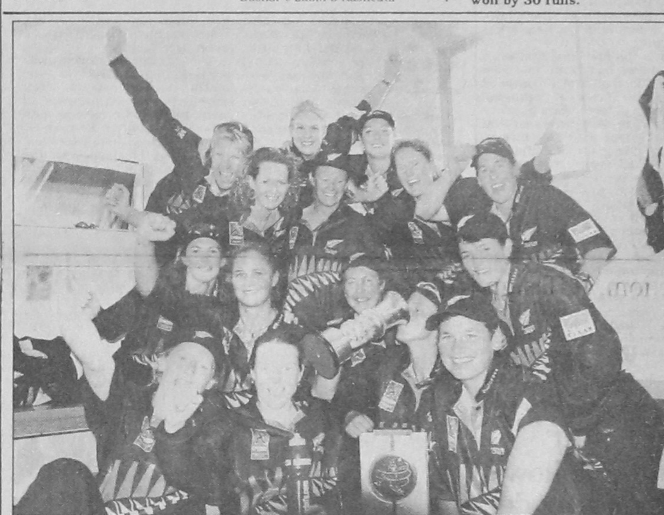
World Cup winning New Zealand women's cricket team members pose with the trophy after defeating Australia in the final yesterday.