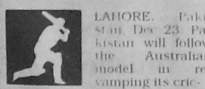
LAHORE, Pak- istan Dec 23: Pakistan will follow the Australian model in re-organizing its cricket.

Let set up following the recent defeat at the hands of England, the country's cricket chief has said, reports AFP.