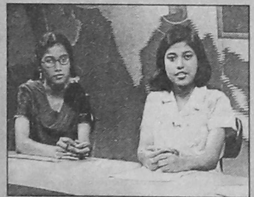
Mukta Khabar on Ekushey TV at 7.20 pm

BTB Morning session 9:00 Opening announcement 9:15 Programme on self defence 9:35 Dripta Uchharan: Programme on recreation 10:00 Programme on mother and child health 10:20 Movie of the holy Sabe-Kader 10:00 News at Ten 10:20 Milad Mahfil in observance of the holy Sabe-Kader 11:15 Khabar/ The News 11:30 Closing