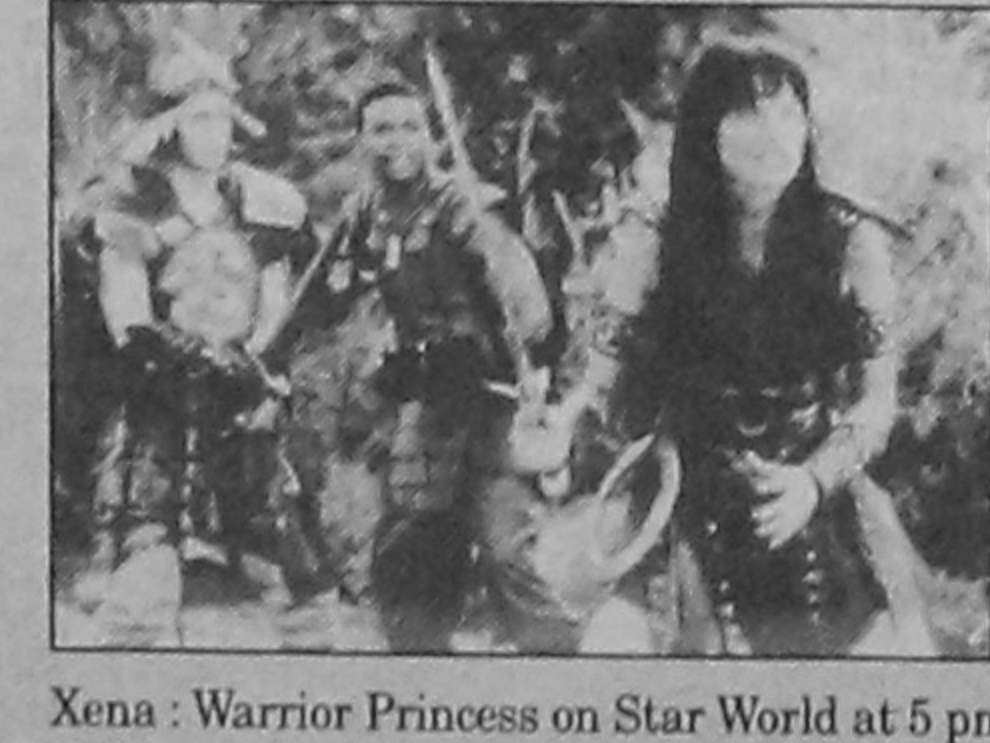
Xena: Warrior Princess on Star World at 5 pm

6:30 Go For It 7:30 Ushuaia 8:30 Lonely Planet 9:30 Future Tense 10:00 Eyewitness II 10:30 Untamed Australia 11:30 Untamed Amazonia 12:30 Wild Asia 1:30 Ultimate Guide 2:30 Amazing Worlds 3:30 Extreme Machines IV 4:30 Extreme Machines IV 5:00 Inside the Space 5:30 Assignment Discovery 6:30 ARK Tales of the Animal Rescue Kids 7:00 Splat IV 7:30 21st Century Medicine 8:30 Health Showcase 9:30 New Detectives III 10:30 Travelers 11:30 African Adventures 12:00 Adventure Crazy 12:30 21st Century Medicine 1:30 Health Showcase 2:30 New Detectives III 3:30