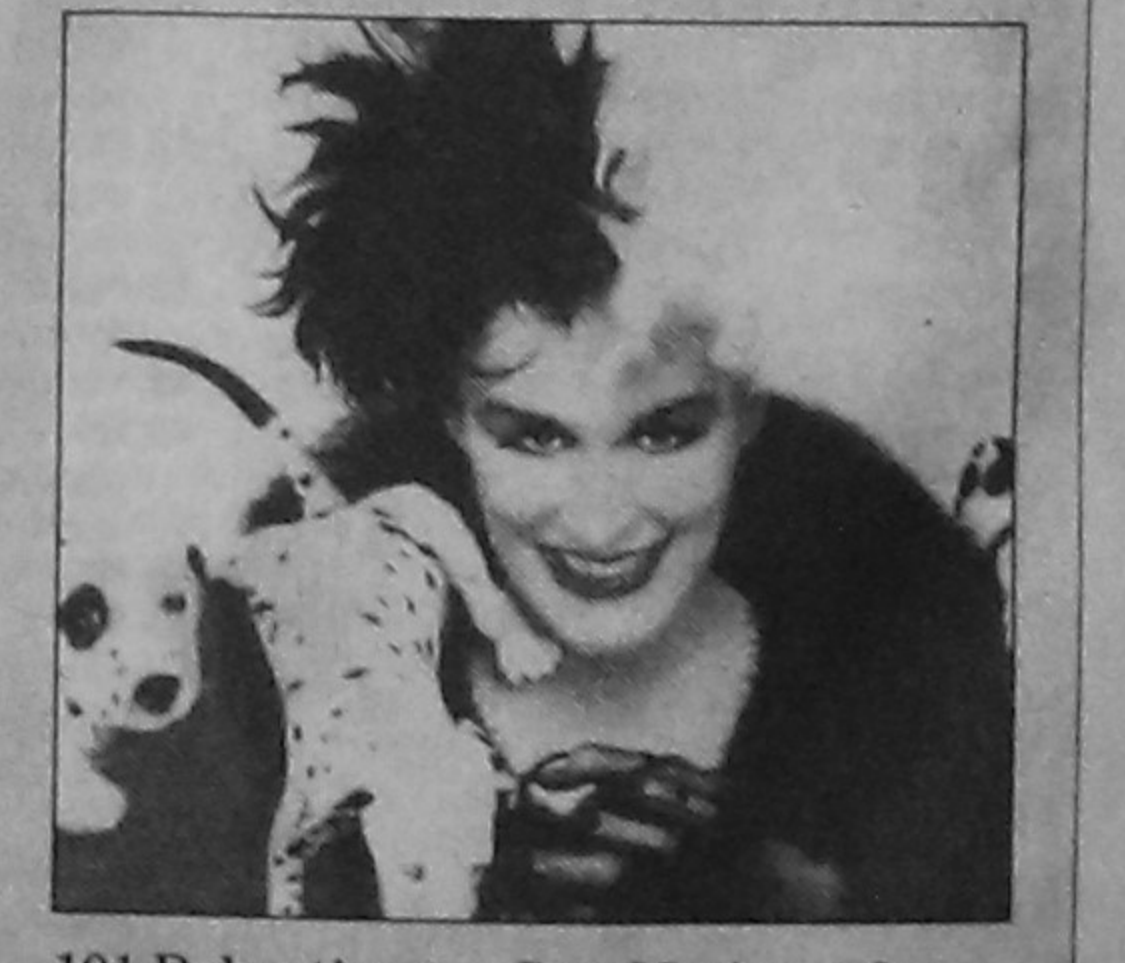
101 Dalmatians on Star Movies at 9 am

NATIONAL GEOGRAPHIC 7:00 Family Hour: Dance of the deep 8:00 Saturday Unlimited: World of Clones