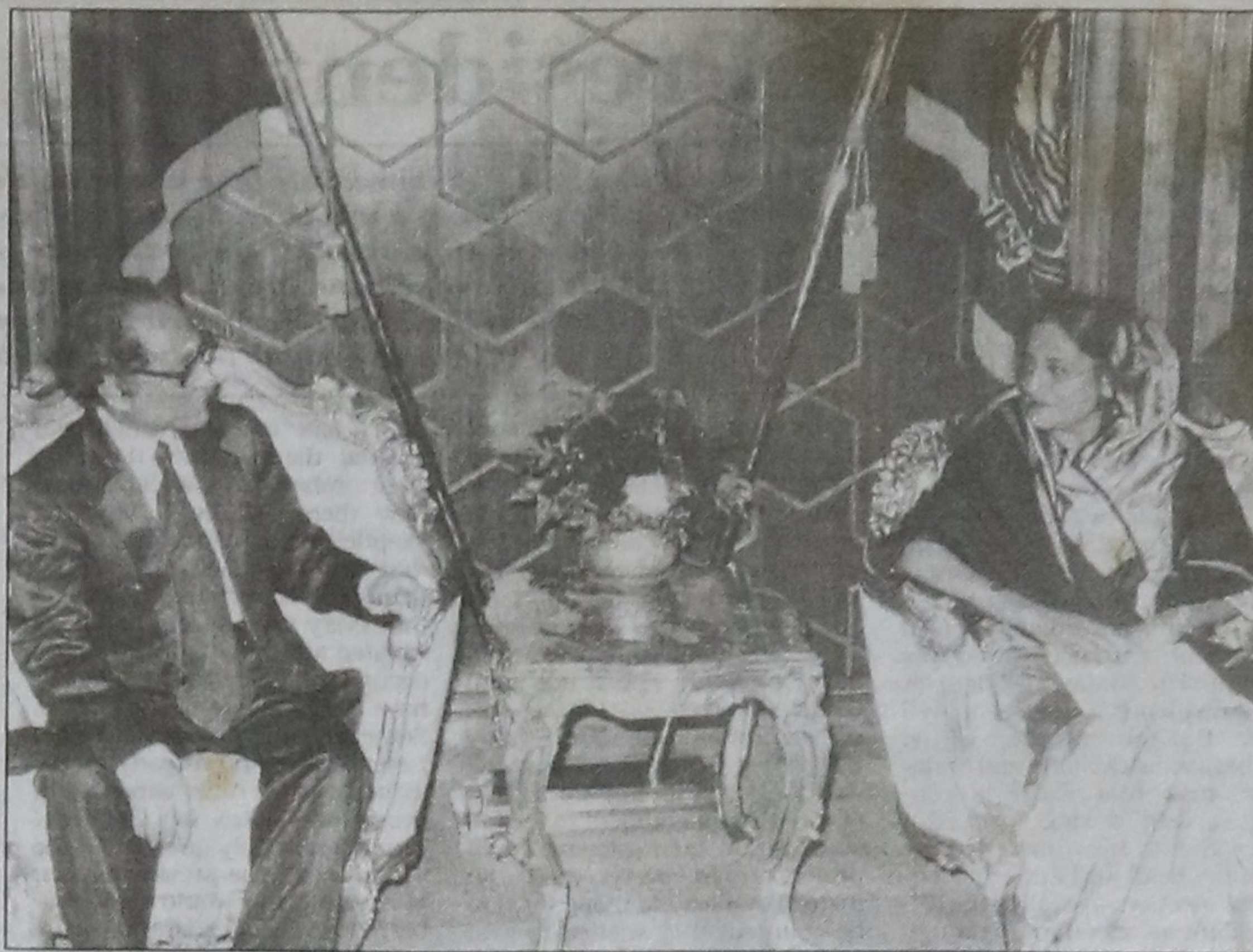
Prime Minister Sheikh Hasina called on President Justice Shahabuddin Ahmed at Bangabandhu Memorial Hall yesterday.

Listing various welfare activities, the minister said that the prime objective of the present government is to ensure welfare of the marginal people and less developed areas across the country.