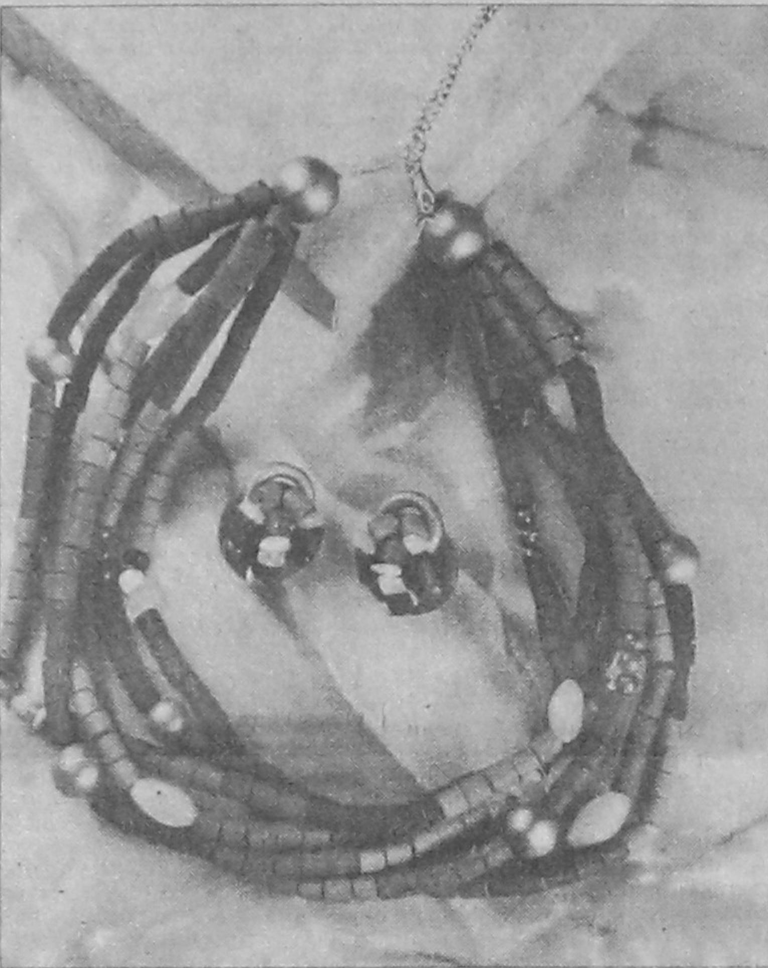
A multicoloured wooden bead sattaleheri .

layers of beads set with gold-plated pendants. All had matching strand sporting a diamond shaped pendant off set by blue mina work and smaller blue beads, a pale green beaded strand supporting rectangular pieces strung together with smaller beads of pale green and jade, a sattaleheri in multicoloured wooden beads, highlighted by brown round beads, a sattaleheri in tiny wooden beads carrying an intricately designed large rectangular pendant...the combinations on show are simply endless.