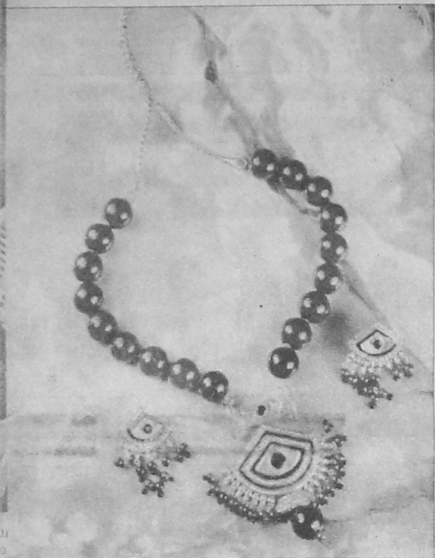
A diamond shaped pendant on a string of blue beads