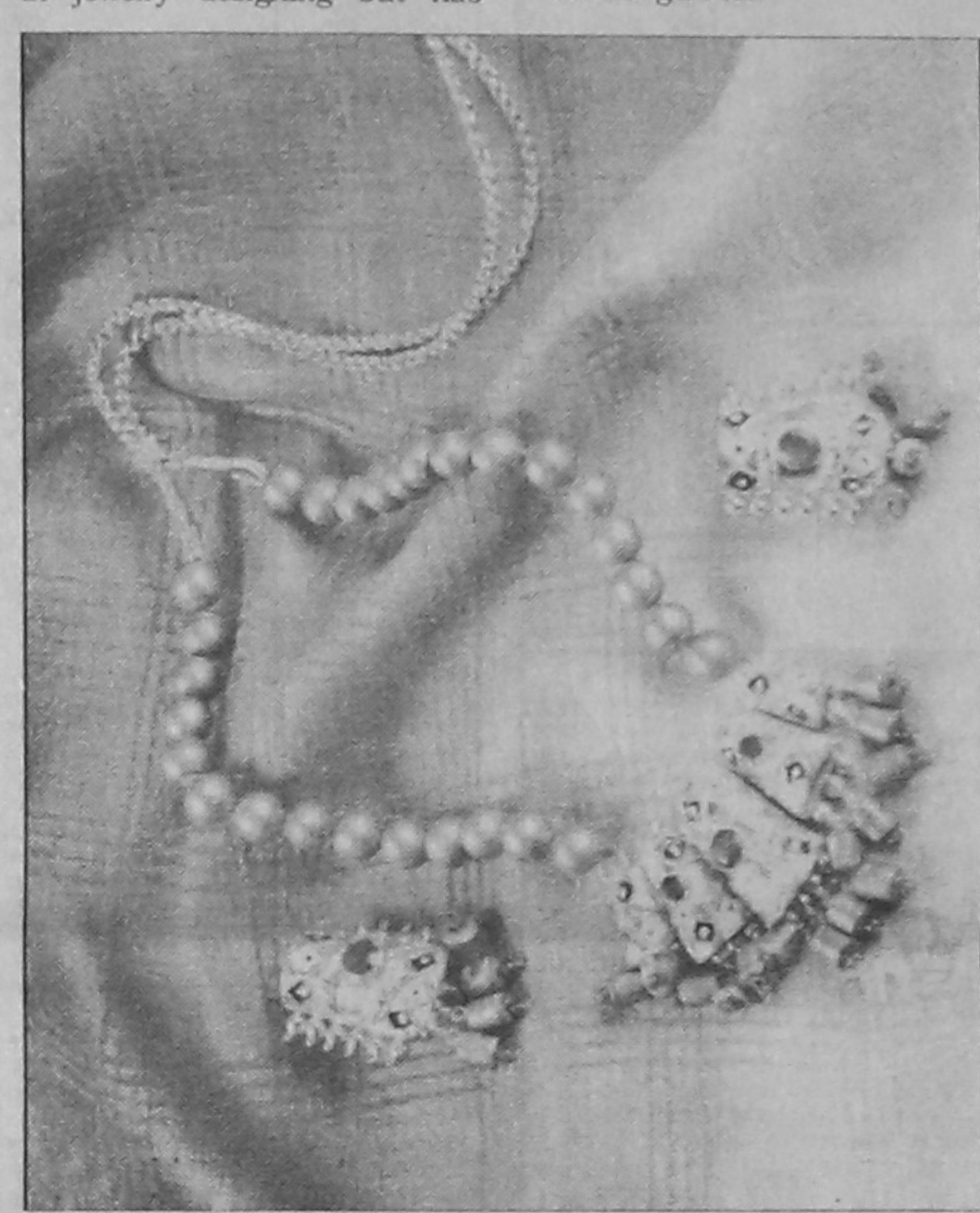
A combination of light and dark green beads offset this neck piece.