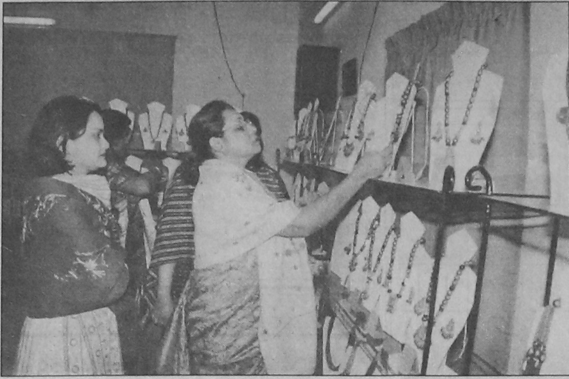
Women crowd at the exhibition, taking a closer look at the beautiful creations.

The pieces on show at the exhibition included single strand pieces, shatleheris, and multiple