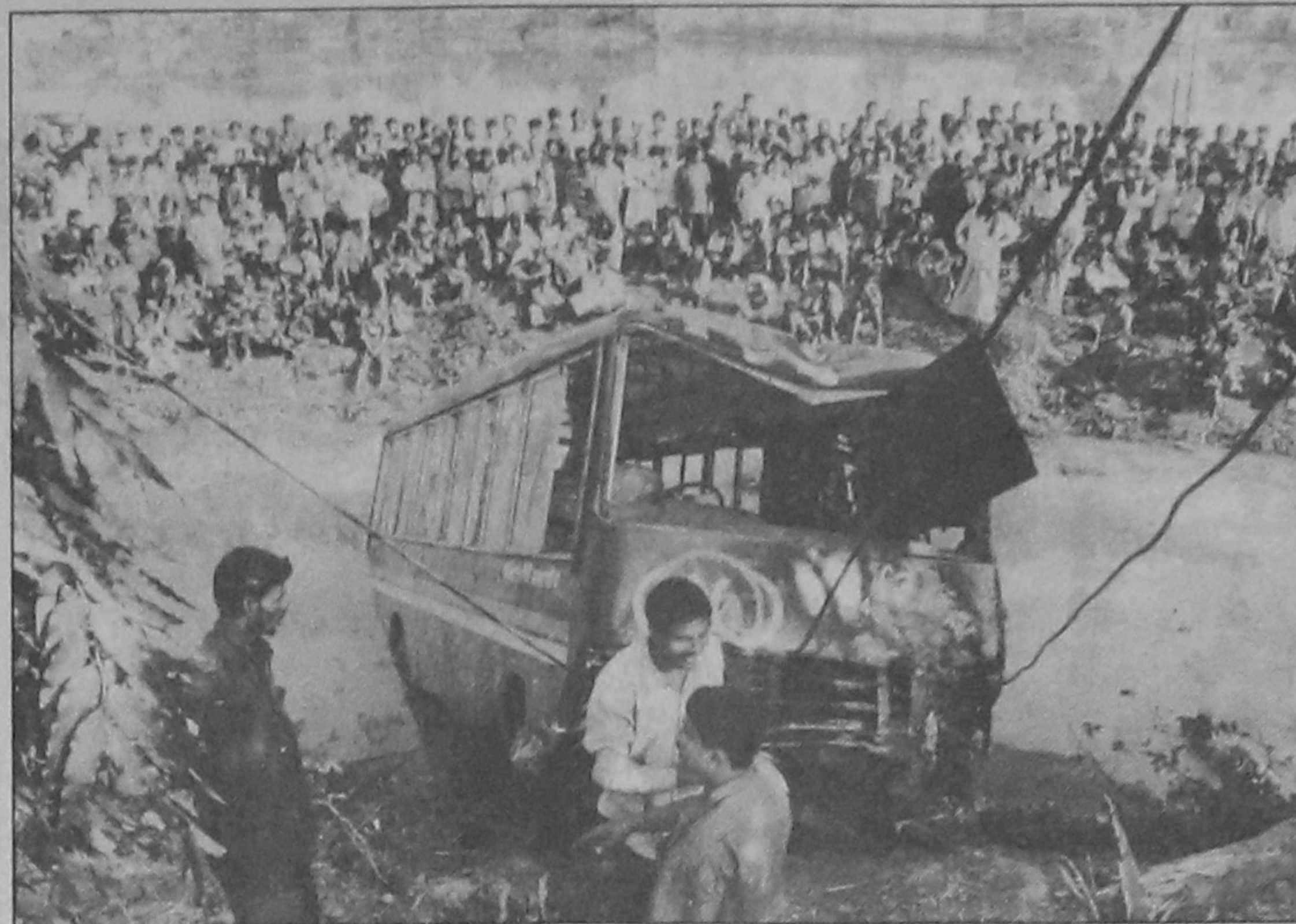
A bus fell into a ditch at the Airport Road near Khilkhet yesterday. About 100 passengers were travelling in the bus during the incident. However, no deaths were reported.

With the completion of the project, Dhaka WASA would be able to produce an additional 22.5 crore litre water regularly. At present, WASA is producing 120 crore litre water per day while the maximum demand is now about 145 crore.