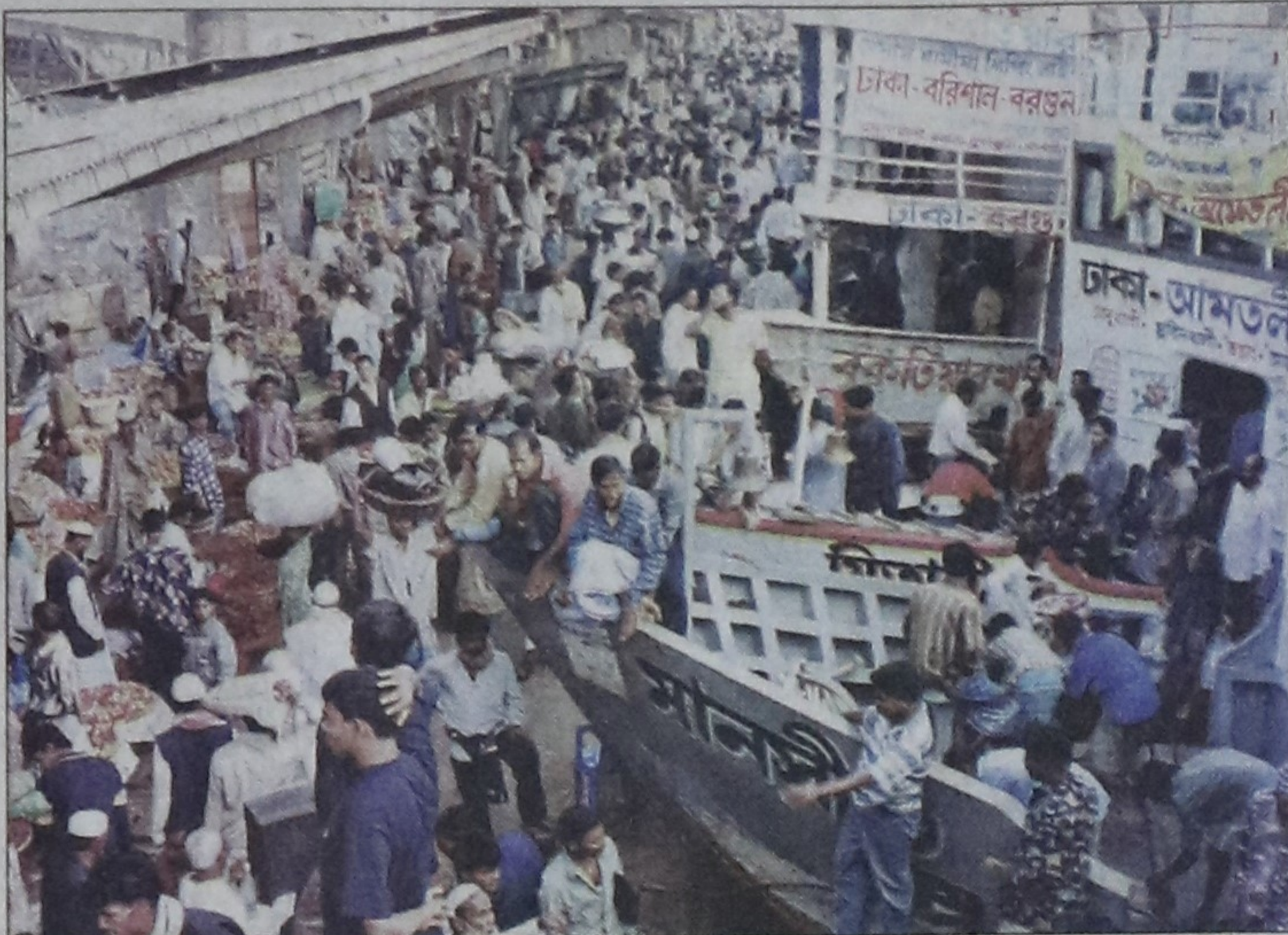
The ritual begins! It's all too a familiar sight at Sadarghat terminal, with homebound people catching their launches for the ensuing Eid festival.

Millions of city-dwellers have been looking forward to enjoying the Eid with their near and dear ones at their village homes. See page 11 col 3