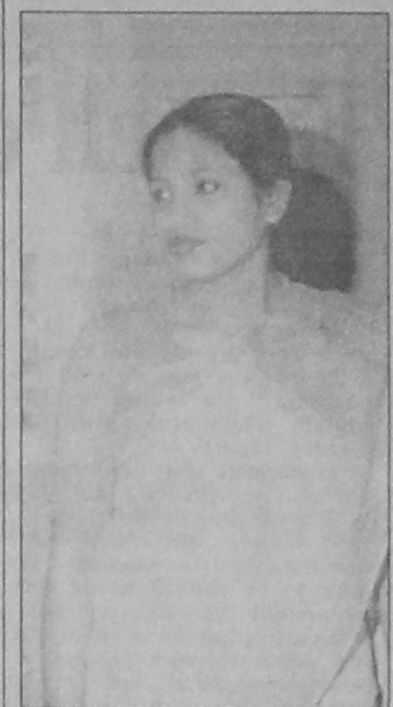
A scene from Shads Ghora

Theatre group Shomoy takes its production 'Shada Ghora' or 'White Horseto the Ganga Jamuna theatre festival to be held in Calcutta