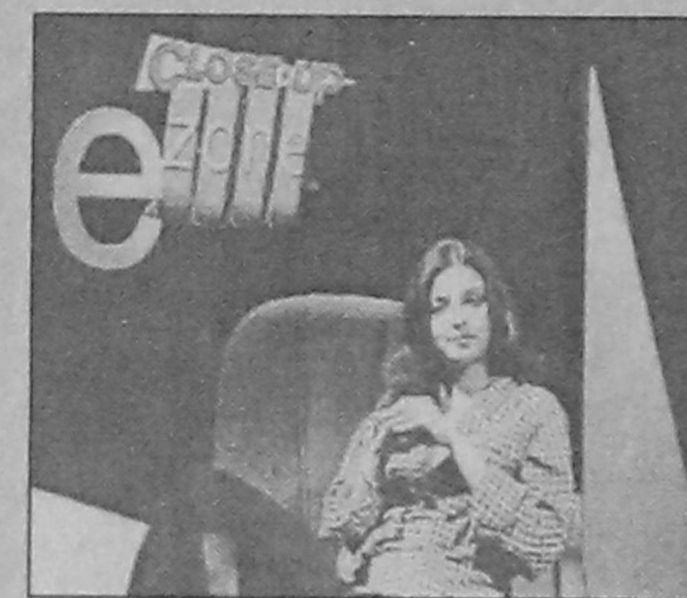
Close-up E-zone on Ekushey TV at 7 pm.

STAR PLUS 6:30 STAR Geetmala 7:30 Good Morning