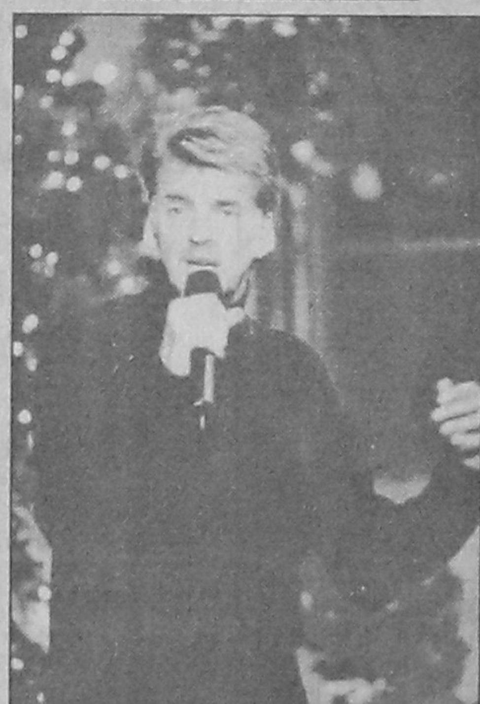
Kenny Loggins December on Star World at 10 pm.

Award-winning recording artist Kenny Loggins and his guests come together for Kenny Loggins December. Hosted by Loggins, the programme will feature performances by special guests including country superstar Clint Black. In addition to performances of holiday classics including 'White Christmas' and 'The Christmas', Loggins and special guests will perform material from Loggins' Columbia Records release 'December'.