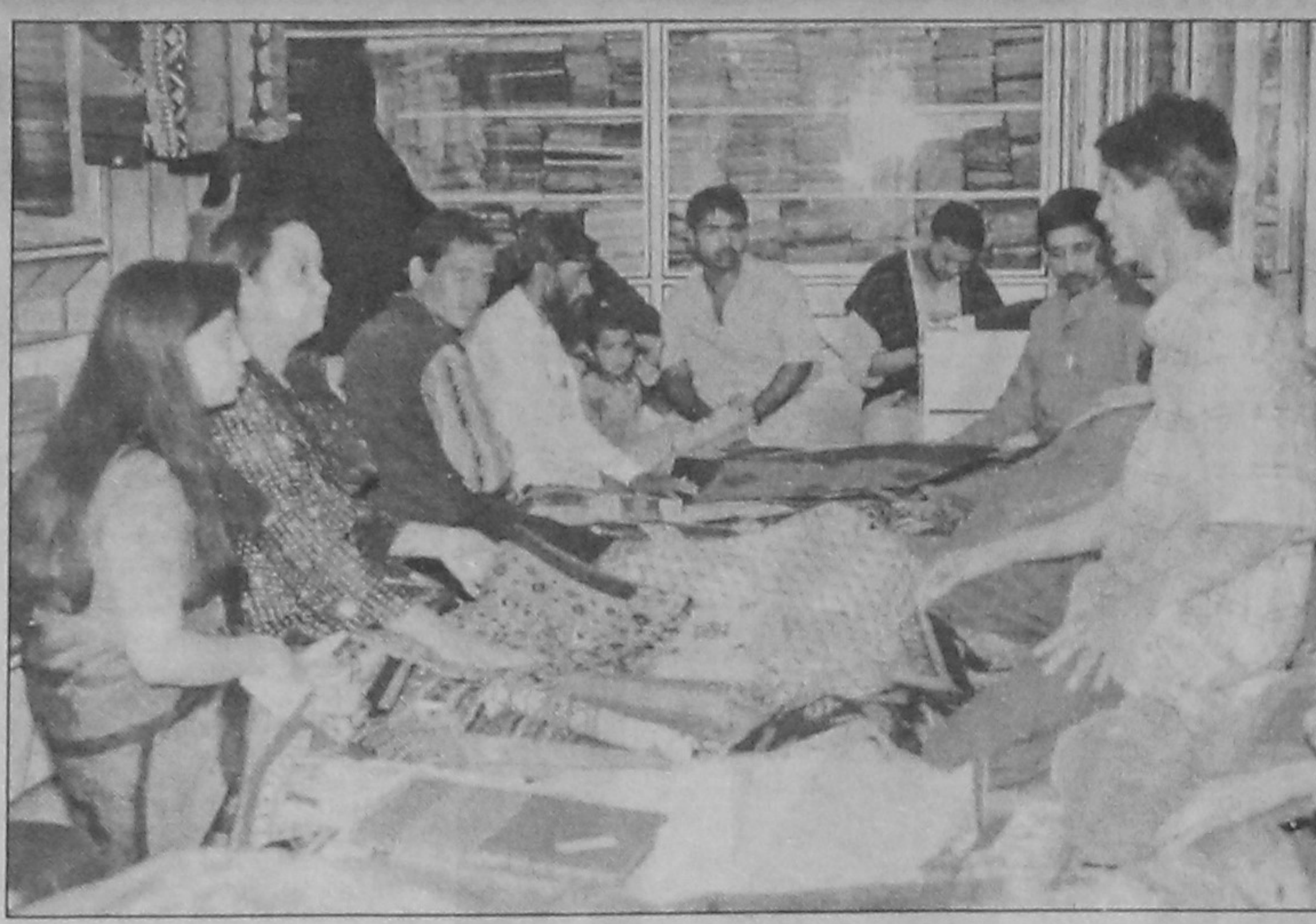
With the Eid-ul-Fitr just round the corner, prospective buyers take a look at saris at a shop in Chawk Bazaar area in Barisal town on Sunday.

However, neither any NGO, nor government agencies have come forward to combat the situation.