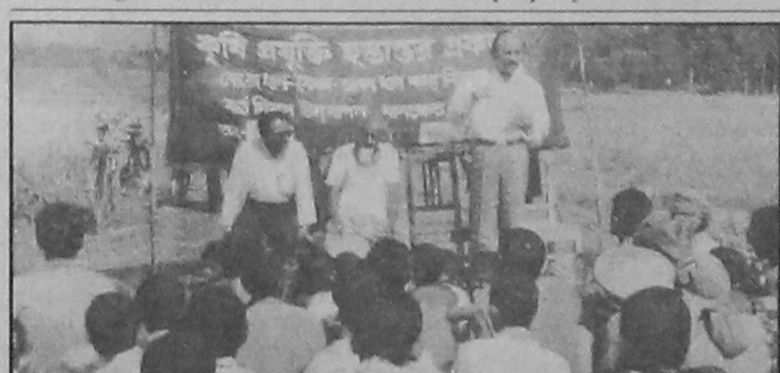
A field day was organised under the auspices of Agriculture Extension Department at village Laxmipur under Sadar upazila in Jhenidah district recently. Speakers in the function put accent on organic farming.

The school managing committees are formed mainly to motivate the guardians to send their children to schools. It is reported that many managing committees do not discharge their responsibilities properly.