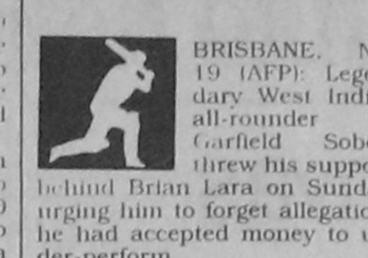
SIR GARY SOBERS

BRISBANE, Nov 19 (AFP): Legendary West Indian all-rounder Sir Garfield Sobers threw his support behind Brian Lara on Sunday, urging him to forget allegations he had accepted money to under-perform.