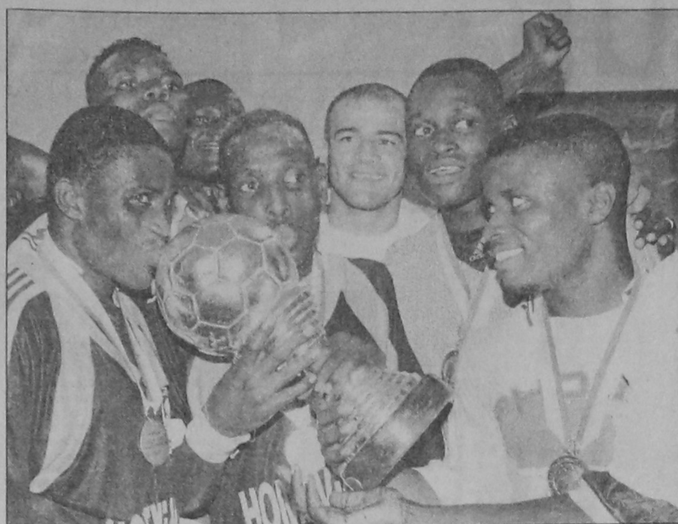
Players of Ghanaian Club Hearts of Oak kiss the African Champions League trophy after beating Tunisian side Esperance 3-1 in Accra on December 17.

Walsh 10 3 28 2 Dillon 8 2 22 2 Samuels 6 1 17 0 McLean 5 1 9 0 Adams 3 0 7 0 Black 3 0 12 0