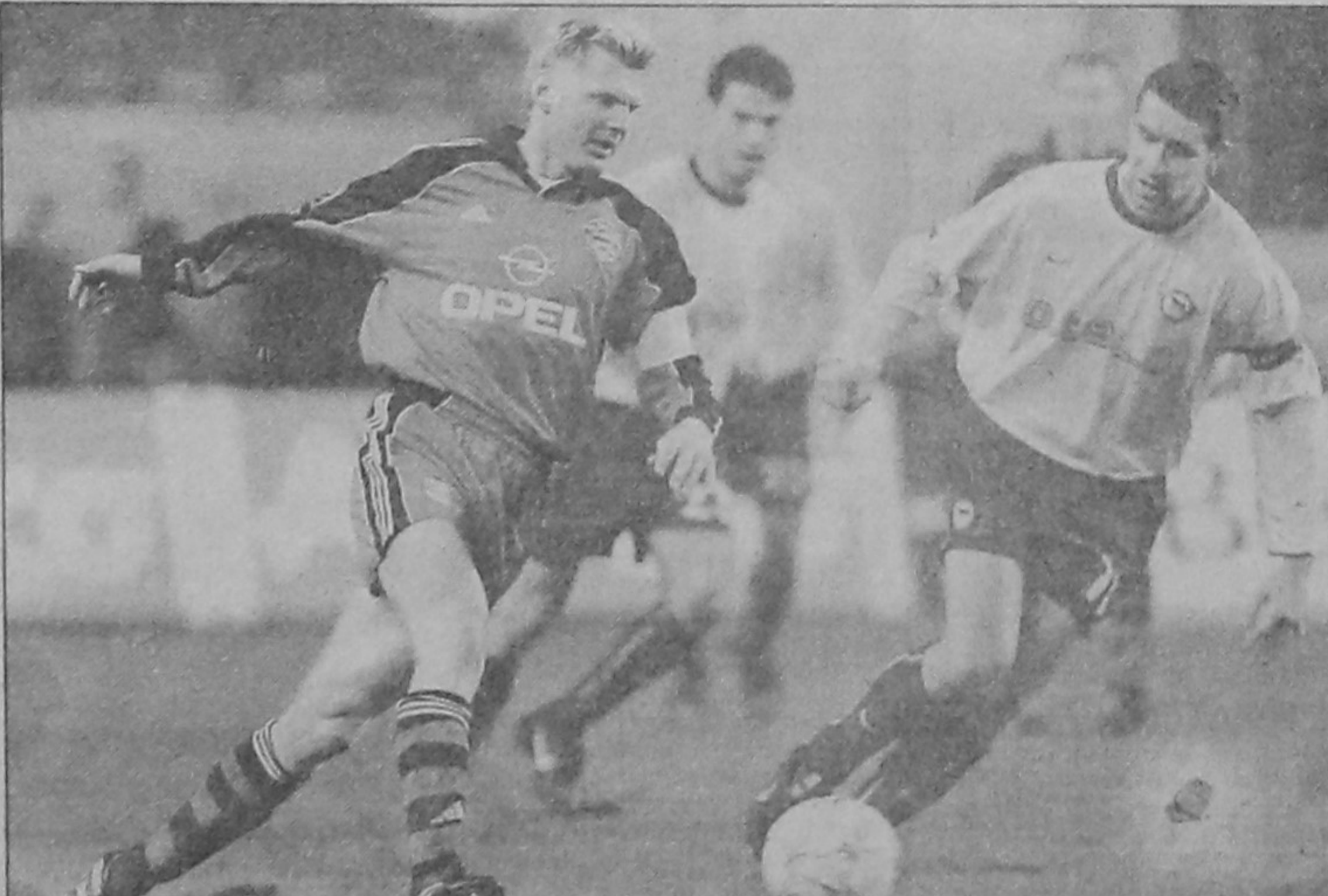
Bayern Munich's inspirational captain Stefan Effenberg (L) initiating a move against Hertha Berlin during their Bundesliga fixture at Berlin on December 17.

Barca are just sixth with 24 points from 15 games, behind Rayo Vallecano and Alaves on goal difference.