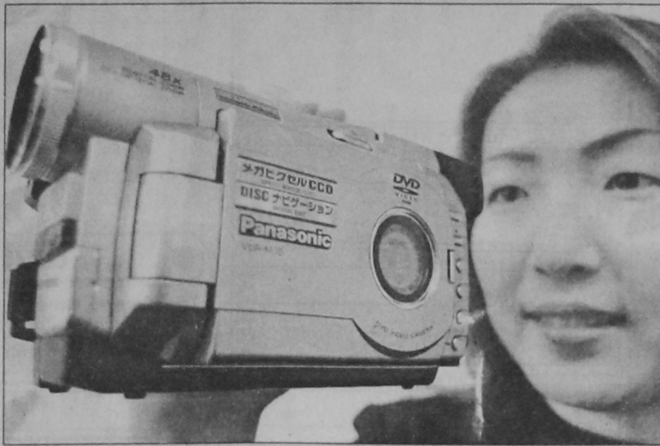
An employee of Japan's Matsushita Electric Industrial Co Ltd, known for its Panasonic and National brands, unveils its new camcorder 'DVD DIGICAM VDR-M10'...