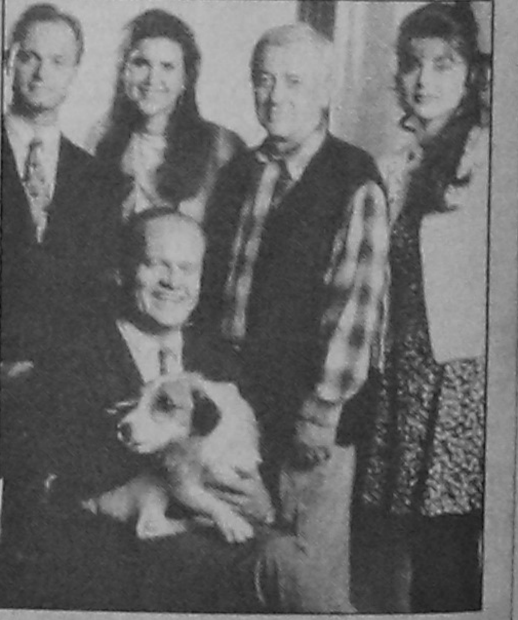
Frasier on Star World tonight at 11:30

ZEE CINEMA 2:30 Meri Dosti Tera Pyar (Abhi Bhattacharya, Geetanjali) 6:30 Jahan Pyar Mile 10:30