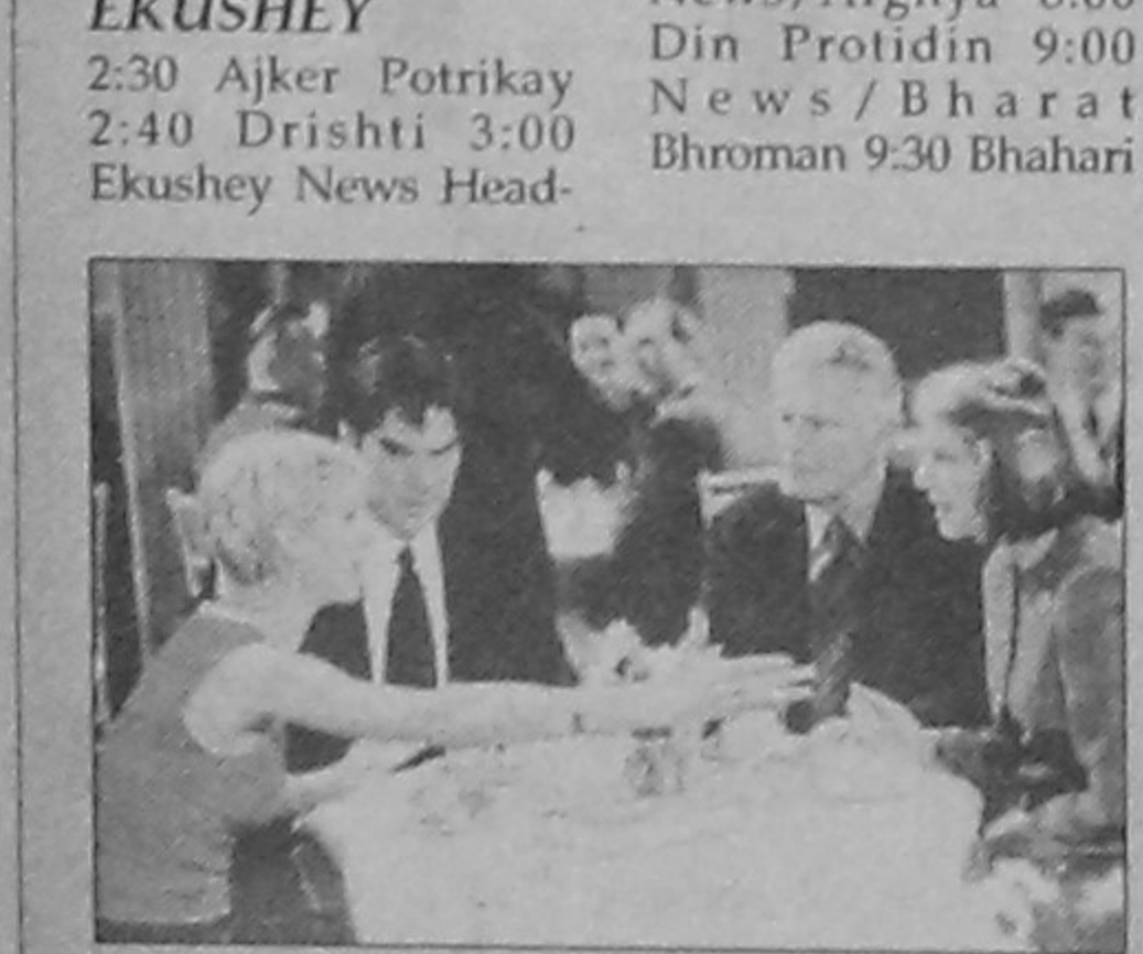
Dharma & Greg on Star World tonight at 10:30

ALPHA BANGLA TV 6:00 Aalop 7:00 Grihosajja 7:30 News/Arghya 8:00 Din Protidin 9:00 News/Bharat Bhroman 9:30 Bhahari