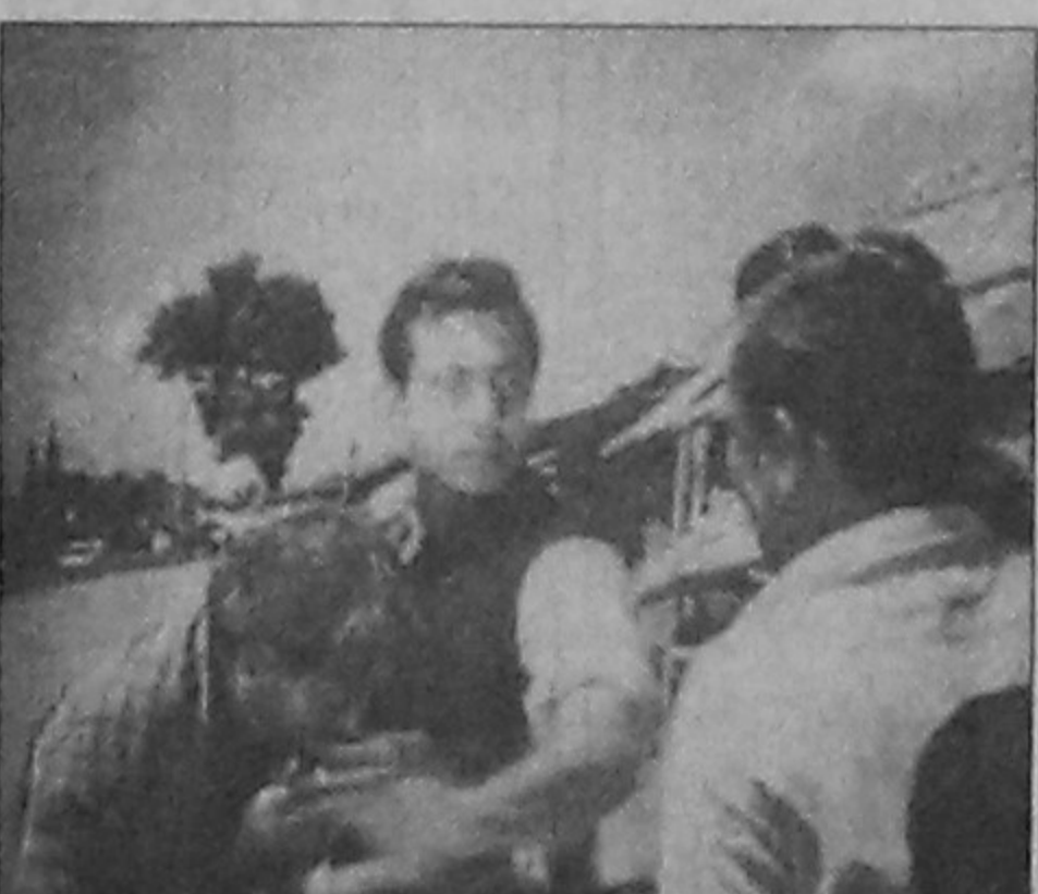
Bengali Movie Aalor Michil on Ekushey television tonight at 8:30

6:00 Chupa Rustom 6:30 Star Geetmala 7:30 Good Morning India 8:30 Cine Jharokha 9:00 Hit Ya Fit 9:30 Star Morning Show 12:30 Hit Ya Fit 1:00 TSN 1:30 Tanha 2:00 Meri Saheli 2:30 Saans 3:00 Kalash 3:30 Small Wonder 4:00 Kyunki Saas Bhi Kabhi Bahu Thi 4:30 Cine Jharokha 5:00 Yit Ya Fit