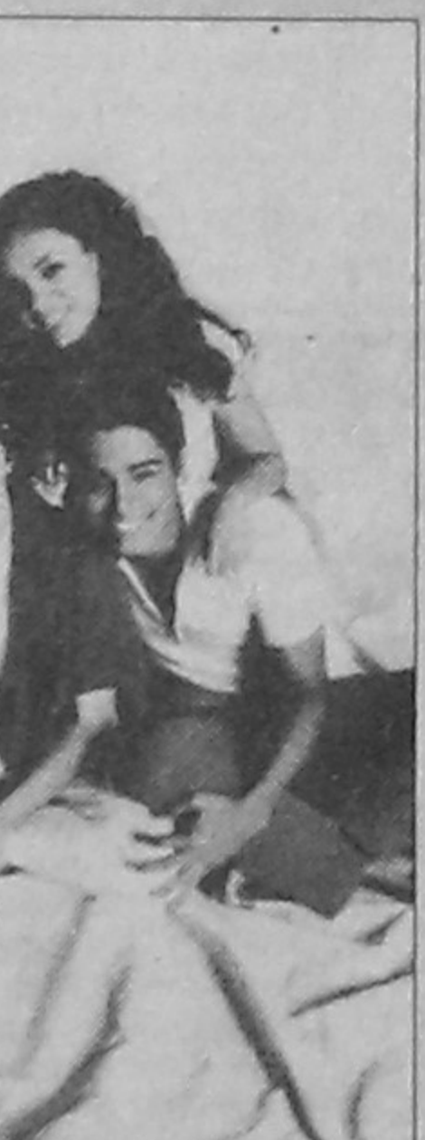
That 70's Show on Star World tonight at 10

6:00 Hollywood Squares 6:30 The News WKRP in Cincinnati