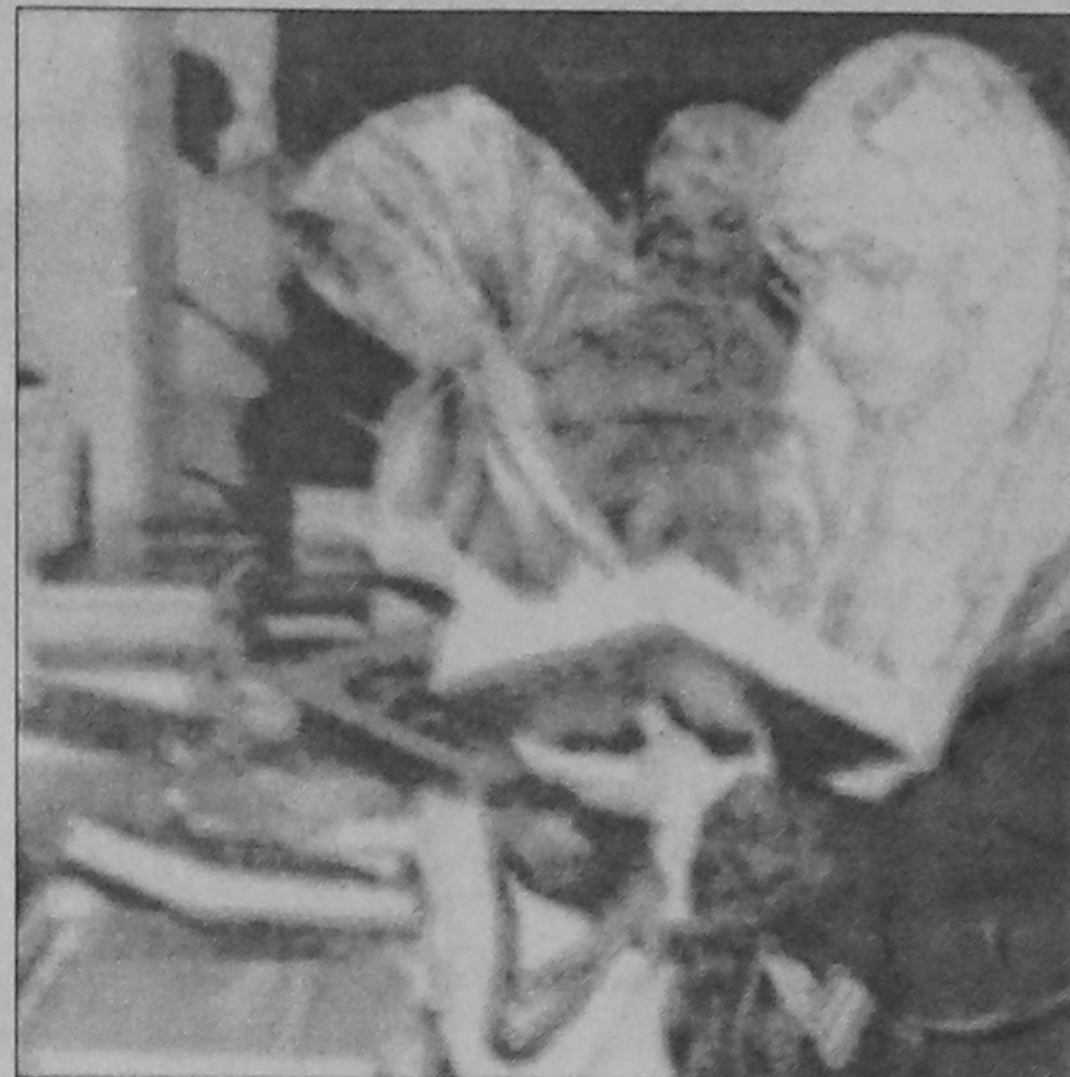
A section of the visitors sort out the holy book at the exhibition.

There are two copies of Quran translated with commentaries by T.B. Irving being displayed at the