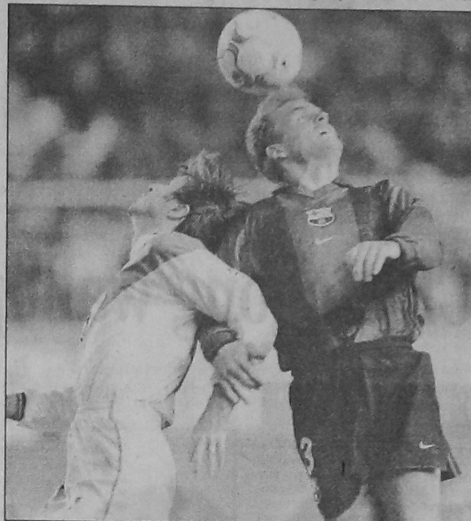
Frank de Boer (R), Barcelona's Dutch international locked in a tussle with Bolic of Rayo Vallecano during their Primera Liga fixture at Madrid on December 16.