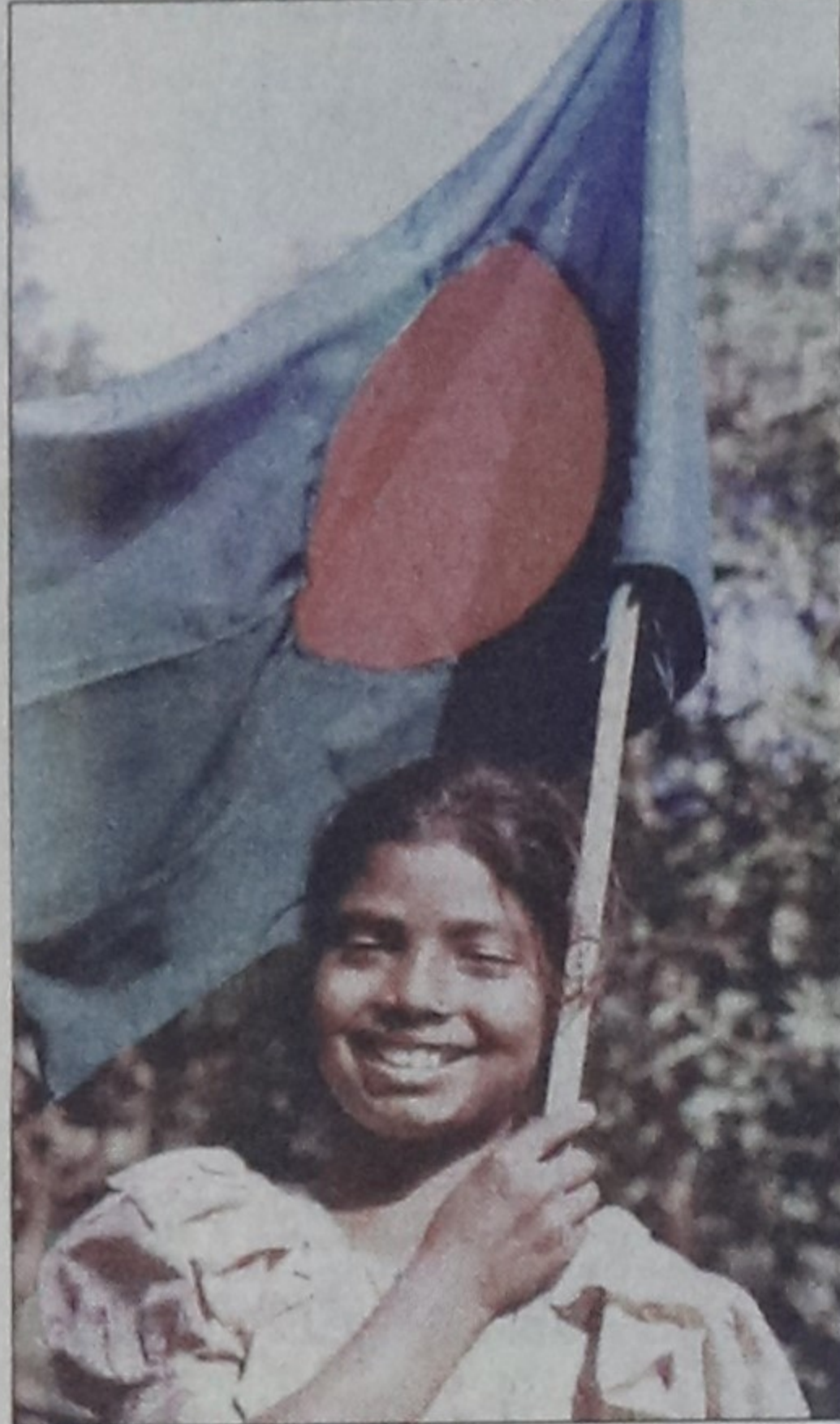
Face of freedom

He will accord a reception, followed by iftar, at Bangabhaban. Prime Minister Sheikh Hasina will attend the function. The Prime Minister will also visit Bangabandhu Museum and garland the portrait of See page 11 col 1