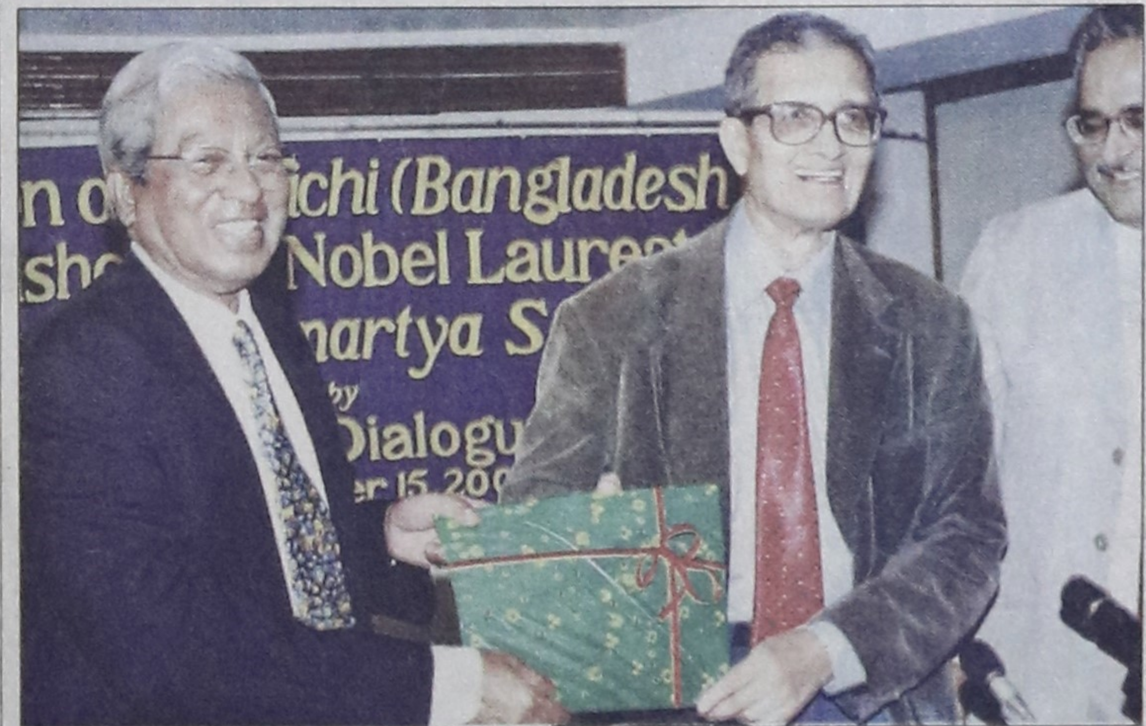
Nobel laureate Professor Amartya Sen hands over the documents of Pratichi Trust to BRAC chief Fazle Hasan Abed at the trust's launching ceremony at the BRAC centre yesterday.

The trustees will soon devise plans for the Trust. See page 11 col 4