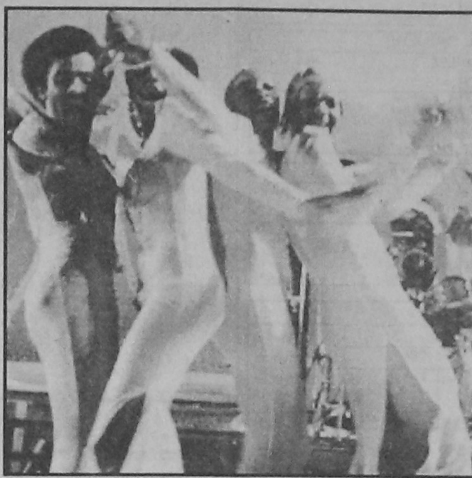
Boney M in Germany and a Top-10-Hit in December 1976 in the 1984 on Eye Dance. In May 1977, "Ma Baker" just