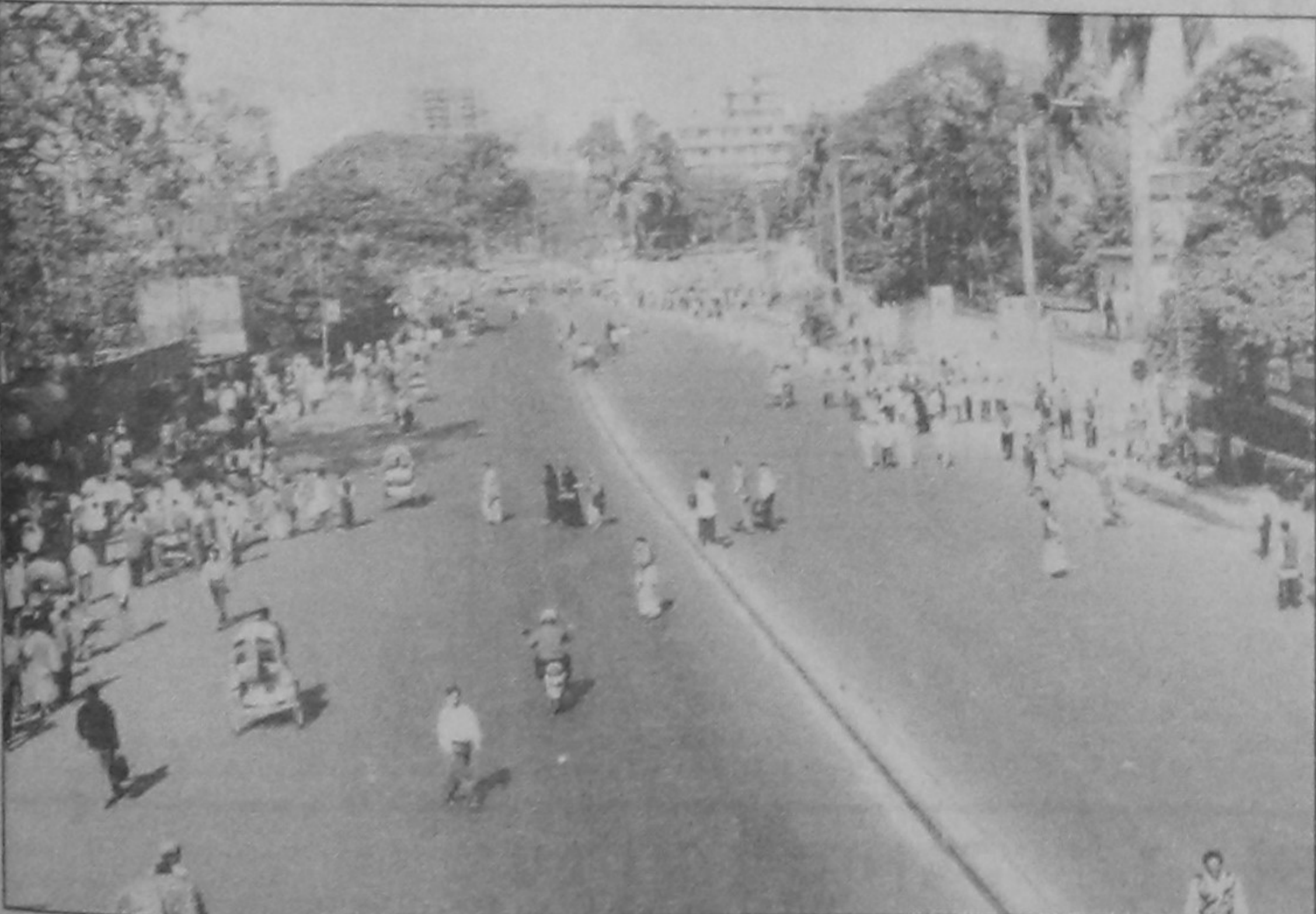
The usually busy stretch of road from Shahbagh to Sheraton Hotel sported a deserted look.