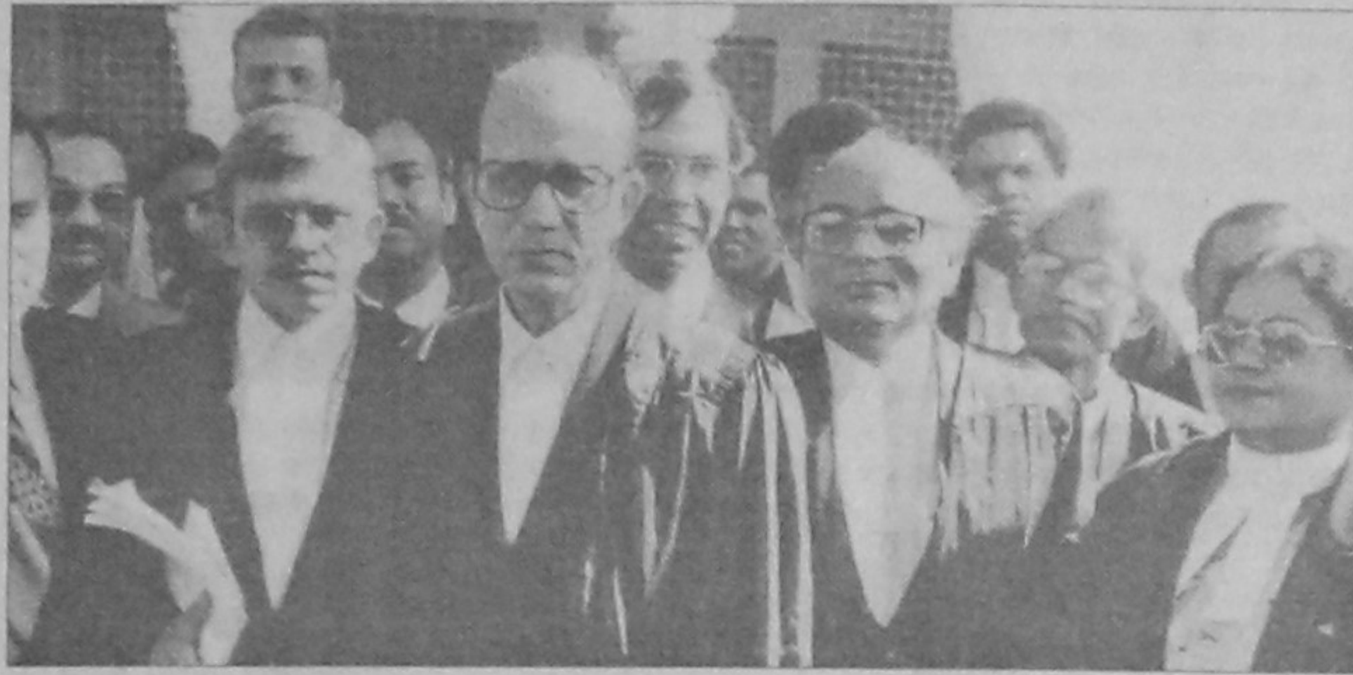
Defence lawyers come out of the court after pronouncement of the split verdict.

In the result, the Death Reference No. 30 of 1998 is accepted in respect of all the accused mentioned above.