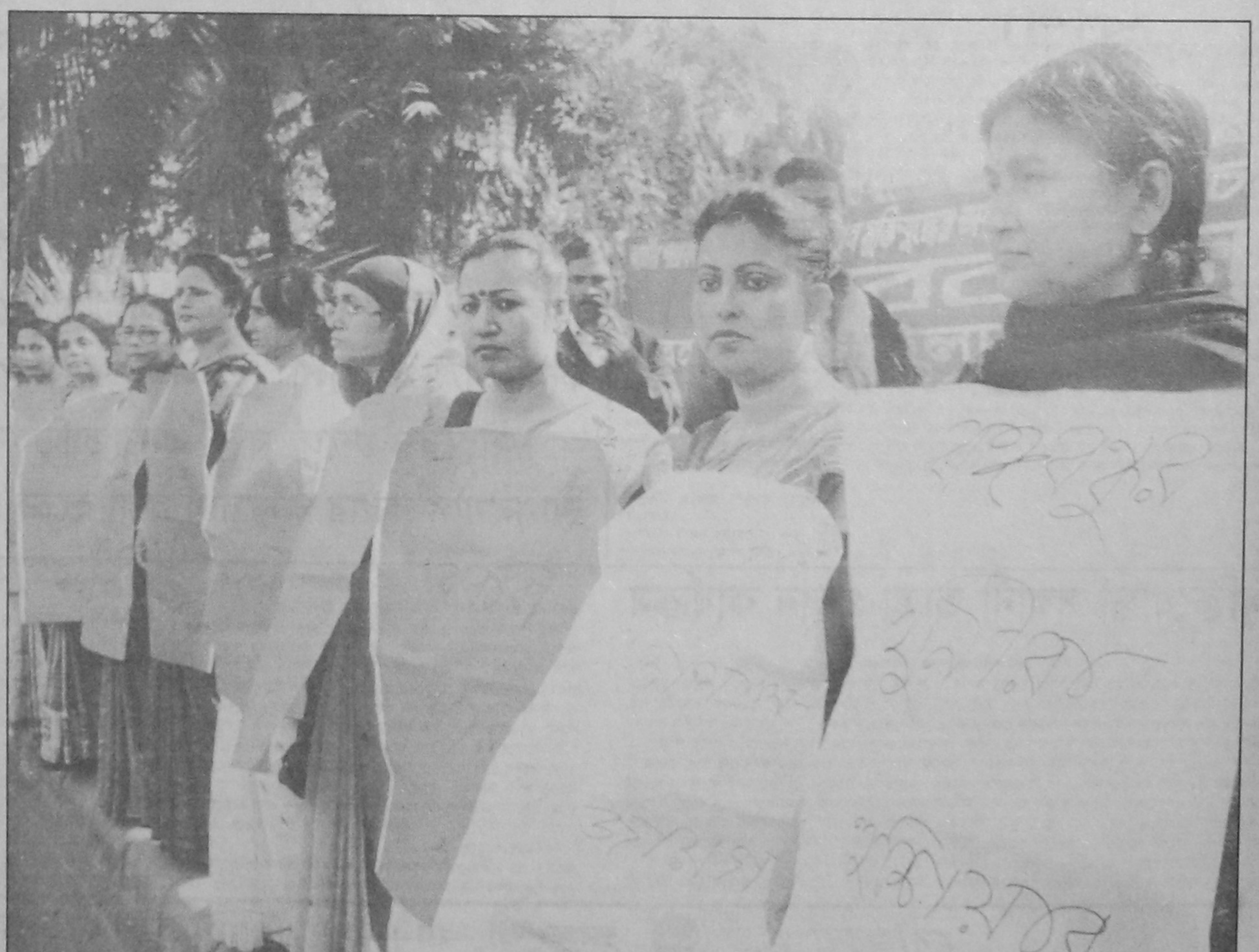
Echoing public sentiment ... a human chain spells its expectations clear