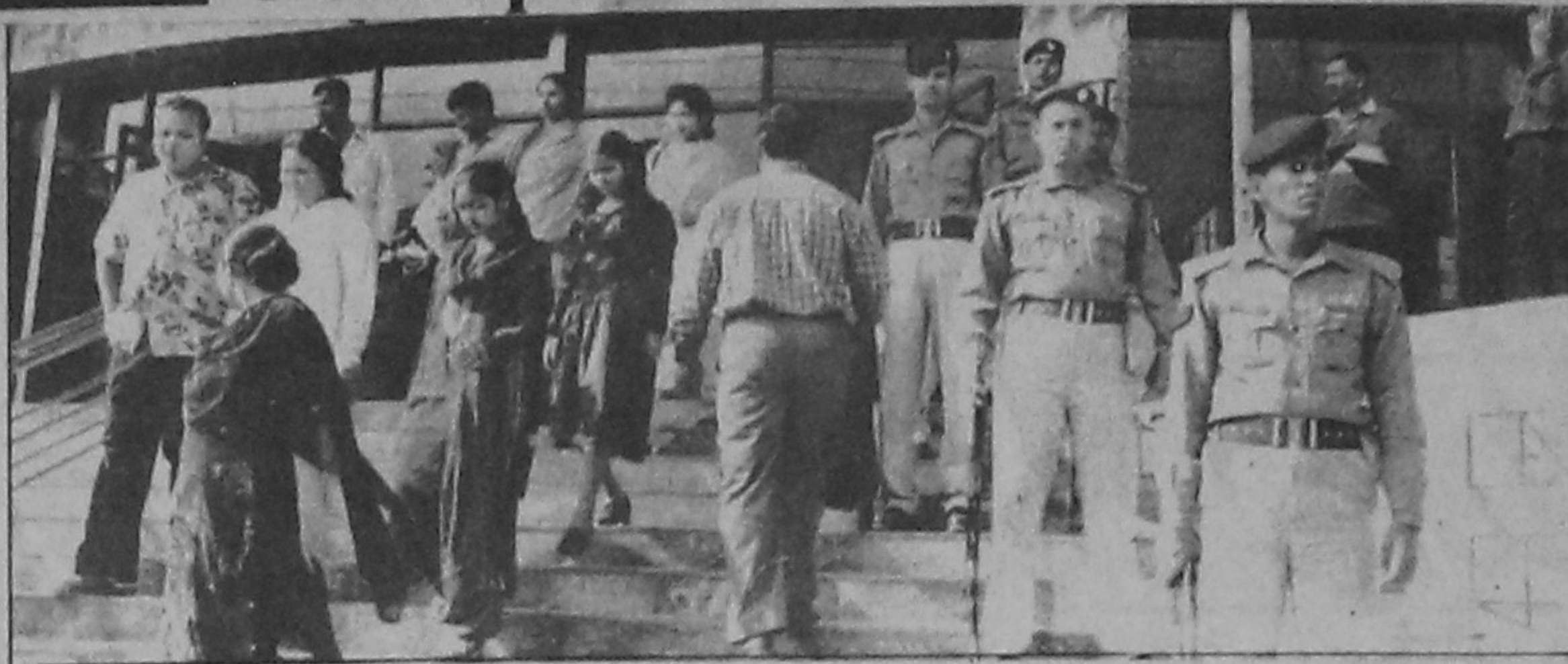
Extra police have been assigned to different shopping centres around the city to check crime and mugging incidents before Eid. Picture shows police in front of Karnafuli Garden City Shopping Complex in city's busy Kakrail area.