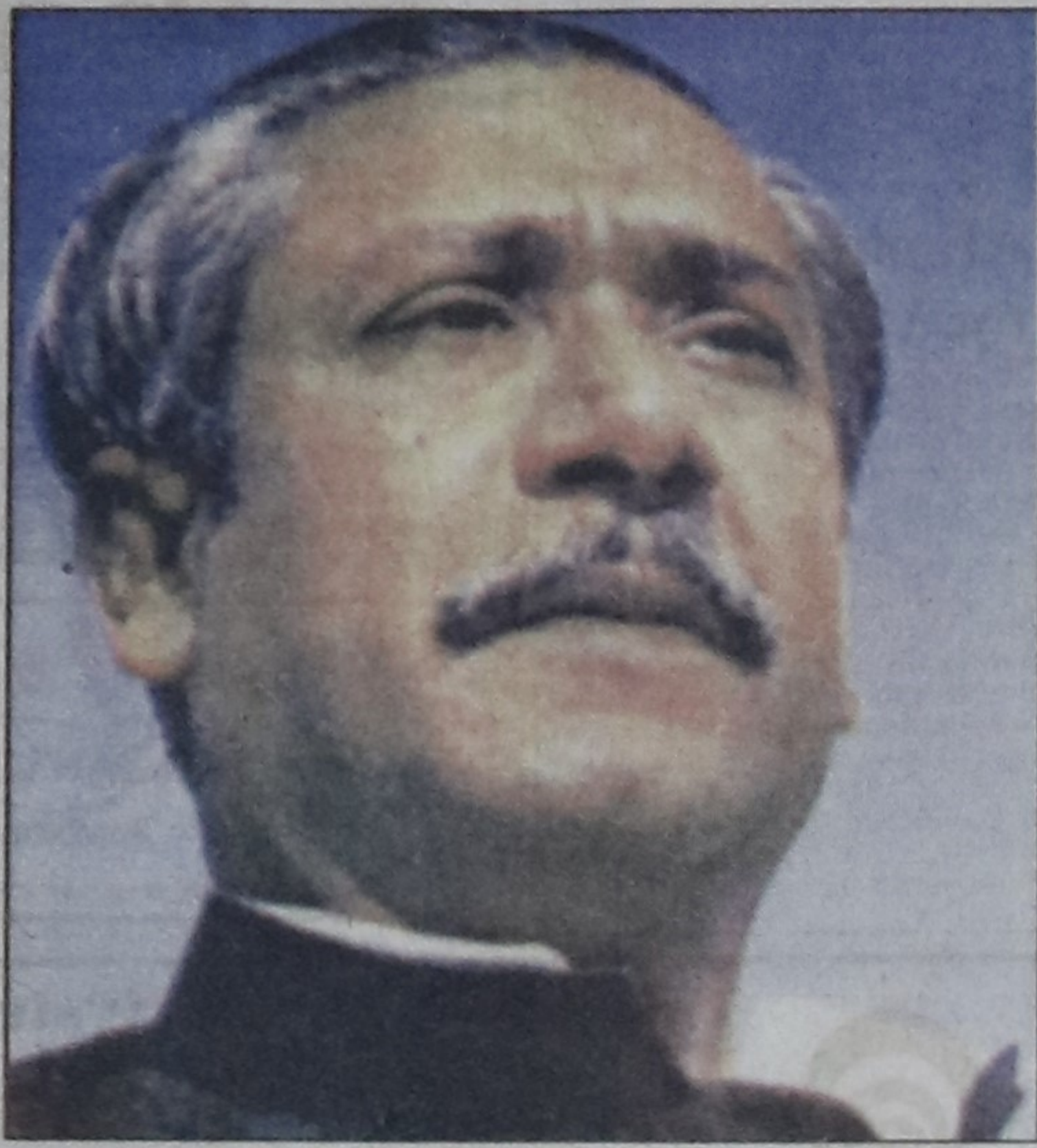
Bangabandhu Sheikh Mujibur Rahman

Text of HC order on page 9; See Editorial page 4