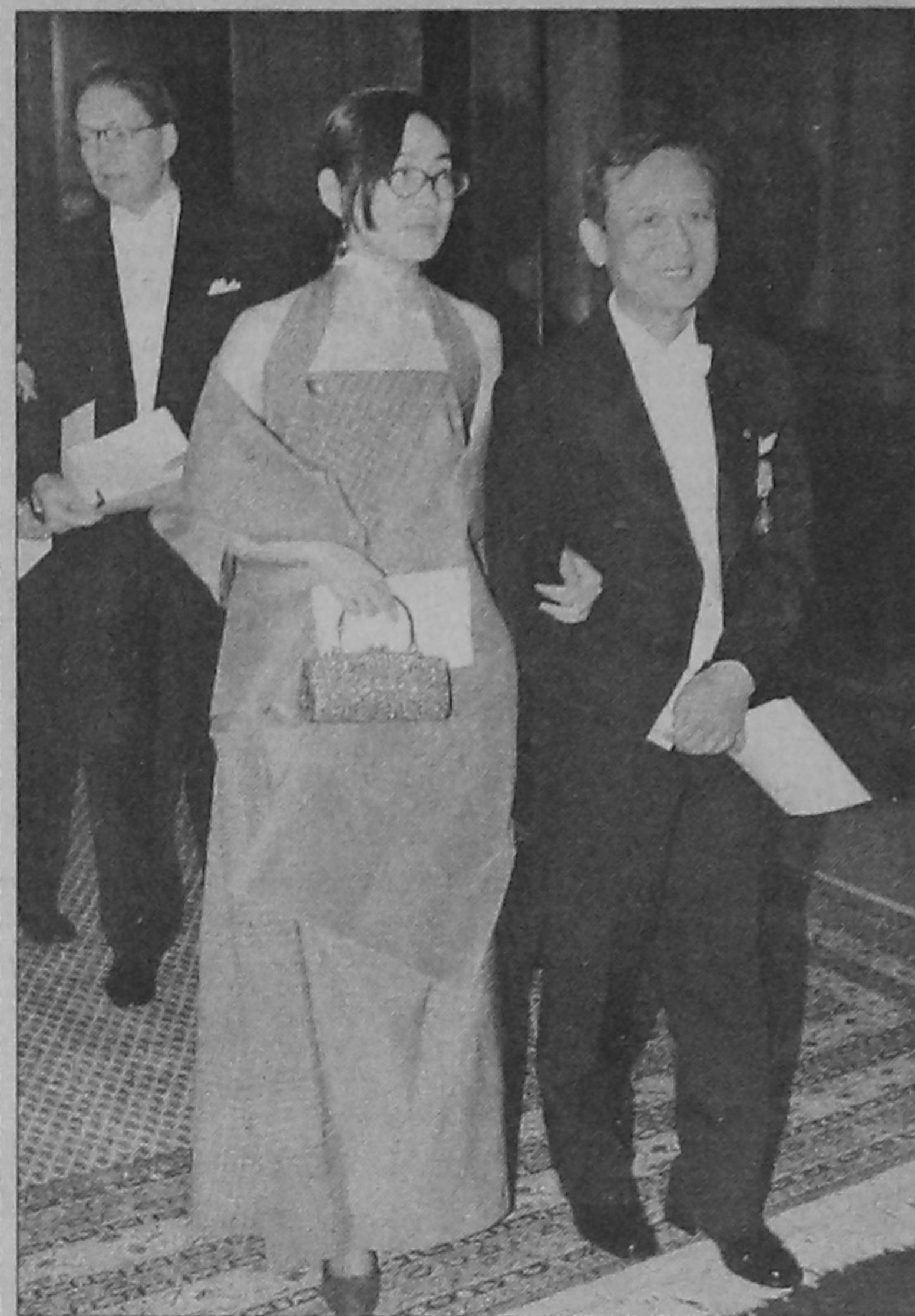
Nobel laureate in literature Chinese born Gao Xingjian (R) arrives with Celine Yang at the Stockholm Royal Palace 11 December 2000, for the traditional gala dinner.