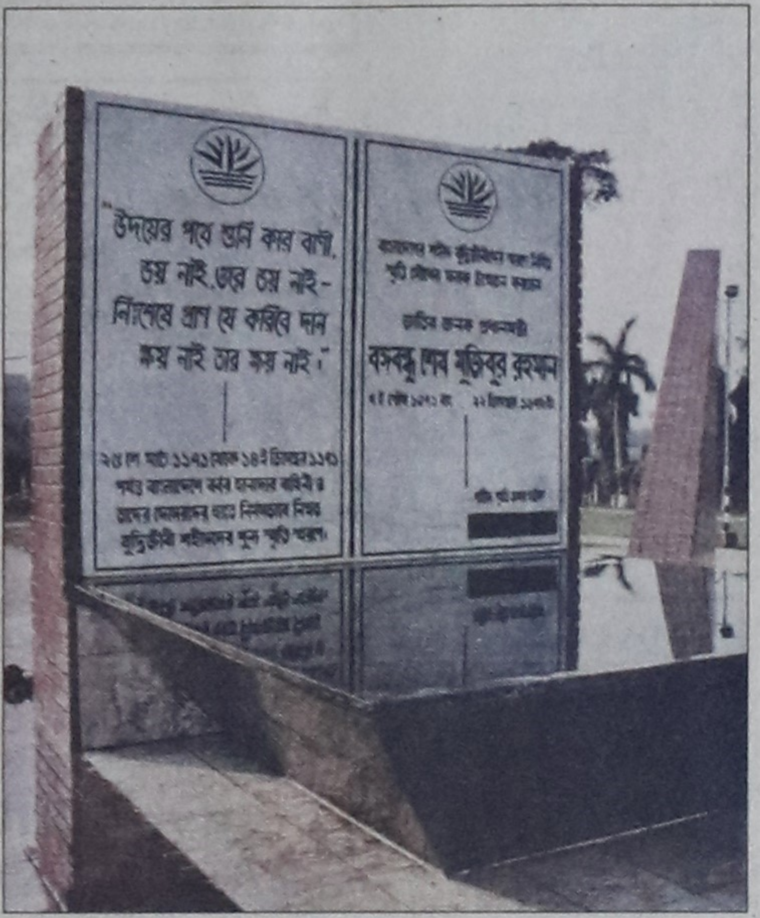
Burning bright...thousands will throng the Martyred Intellectuals' Memorial today to pay homage to the intellectuals.