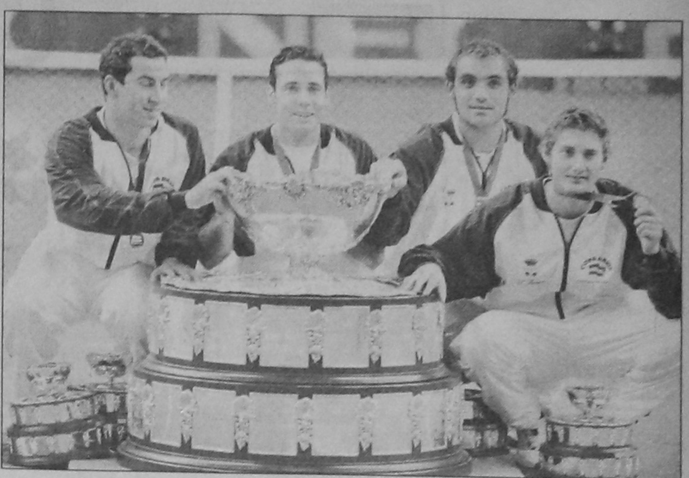
Spanish players (L-R) Albert Costa, Alex Corretja, Joan Balcells and Juan Carlos Ferrero pose with the Davis Cup Trophy after defeating Australia in the final in Barcelona on December 10.

Man-of-the-match: Shahadat Hossain (Barisal).