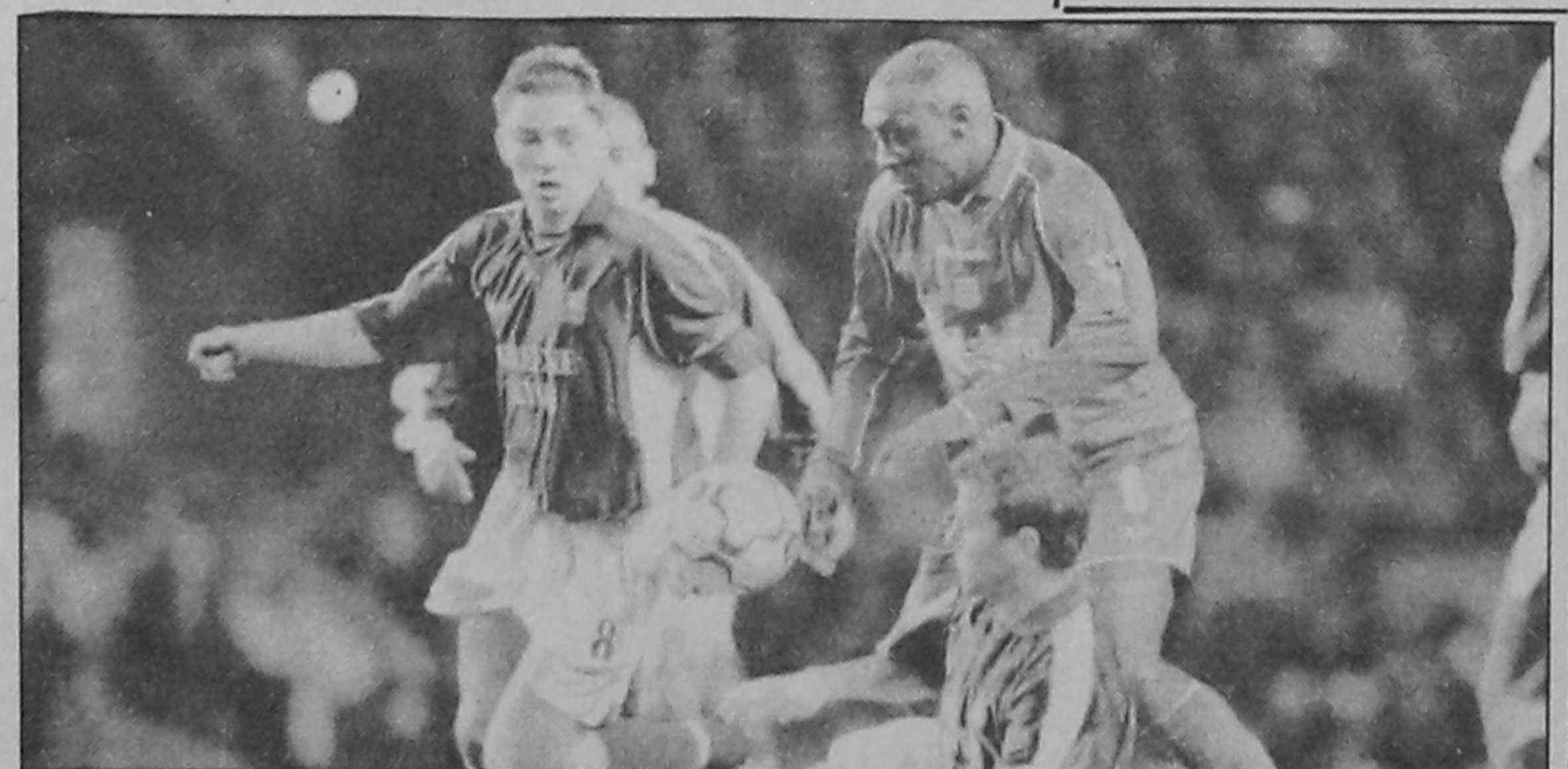
Liverpool striker Emile Heskey trying to burst through the Ipswich defence during their Premiership match at Liverpool on December 10.

Placente has an Italian passport meaning he will not be restricted by quotas of foreigners outside the European Union (EU).