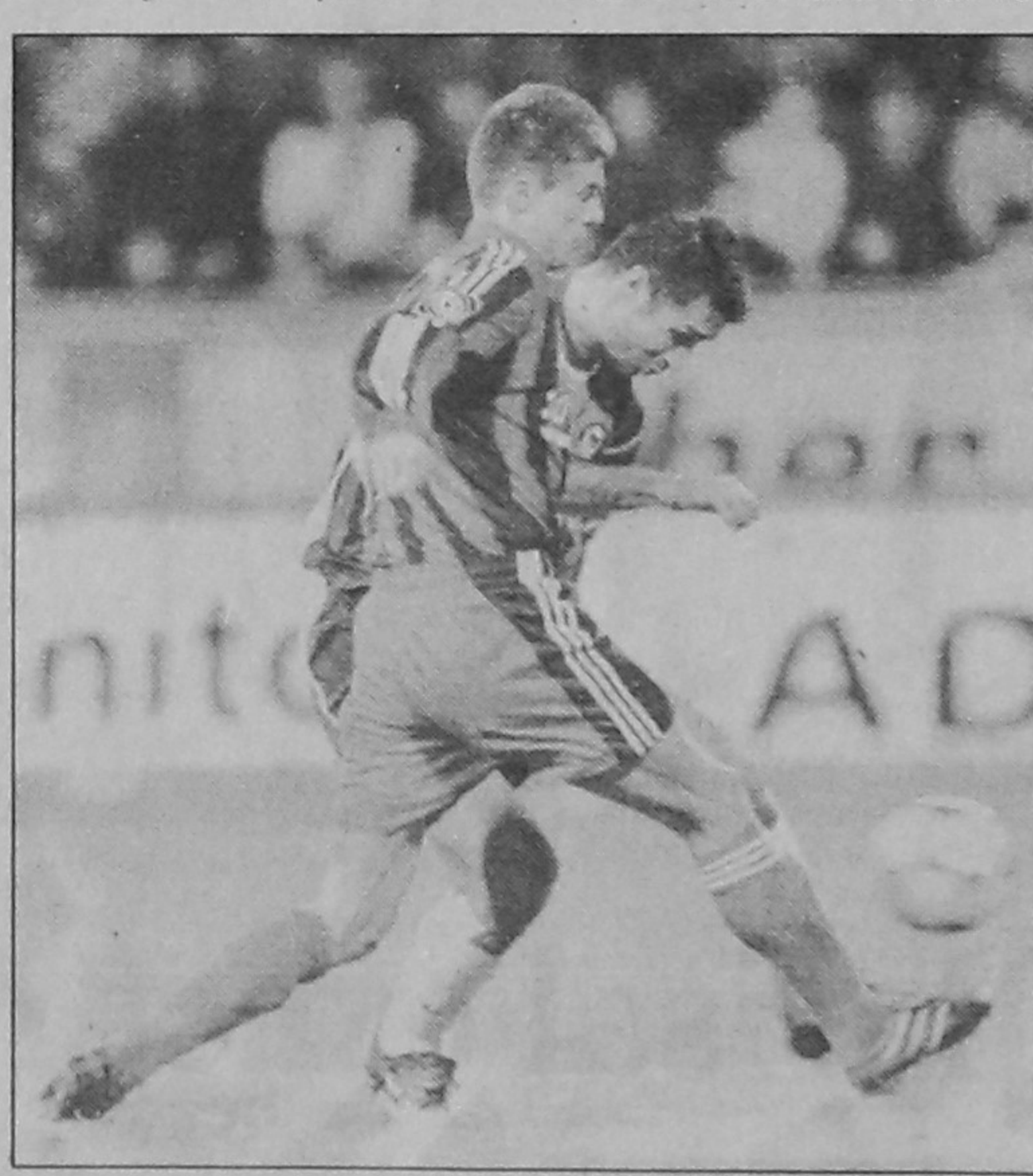
Hertha Berlin's Iranian international striker Ali Daei (R), being checked by Bayer Leverkusen defender Boris Zivkovic during their Bundesliga fixture on December 10.

Leverkusen, without German international sweeper Jens Nowotny and playmaker Michael Ballack, both injured, ended a run of three home de-