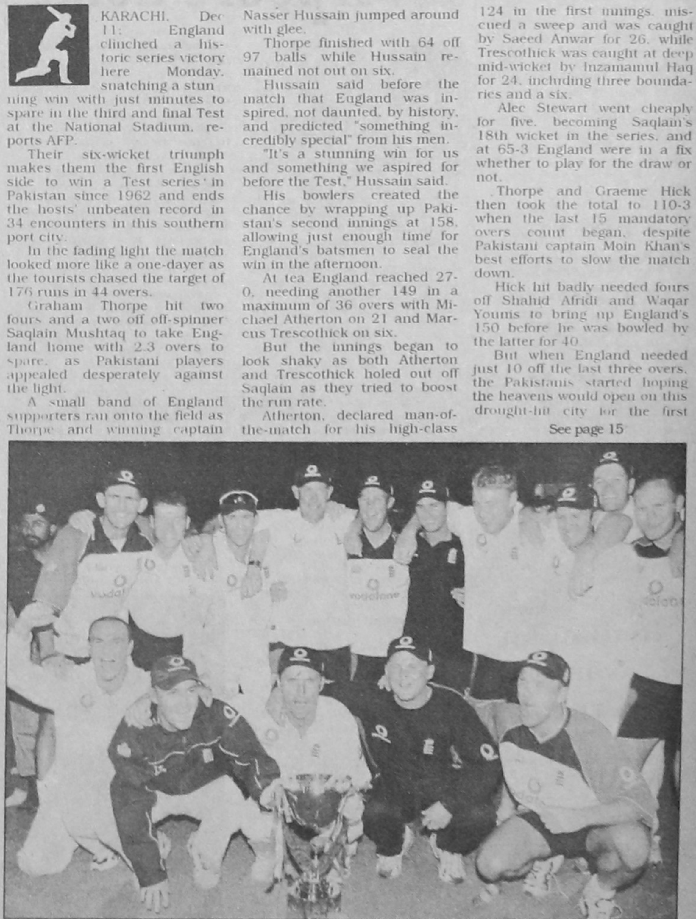
The victorious England cricketers pose with the Pepsi trophy after they won the Test series against Pakistan at the National Stadium in Karachi yesterday.