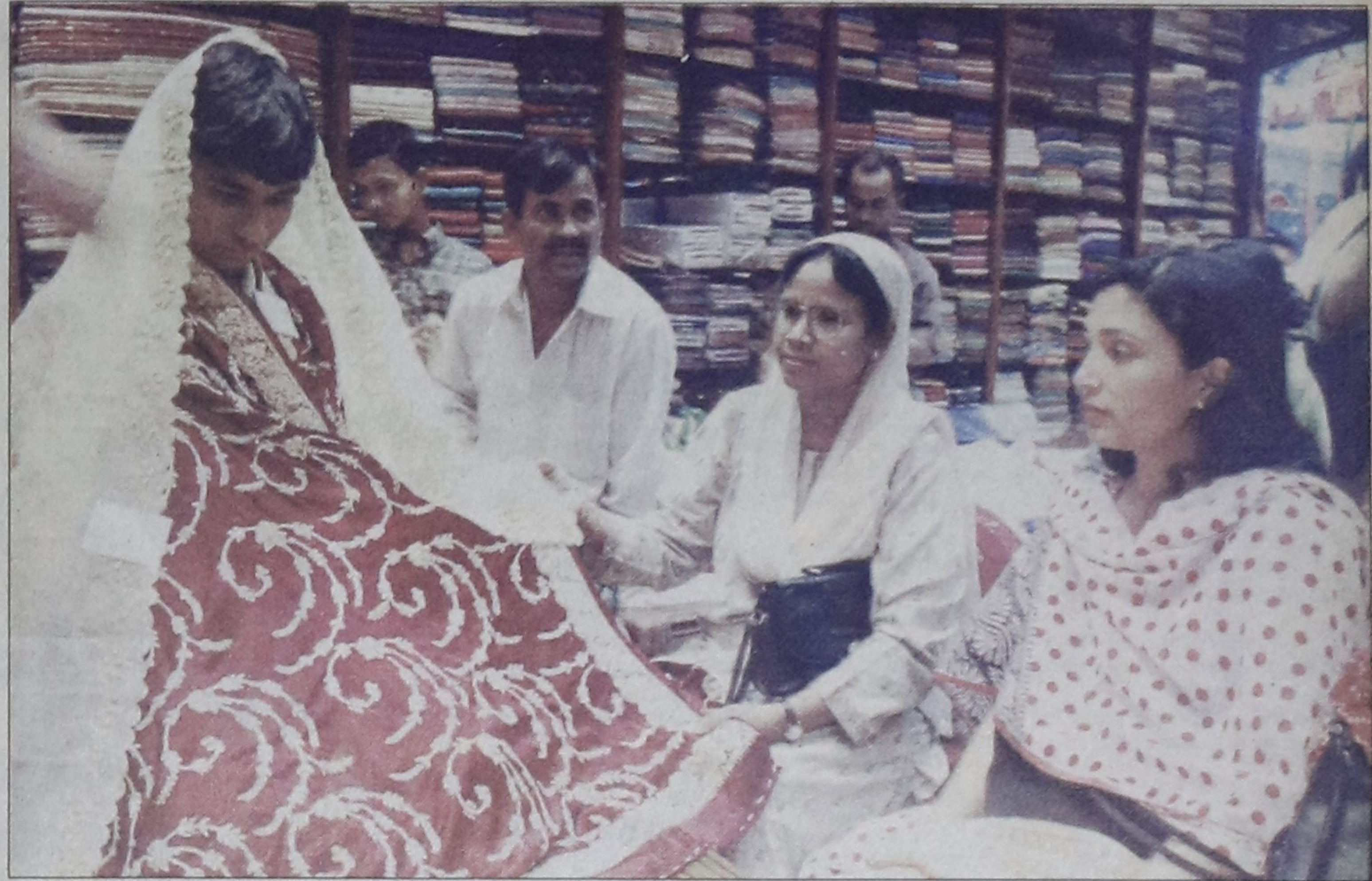
Eid craze: A shopkeeper demanded Tk one lakh for this gorgeous maroon-colour saree at the city's Rainak shopping mall yesterday.