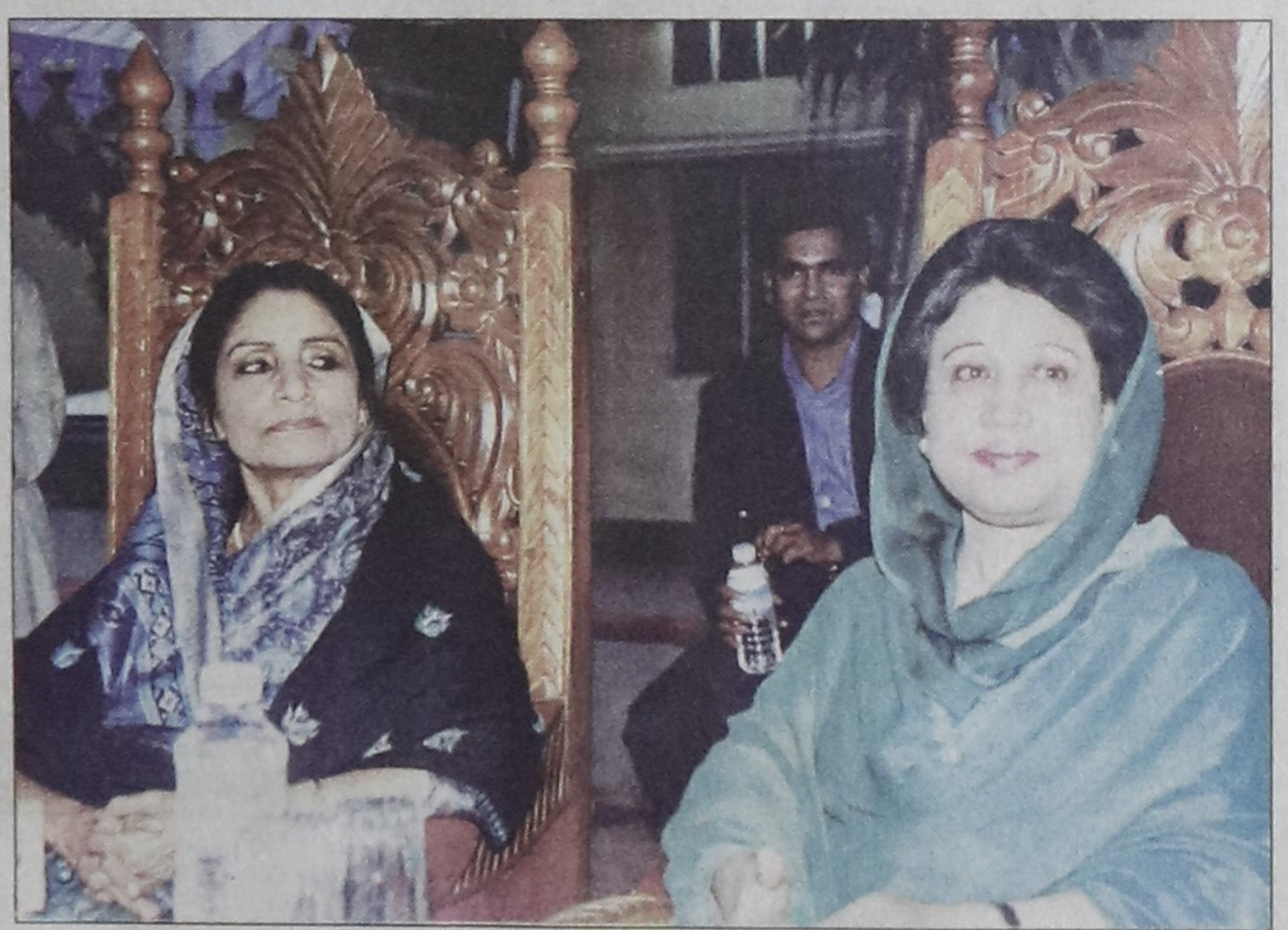
BNP chairperson Khaleda Zia and JP senior presidium member Begum Rawshan Ershad at an iftar party hosted by Jatiya Party in the city yesterday.