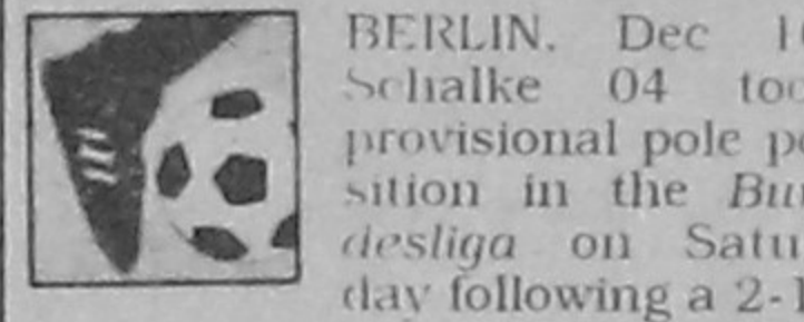
BERLIN, Dec 10: Schalke 04 took provisional pole position in the Bundesliga on Saturday following a 2-1 home victory against basement club VfB Stuttgart, reports AFP.

Borussia Dortmund, twice Bundesliga champions and European Cup winners in the last decade before their form dipped after coach Ottmar Hitzfeld left for Munich, are in second spot after a 3-0 victory over Unterhaching.