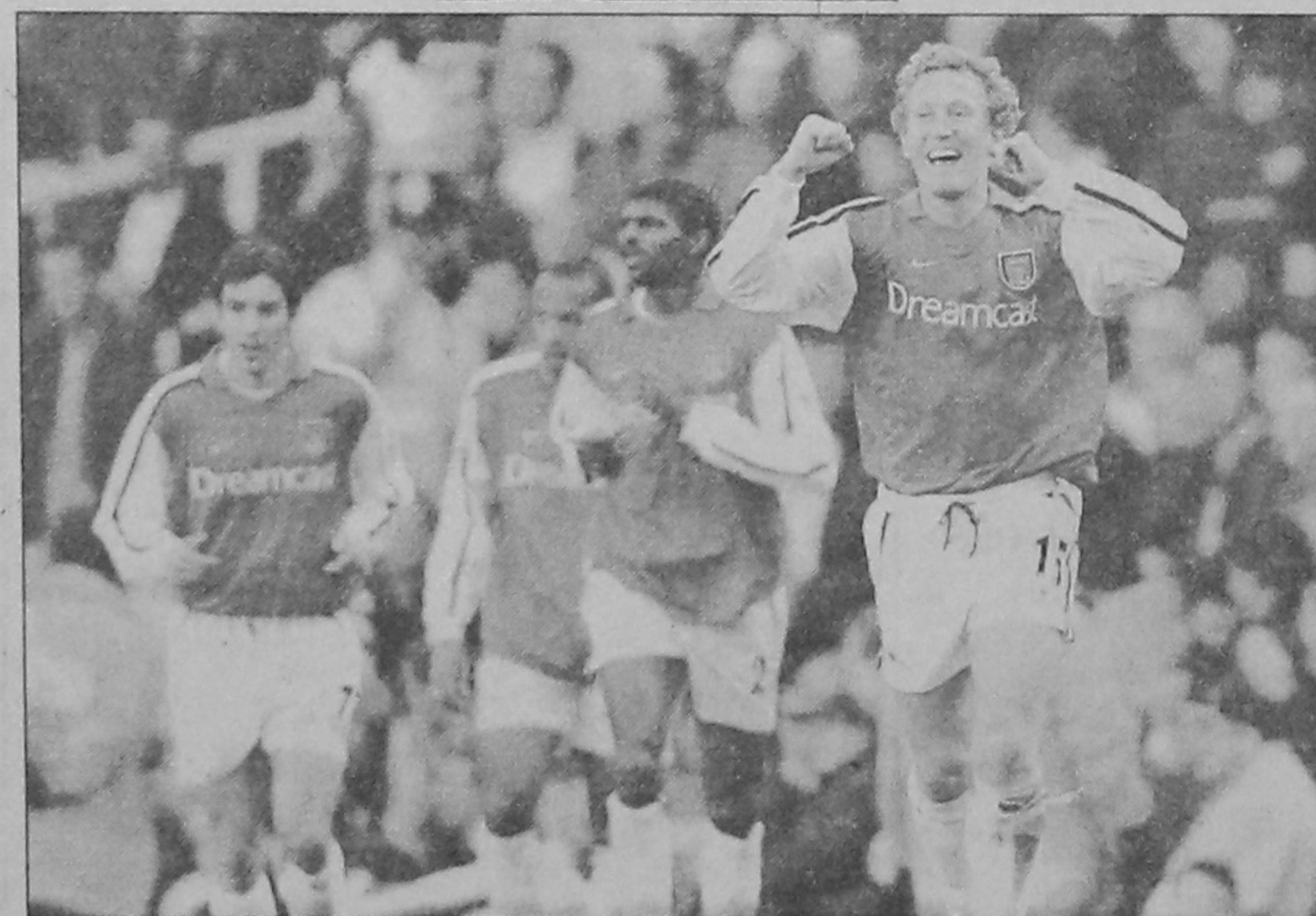
Ray Parlour (R), the Arsenal midfielder, exults after scoring one of his three goals in the Premiership game against Newcastle United at Highbury on December 9.

Iraq sit in Group 6 alongside Kazakhstan, Macau and Nepal, with the qualifiers commencing on 25 March 2001.