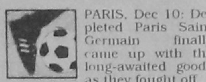
PARIS, Dec 10: Depleted Paris Saint Germain finally came up with the long-awaited goods as they fought off Metz for a 1-0 win in coach Luis Fernandez's first match in charge at the Parc des Princes, reports AFP.

The capital side, who were reduced to 10 men early in the second half, held on to the slim 1-0 goal lead thanks to international forward Nicolas Anelka, but were lucky to escape with all three points.