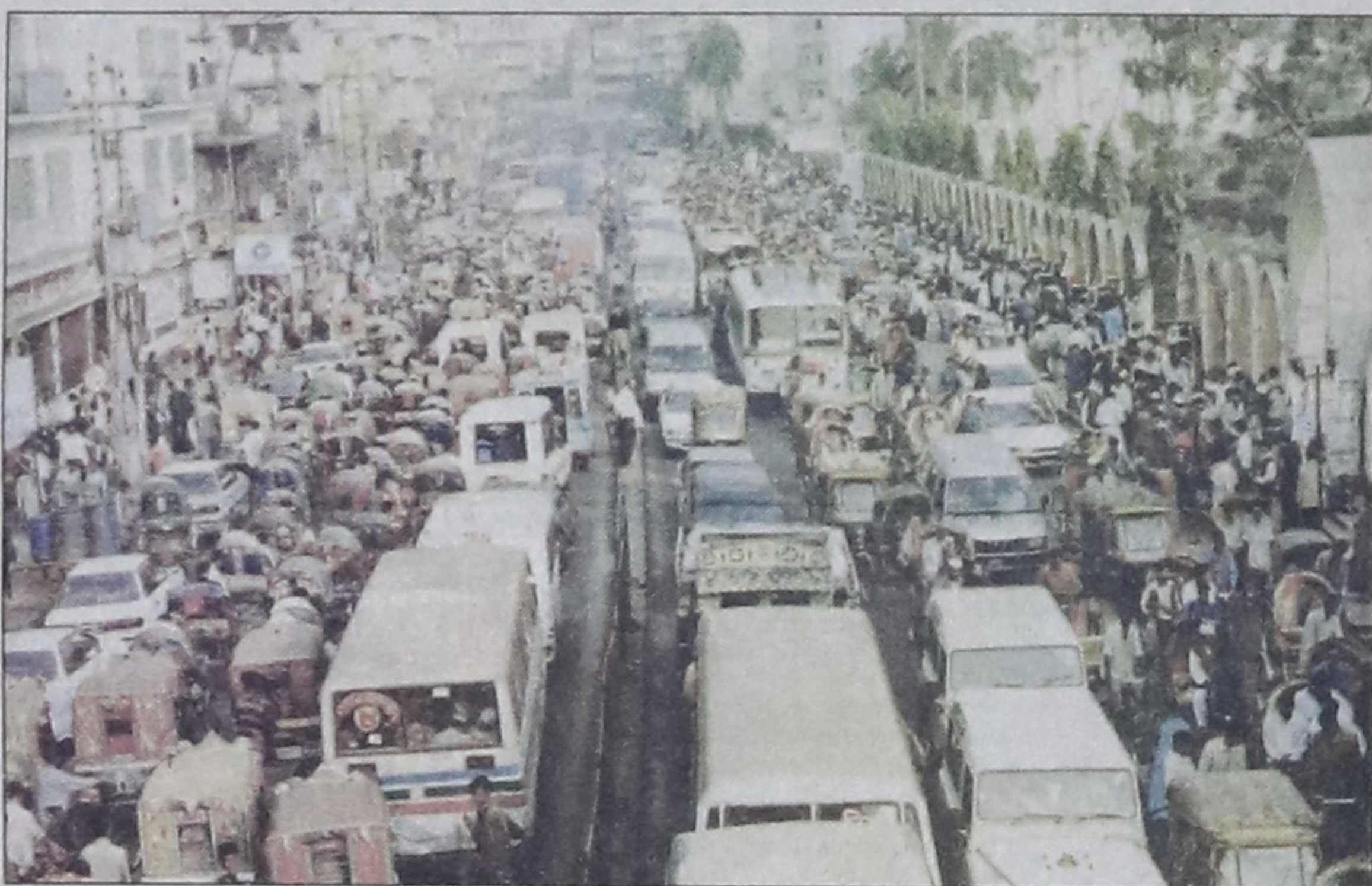
Eid is still two weeks away, but traffic jam in the city is getting worse. Photo shows a road in front of the north gate of Baitul Mukarram Mosque yesterday.