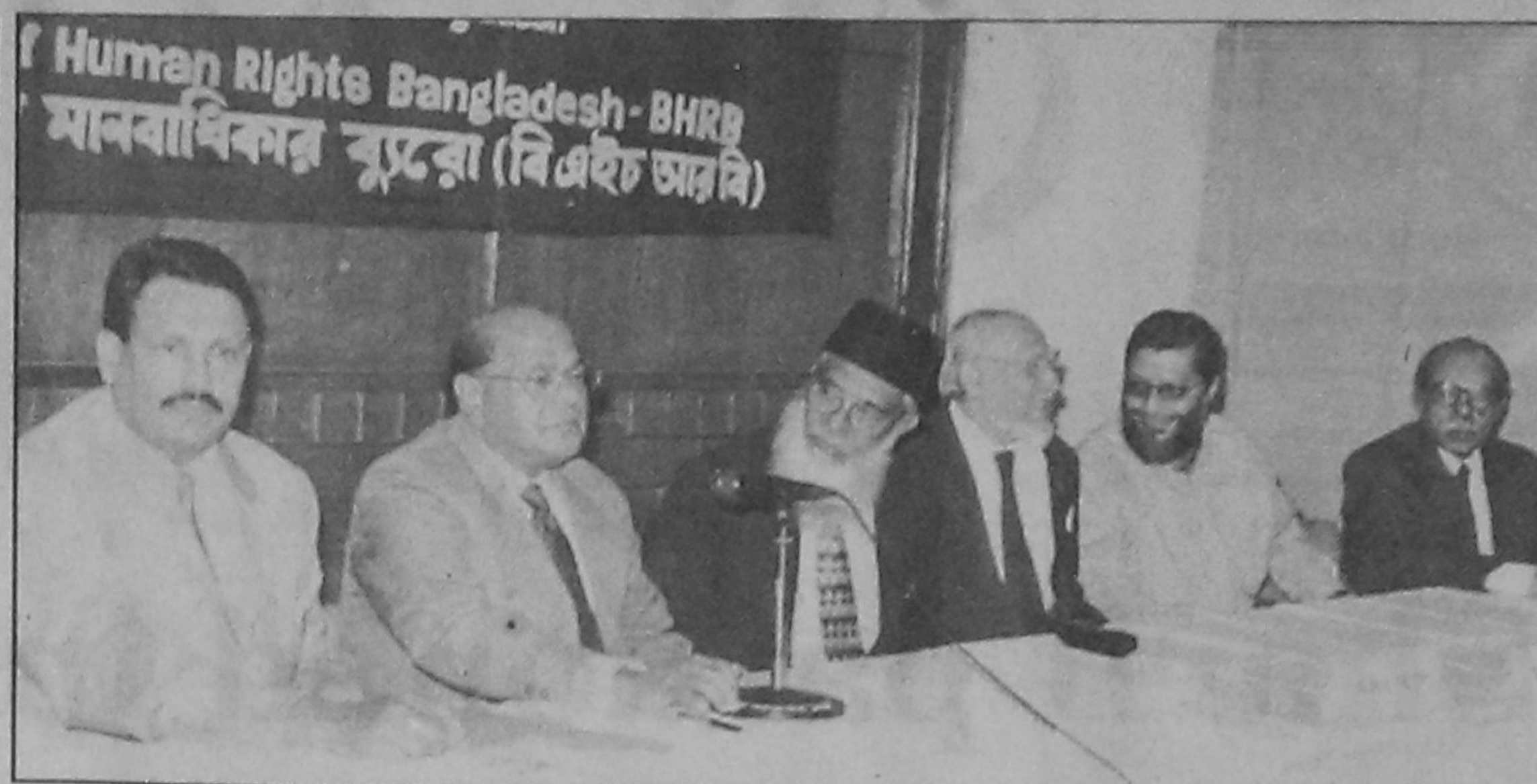
Chief Justice Latifur Rahman speaking at a seminar on 'Global Human Rights and Bangladesh Context' at the VIP Lounge of the National Press Club yesterday.

Mian leaves behind wife, a son and three daughters.