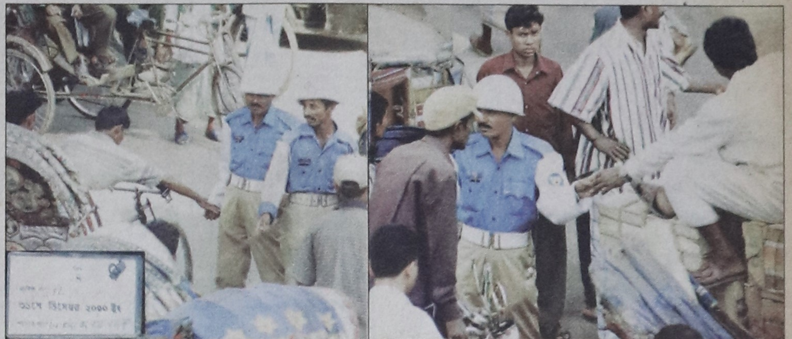
Making law a commodity... A traffic policeman (extreme left) along with a baton-wielding colleague goes about his sneaky business of collecting tolls from a rickshawpuller at Kaptan Bazar-Nawabpur crossing in the old town yesterday. Later on, the same policeman (right) went on his own, charging Tk five per pushcart and getting it without much effort! A "token" (inset) issued by traffic sergeants at a monthly fee of Tk 500 gives one licence to drive through city thoroughfares, negating the need for a valid driving licence.

The airport was built on a 2.2 See page 11 col 6