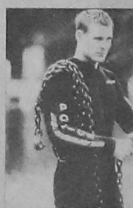
Water Rats on Star World tonight at 8

6:00 BBC News 6:30 World Business Report 7:00 BBC News 7:30 Asia Today/World Business Report 8:00 BBC News 8:30 Asia Today/World Business Report 9:00 BBC News 9:30 Asia Today/World Business Report 10:00 BBC News 10:30 Hardtalk 11:00 BBC News 11:30 Talking Movies 12:00