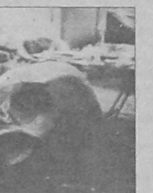
Adventure Bangladesh on Ekushey television today at 7 in the evening

(Episode 68) 7:40 Magazine Show: Flop Show 8:00 Din Protidin 8:50 Eye Focus 9:00 Drama Series: Gunai Bibi 10:10 Lipton Taza Monohar Itar 10:40 Addar Table 11:15 Protidin Muktiyuddha 11:50 Ekaturer