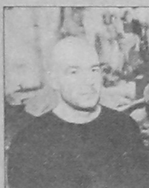
Tate Modern on BBC WORLD tonight at 9:10

BTV Morning session 9:00 Opening announcement 9:10 Nijer Jonnya: A programme on exercise and self-protection 9:35 Shomota: A programme on Women's rights 10:00 Shastha Thya: Heath