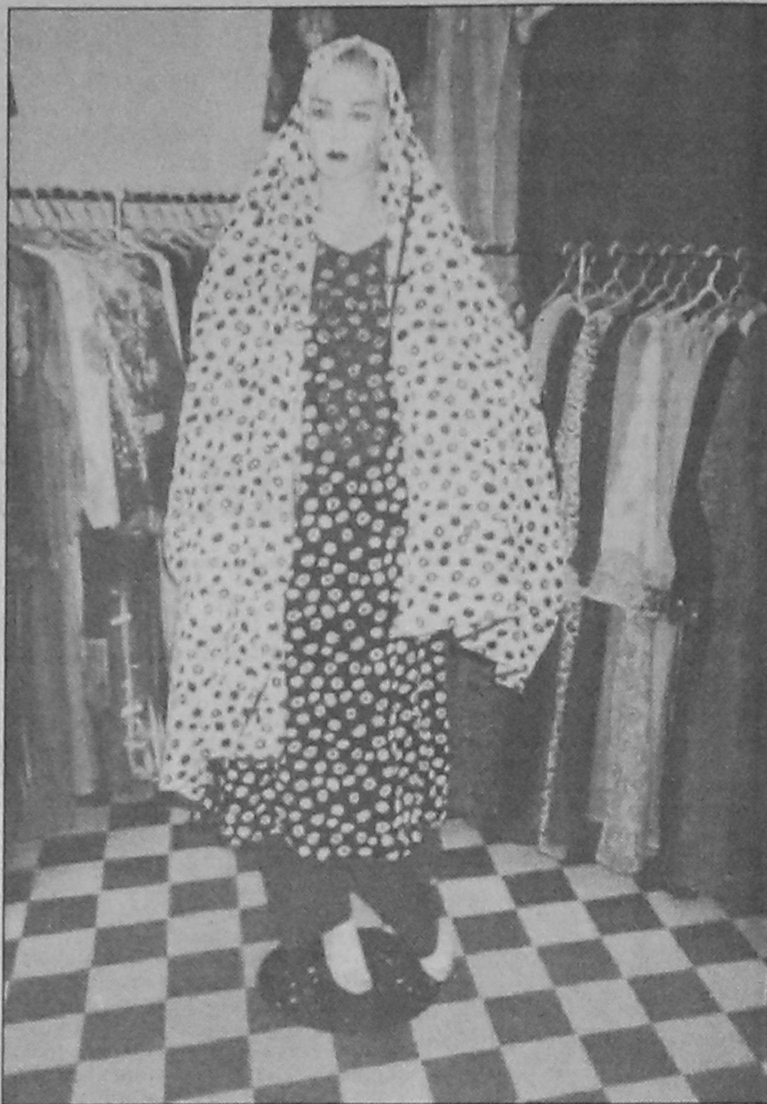
Spots in contrasts of red, white and black make this an interesting ensemble.

A two-day long dress exhibition by fashion house Batool's Creation ended on December 8 at Uttara's 'Chayanee'. Though the items on display included salwar-kameeze and sari collection, the cynoure of the exhibition were