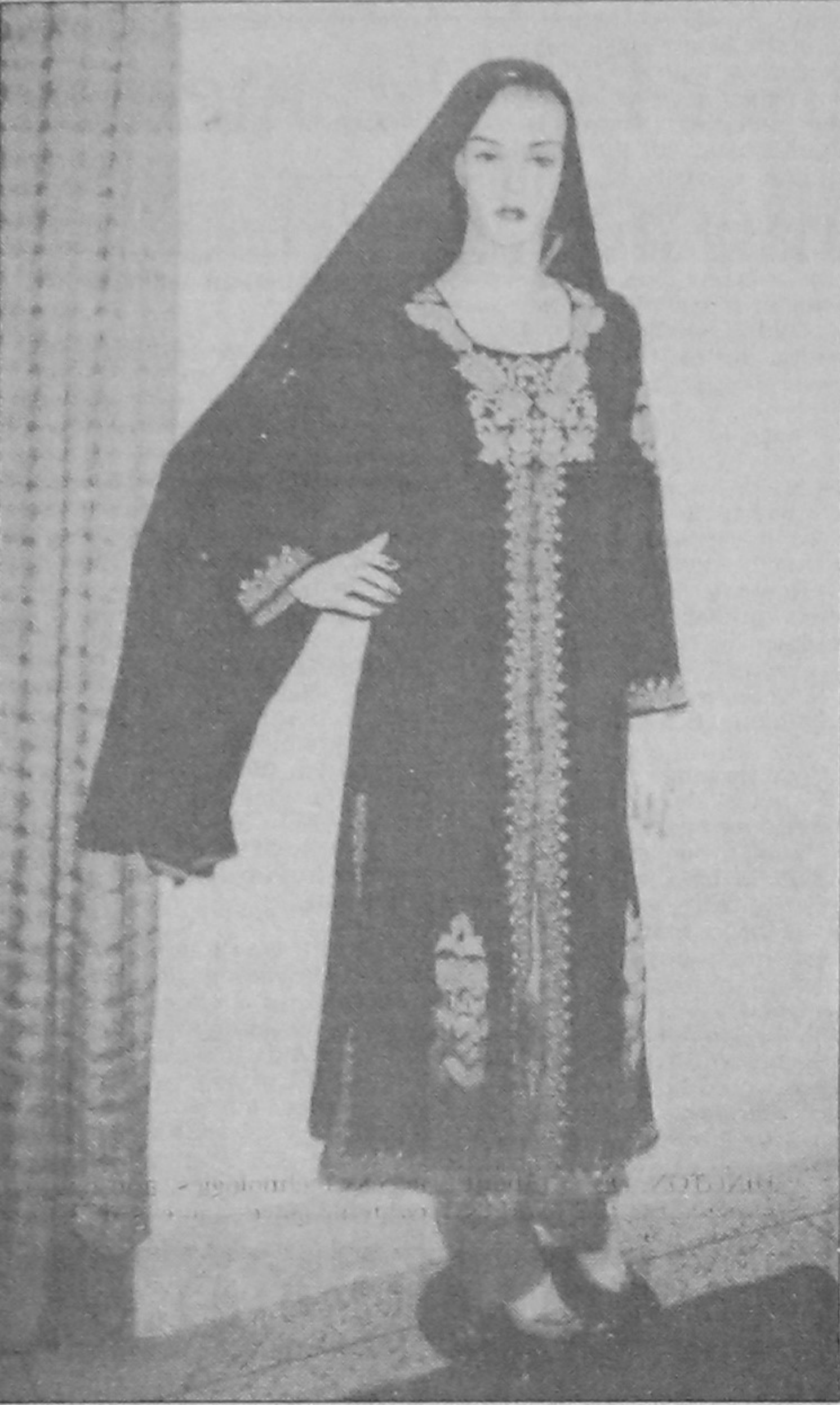
Red and bright... just right for a festival

Fashion houses such as Batool's Creation and many other boutiques are representing the changing pattern in our fashion expression. They should try up to their creative best to bring out the best fashion wear, which shall not only represent the modernised fashion world, but also will have the blend of our traditional culture in their works.