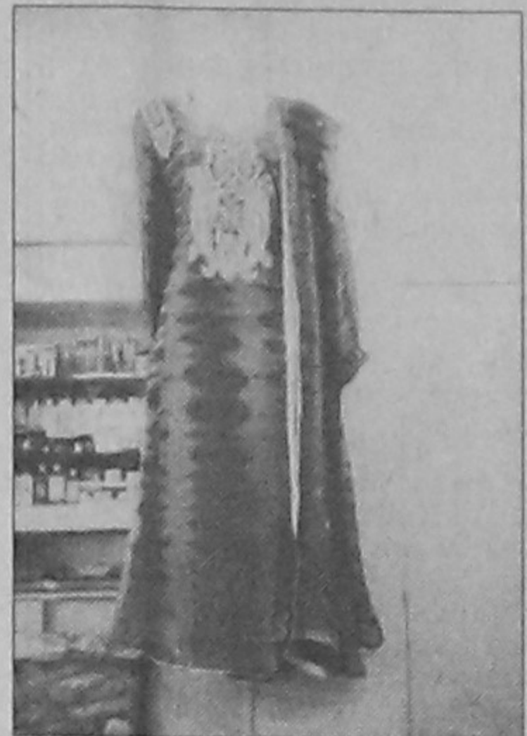
An embroidered dress on tie & dye work on orange

There were also works, which included spray print and hand prints. These dresses were quite