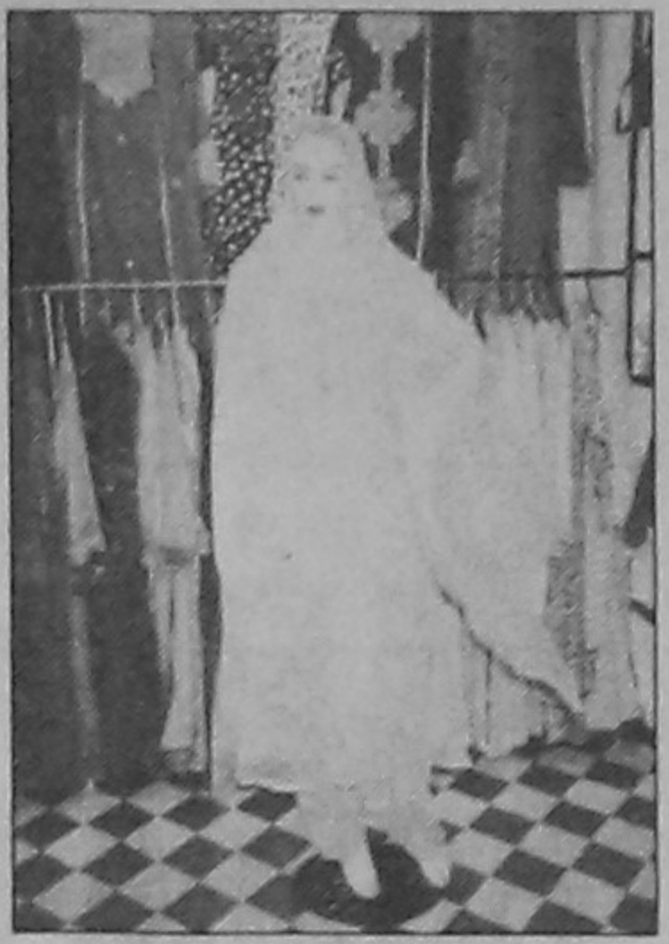
Hand embroidery on a yellow three-piece set

Though most of the dresses were made with different combi-