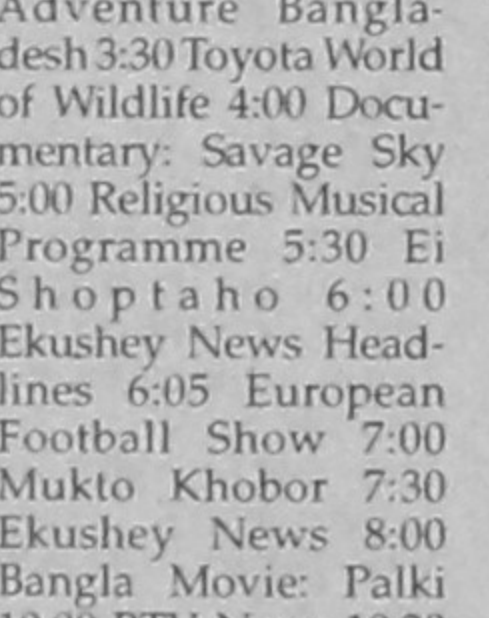
Major Khela Kobitae on Ekushey television today at 7 in the evening

2:00 Ekushey News Headlines 2:05 Ajker Potrikay 2:15 Shorashori 2:40 Adventure Bangladesh 3:30 Toyota World of Wildlife 4:00 Documentary: Savage Sky 5:00 Religious Musical Programme 5:30 Ei Shoptaho 6:00 Ekushey News Headlines 6:05 European Football Show 7:00 Mukto Khobor 7:30 Ekushey News 8:00 Bangla Movie: Palki 10:00 BTV News 10:20 Bangla Movie: Palki (cont'd.) 11:00 Ekushey