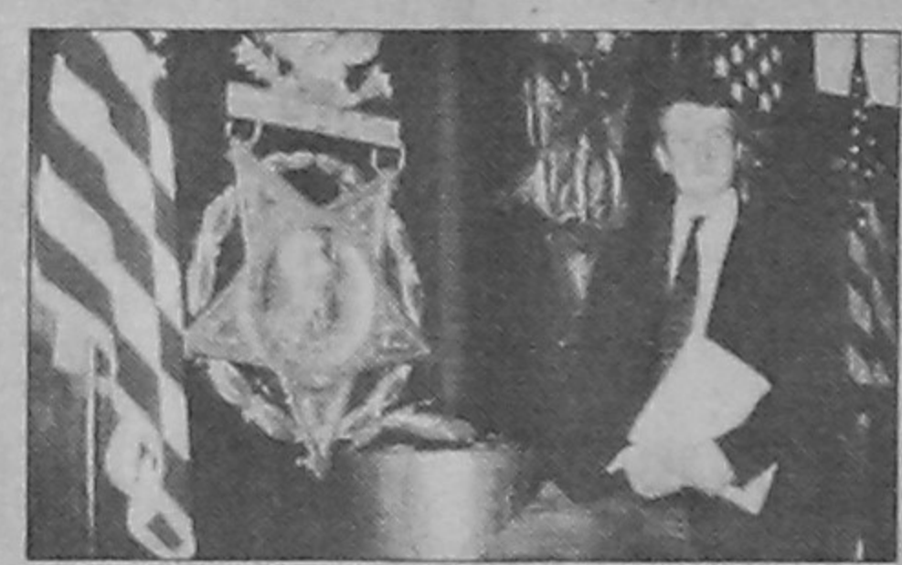
Moral Combat: Nato At War on BBC WORLD today at 6:10 in the evening

(50-52) Royal Coll Art (53) 3:00 Generous Rich (45) Bubble Trouble (46-48) Tate Mod (49-50) Shock (51) Royal (52) Global Sunrise (53) 4:00 BBC News 4:30 Holiday 5:00 BBC News 5:30 This Week 6:00 BBC News 6:45 Louis