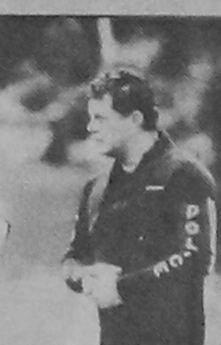
Earthquake in New York

6:30 World Beat World News Americas 7:00 The Artclub 8:00 Larry King Live 9:00 World News 9:30 World Sport 10:00 World News 11:00 World News 11:30 Science and Technology Week 12:00 World News 12:30 CNN Hotspots 1:00 World News 1:30 World Sport 2:00 World News 2:30 Style with Elsa Klensch 3:00 Larry King Live (replay) 4:00 World News 4:30 CNNdotCOM 5:00 World News 5:30 World Sport 6:00 World News 6:30 Biz Asia 7:00 World News 7:30 World Beat 8:00 World News 8:30 The Artclub 9:00 World News 9:30 Style South Asia 10:00 World News 10:30 CNNdotCOM 11:00 Business Unusual 11:30 CNN Indiaatdotcom 12:00 World News 12:30 Ebizasia 1:00 World News 1:30 CNN Hotspots 2:00 World News 2:30 World Beat