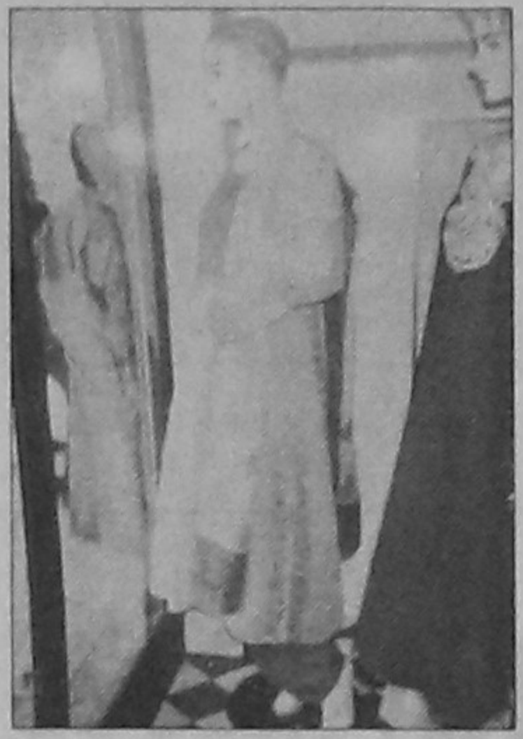
Block print in green and brown on a yellow cotton dress