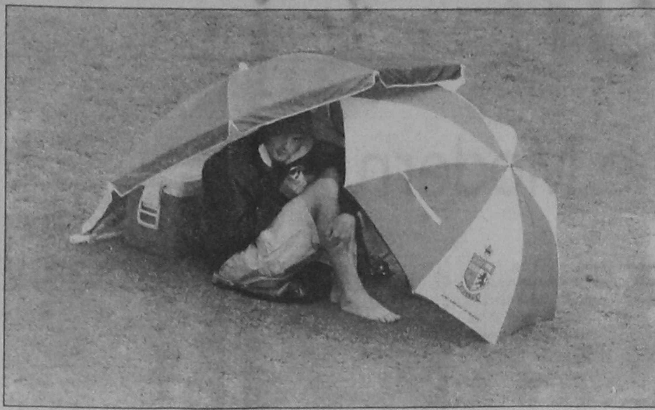
A spectator at the Wanderers Stadium in Johannesburg, sitting under umbrellas, waiting for rain to stop yesterday.