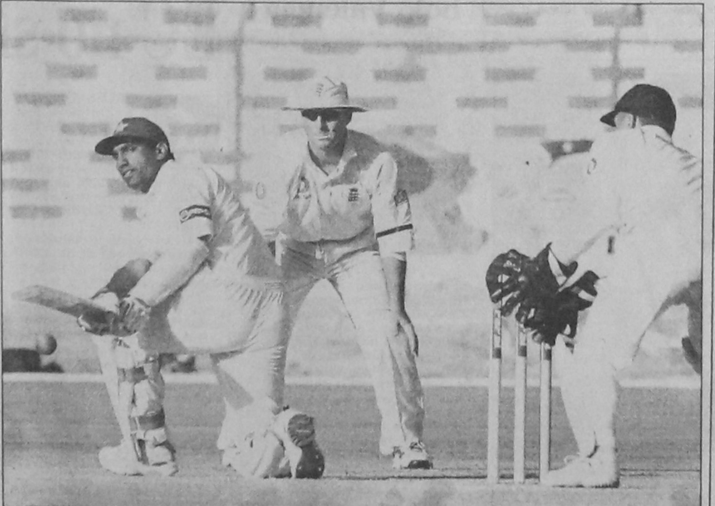
Pakistan's Yousuf Youhana, who finished the first day on 104, sweeps one on way to his fifth Test hundred at Karachi yesterday.

Home and Telecommunications Minister will attend as chief guest.