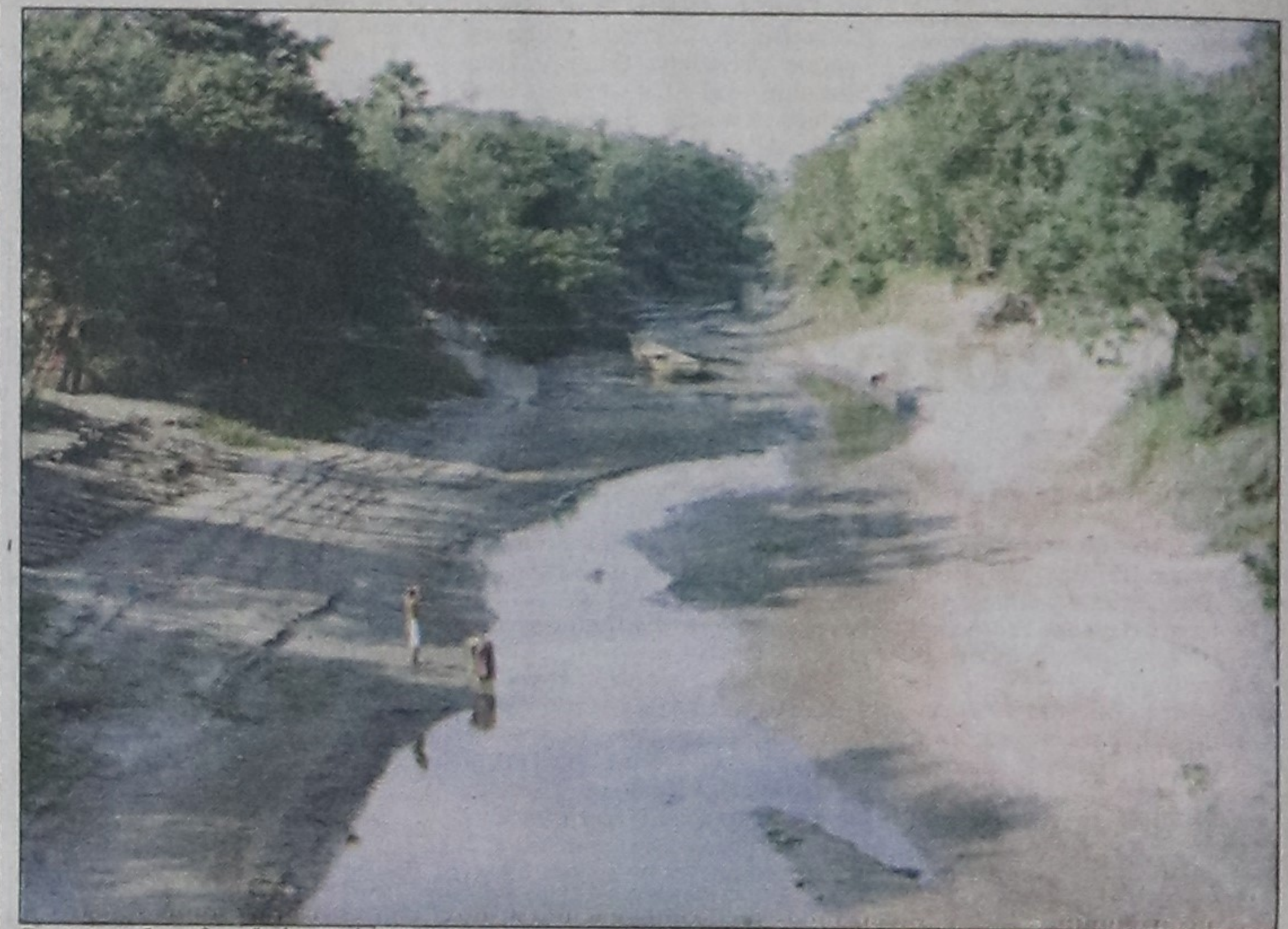
Sorry tale of a dying river A rural woman collects water from what was once the spontaneous river Ichhamati. Siltation has turned the river into a narrow stream.

Like Ichhamati, hundreds of historic rivers and canals in the country simply face extinction. One day these waterways may only exist in the memory of elderly people who lived along them and have tales to tell our future generations.