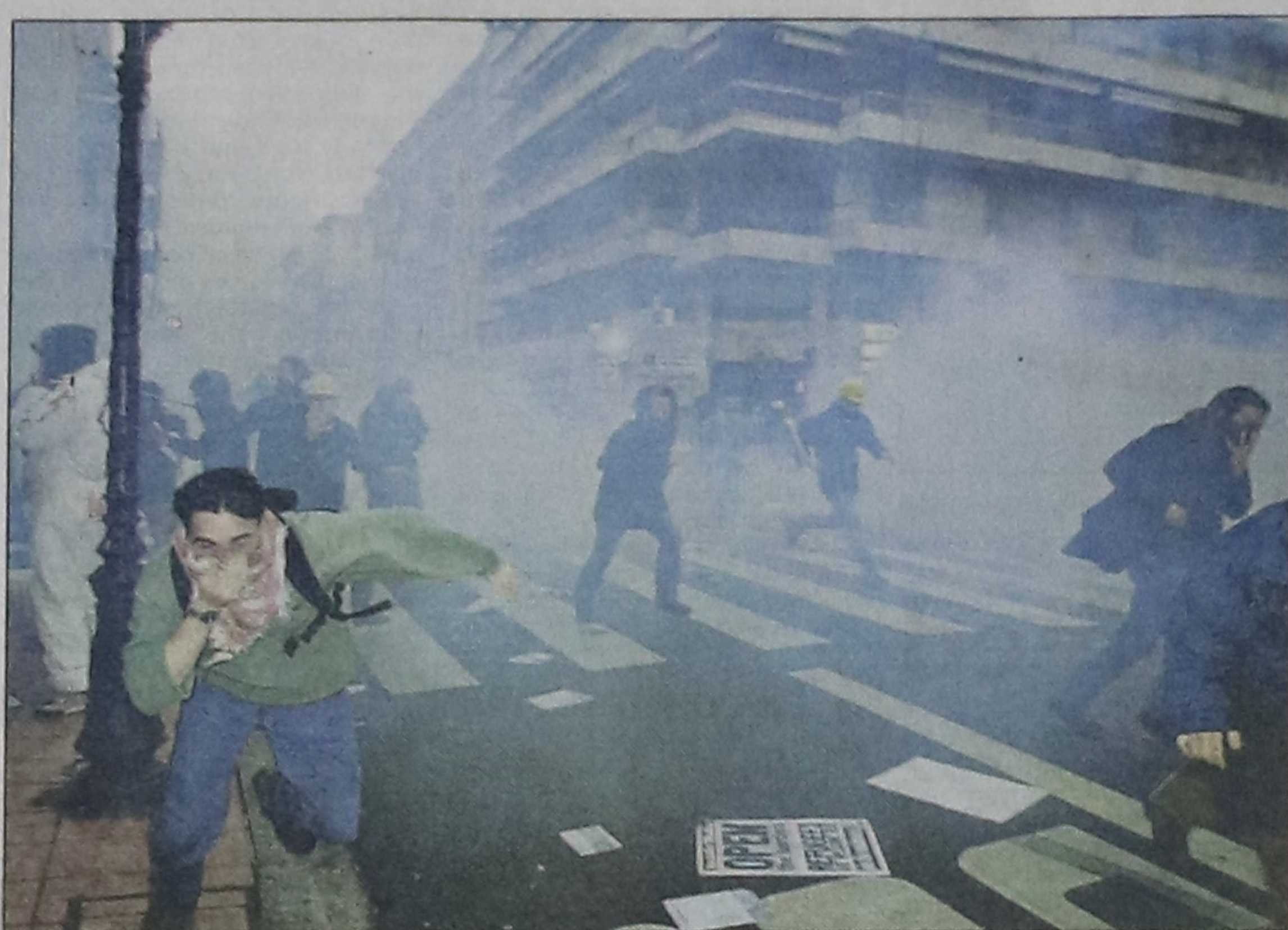
Protesters run away from tear gas fired by riot police on the streets of Nice yesterday. Twenty policemen were injured in violent protests near the Nice conference centre where European leaders were assembling as anti-globalisation campaigners and Basque nationalists confronted police in a series of street-battles.

Despite issuance of final notices, the encroachers and owners of the factories are See page 11 col 8