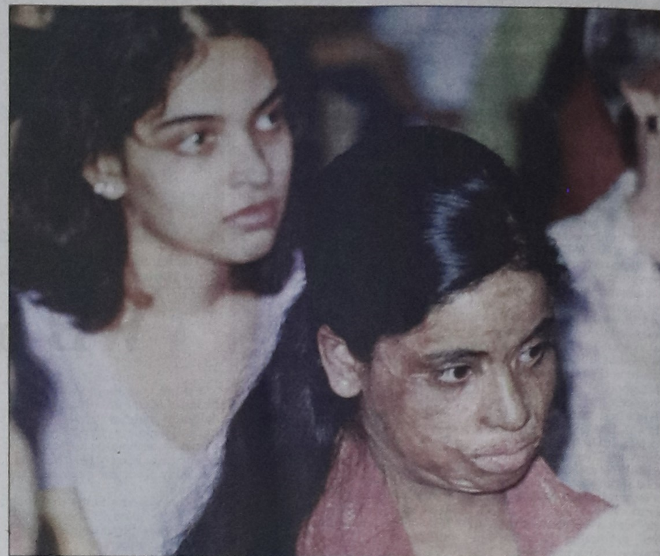
Stand by the acid victims... Henry's Heritage coincided its emergence as a private limited company with inauguration of a special show dedicated to the acid burn victims yesterday. The boutique announced that it would spend one per cent of its profits for rehabilitation of the acid victims, some of whom attended the ceremony at its Dhanmondi showroom.

An independent 11-member jury panel comprising leading intellectuals, business persons, academicians, lawyers, financial experts and eminent personalities with high social standing, credibility and prestige, including the CEOs of the two sponsoring organisations, shall select the winners from the nominations received.