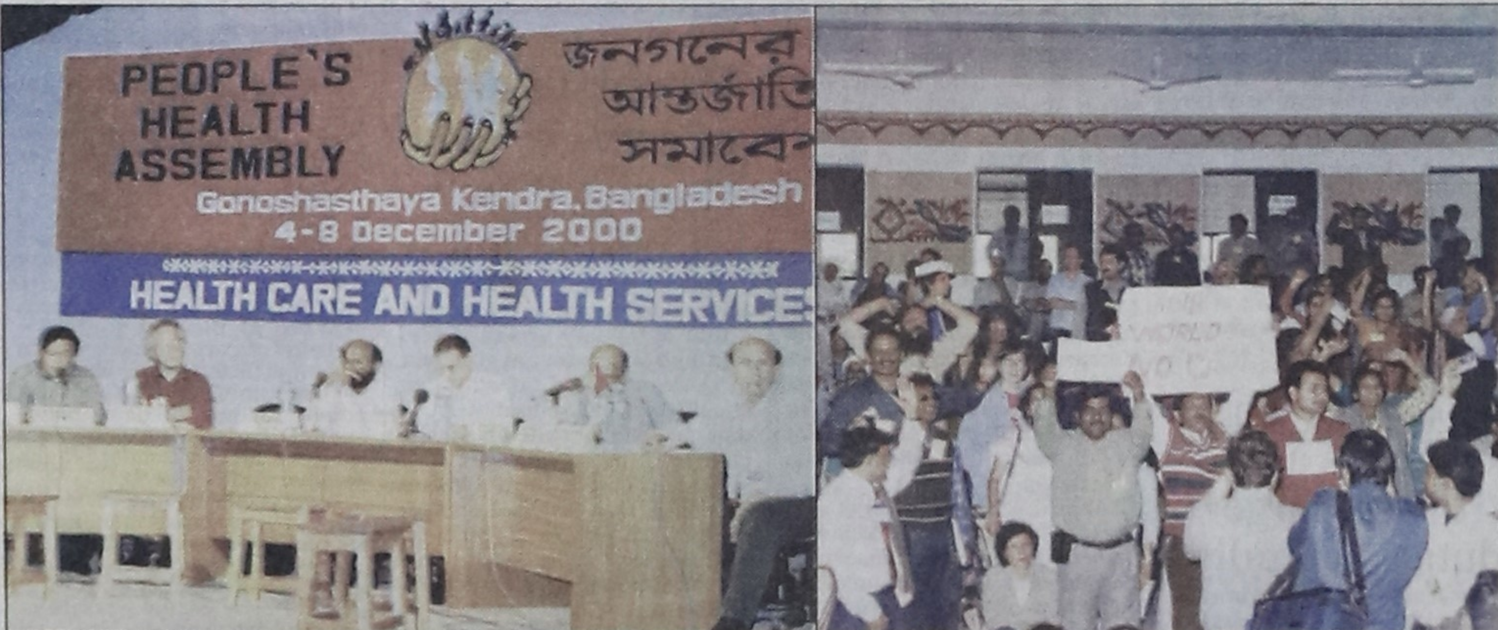
The placard held aloft in the audience (right) sums up the sentiment echoed on the third day of the People's Health Assembly at the Gonoshastya Kendra auditorium in Savar yesterday. Some 3,000 health activists raised a storm over the World Bank's policies which, they say, devastate economies and favour multinational pharmaceuticals.