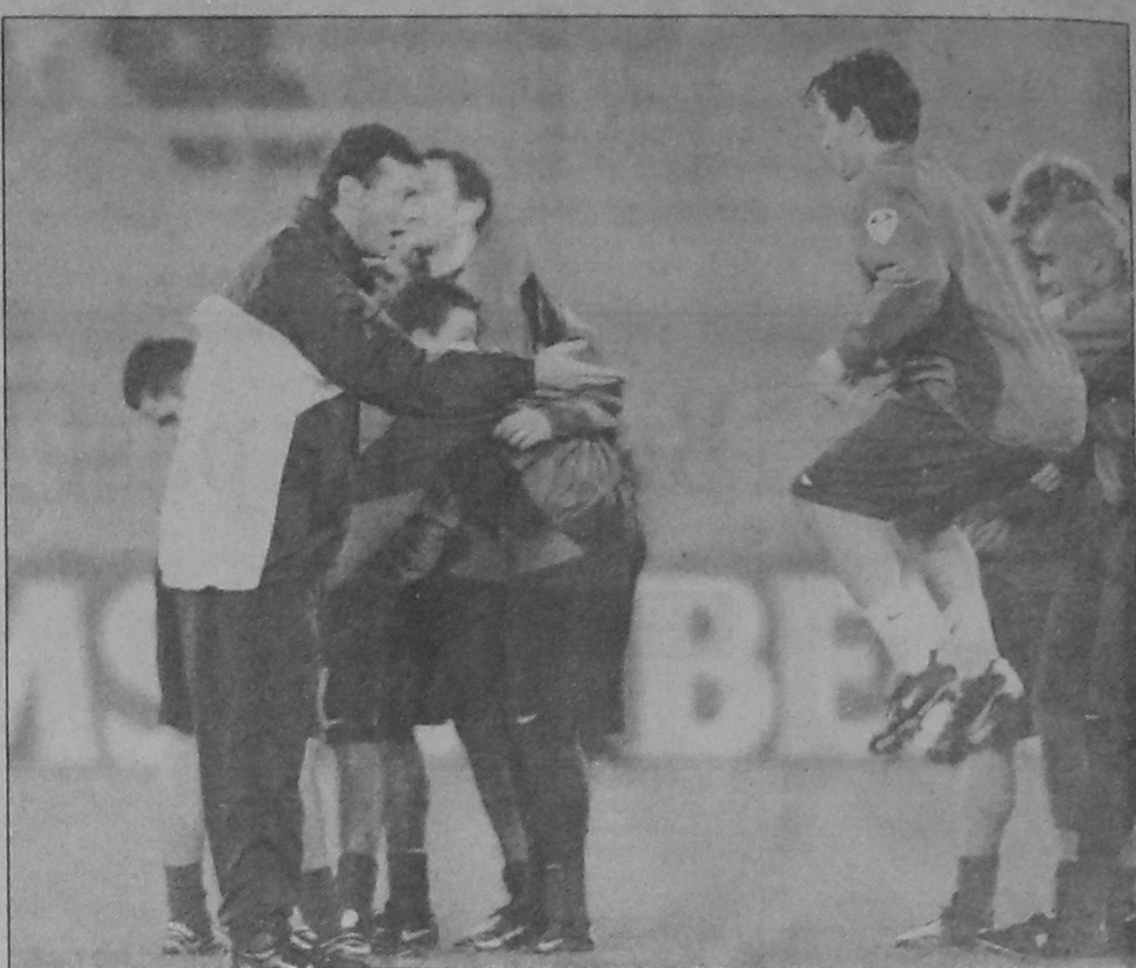
David O'Leary (L), the Leeds United manager, urging midfielder Jacob Burns during a practice session on December 4 at Rome ahead of their Champions League clash against Lazio.