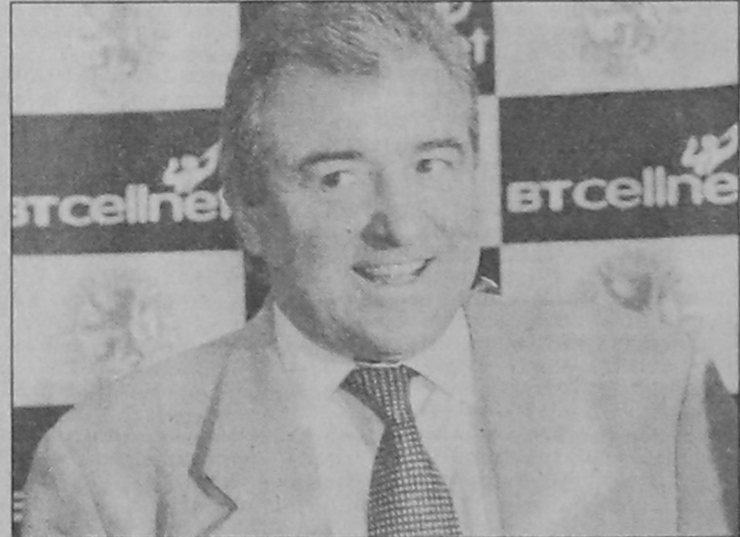
Newly appointed Middlesbrough coach Terry Venables speaking during a media conference at the club's Roekcliffe Park training ground on December 4.

time games. This Saturday they face Sunderland in a north-east derby, a game that Venables, the fans' favourite to retake the England job when Kevin Keegan quit, knows will be difficult. "It's obviously a tough one - Bryan is more experienced in that game than I am." "I actually won't start until Friday because I have commitments but once that's out of the way I should be able to fix everything up." "There's only one component needed and that is hard work - everybody's got to do it or we won't make it."