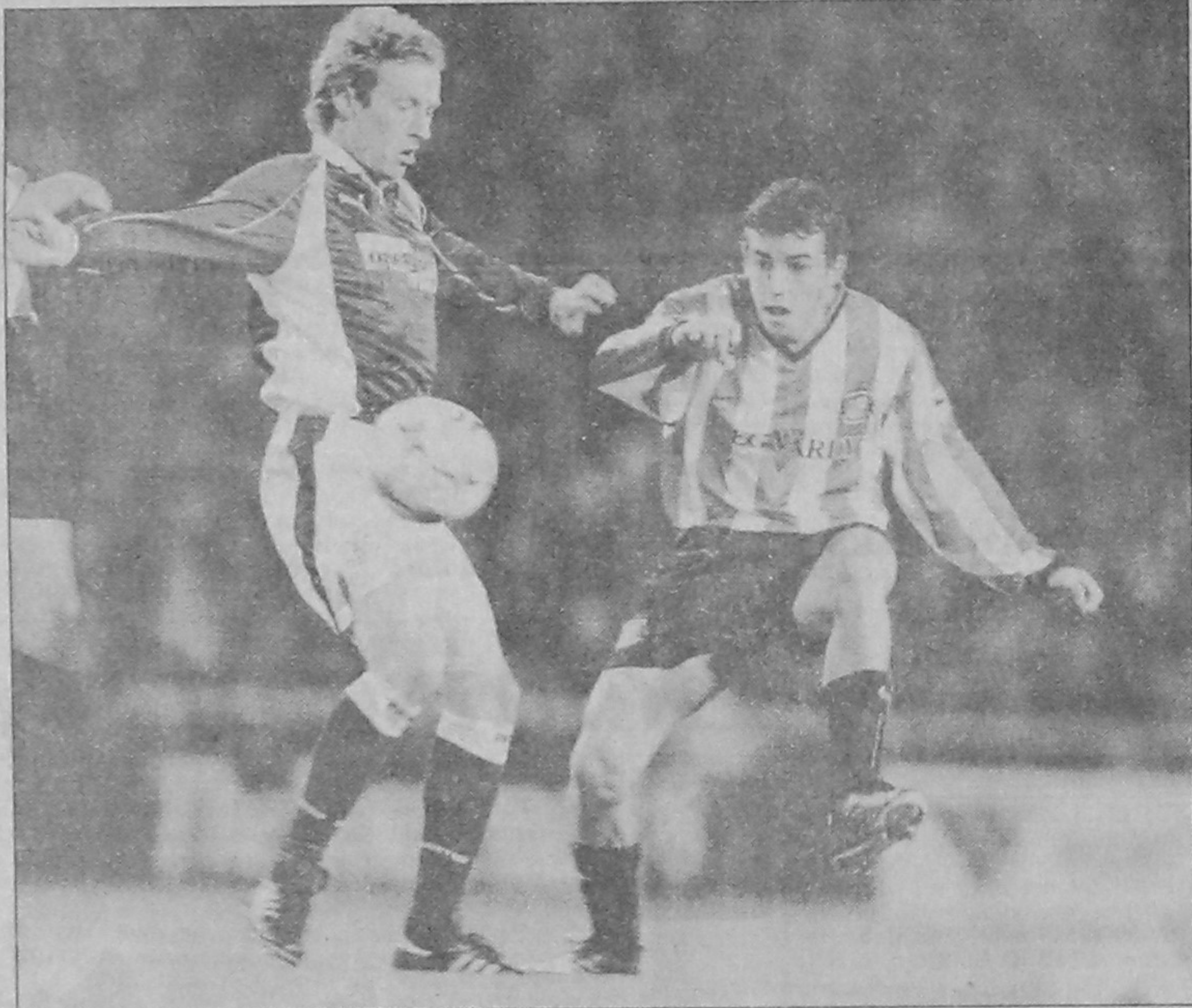
Gavin McCann (R) of Sunderland releases the ball under pressure from Scott Gemmill of Everton during their Premiership fixture at Sunderland's Stadium of Light on December 4.

home from 18 yards. It took a good save from Gerard to stop Phillips doubling before the whistle came, and he was just grateful to see Quinn sky a right-foot shot high over within 45 seconds of the restart. Everton, who had earlier had Stephen Hughes and Kevin Campbell booked for fouls as they tried to cling on to Sunderland's coat-tails, were fortunate to remain just one down on 63 minutes after Quinn again controlled beautifully on his chest and sid the ball in for Phillips.