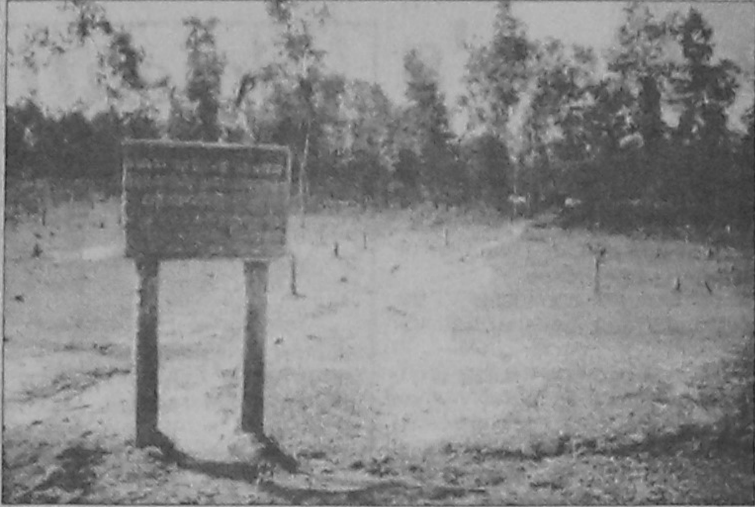
Timber thieves allegedly pay Taka 50 for each rickshaw van, Taka 200 for each pushcart and Taka 1,000 to Taka 1,200 for each truck. The timber goes to different furniture shops in the district and other places including the capital city. Some 150 sawmills in the region are doing brisk business. Most of the illegal logs are cut to size in the sawmills.

It is learnt that some 500 godfathers are active in Aungagara, Habirbari and Uthura ranges in Bhaluka upazila, Santoshpur range in Phulbaria upazila and Rasulpur range in Muktagachha upazila. Sources said a section of policemen issue 'pass' in exchange for bribe when timber is transported.