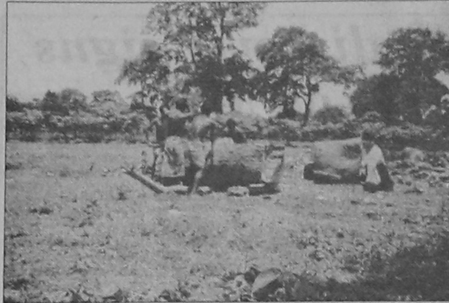
Many valuable trees like this one in picture (left) are being cut indiscriminately at Rasulpur Forest Range under Muktagachha upazila in Mymensingh by the miscreants without any resistance from the forest guards or the members of law enforcing agencies. As a result many areas of the forest (right) have already been turned into grazing lands. Immediate steps should be taken by the authorities concerned to protect further denudation of the forest.