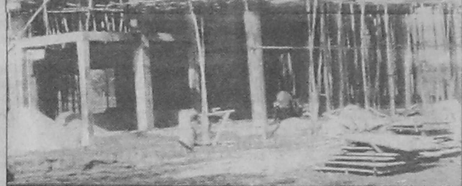
The underconstruction Jhenidah Central Bus Terminal at village Gobindapur on Jhenidah-Magura highway. Its sixty per cent works have already been done.

Police, however, recovered all the seven arms looted from Baruli police outpost, one in Bagerhat launch dacoity and 11 arms in Duttapara arms loot incident.