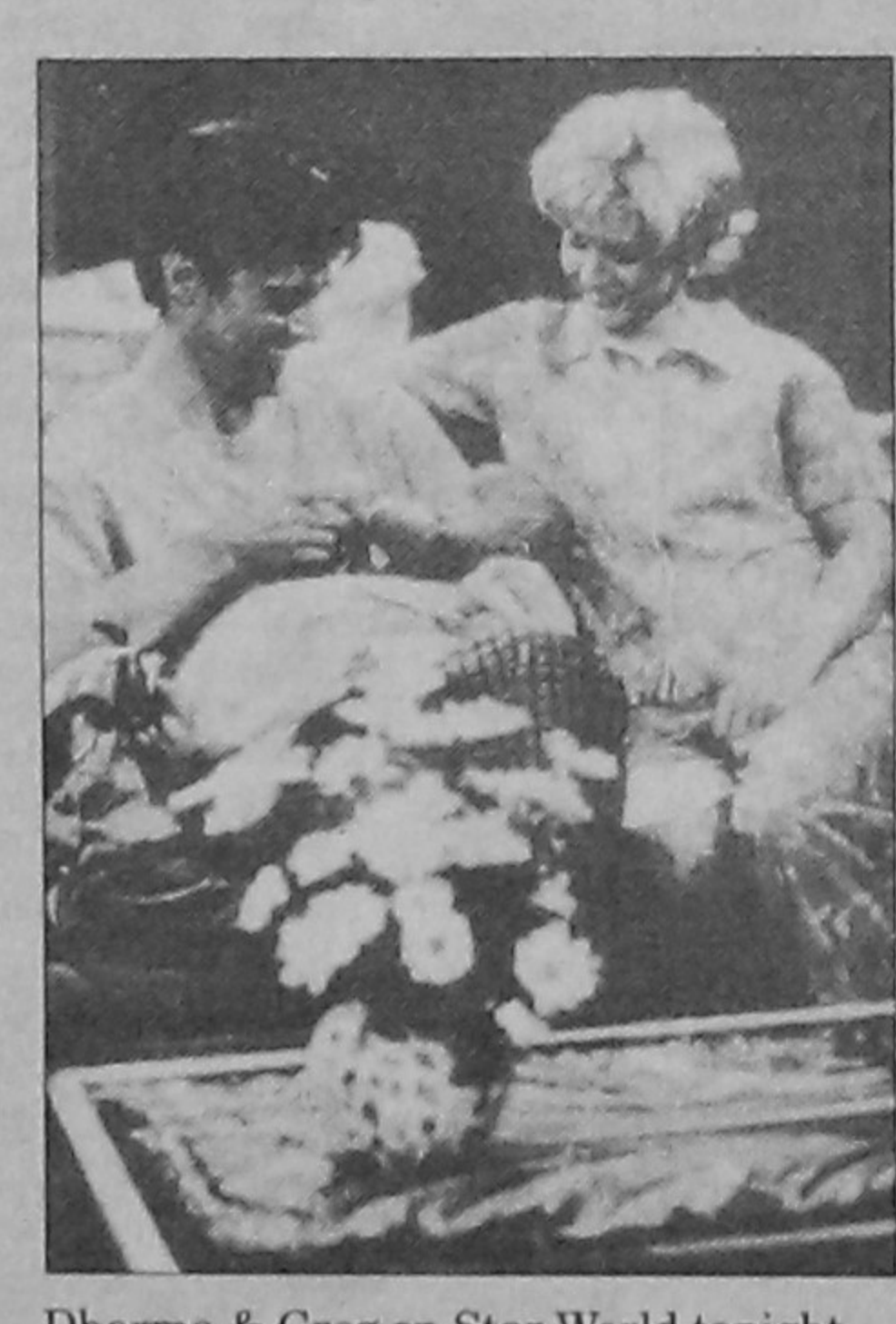
Dharma & Greg on Star World tonight at 10:30

ness Report 8:00 BBC News 8:30 Asia Today/Reporters 9:00 BBC News 9:30 Asia Today/Asia Business Report 9:30 Asia Today 10:00 BBC News 10:30 Earth Report Ex World Review 11:00 BBC News 11:30 Jancis Robinson's Wine Course 12:00 BBC News 12:30 India Business Report 1:00 BBC News 1:30 Hardtalk 2:00 BBC News 2:30 Correspondent Ex World Review 3:00 BBC News 3:30 Hardtalk 4:00 BBC News 4:30 Top Gear 5:00 BBC News 5:30 Correspondent Ex World Review 6:00 BBC News 6:30 Face To Face 7:00 BBC News 7:15 World Business Report 7:30 Jancis Robinson's Wine Course 8:00 BBC News 8:30 Hardtalk 9:00 BBC News 9:30 Asia Today 10:00 BBC News 10:30 Mastermind India 11:00 BBC News 11:15 World Business Report 11:30 Click Online 12:00 BBC News 12:30 World Business Report