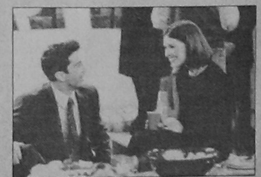
Friends on Star World tonight at 9

Oprah Winfrey Show 12:00 Dr Quin Medicine Woman 1:00 Fashion TV 1:30 The Bold & the Beautiful 2:00 Mork & Mindy 2:30 Happy Days 3:00 Baywatch 4:00 Hollywood Squares 4:30 Home Improvement 5:00 Star News Asia 5:30 Friends 6:00 That 70's Show 6:30 Everybody Loves Raymond 6:55 Star News Asia 7:00 Dharma & Greg 7:30 Frasier 8:00 Chicago Hope 9:00 Friends 9:30 Star News