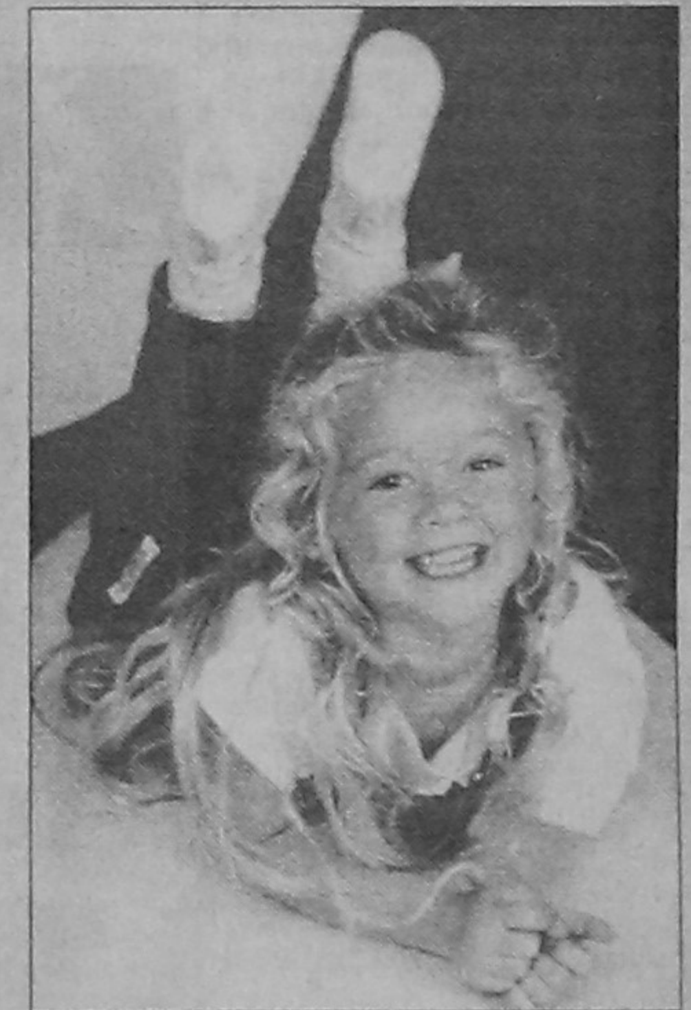
Everybody Loves Raymond on Star World tonight at 11

6:00 Hollywood Squares 6:30 The New WKRP in Cincinnati 7:00 The Oprah Winfrey Show 8:00 Home Improvement 8:30 Happy Days 9:00 French and Saunders 9:30 Blackadder 10:00 Murder Call 11:00 the