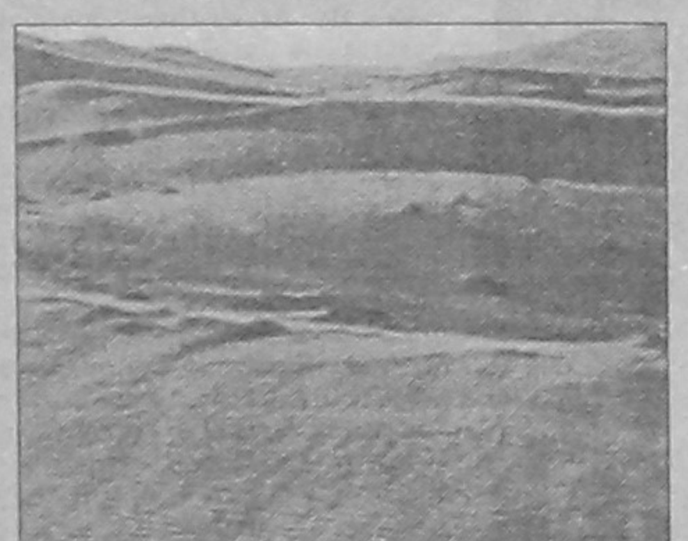
Toyota World of Wild Life, topic: Desert on Ekushey television today at 7 in the evening

commemorating poet Abdul Hai 5:45 Nutrition Facts 6:00 Khabar 6:10 Mahi O Manush 6:30 Umesh: A programme with new and upcoming artists 7:00 Dolon Campa: Nazrul Sangeet programme 7:25 Batikram: Magazine programme for the children 8:00 News in Bengali 8:20 Special programme on Victory Day 8:30 Drama: 2:30 Aker Potrikay 2:40 Drishti 3:00 Ekushey News Headlines 3:05 Andha Shikari 3:30 Pather Paychali 4:00 Pryo Gaan 4:30 Expedition to the Animal Kingdom 5:00 Religious Musical Program 5:30 Drishti 5:50 Aker Potrikay 6:00 Ekushey News Headlines 6:05 Classic Cartoons 6:30 Chardike 7:00 Toyota World of Wildlife 7:30