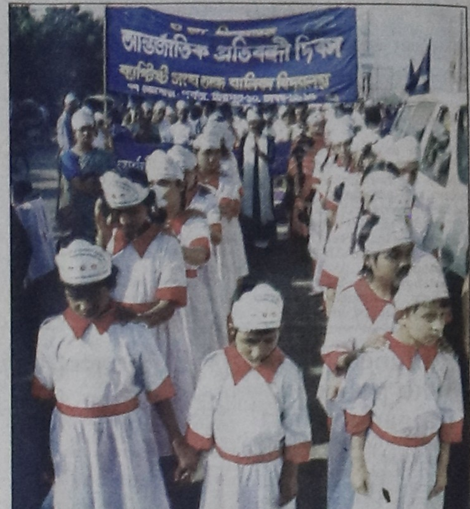
The Ministry of Social Welfare and the National Forum for the Disabled organised a rally in the city yesterday to mark the International Day of Disabled Persons. Students of different specialised institutions for the disabled took part in the rally.

The party leaders were of the opinion to cancel primary membership for his alleged involvement in criminal activities.