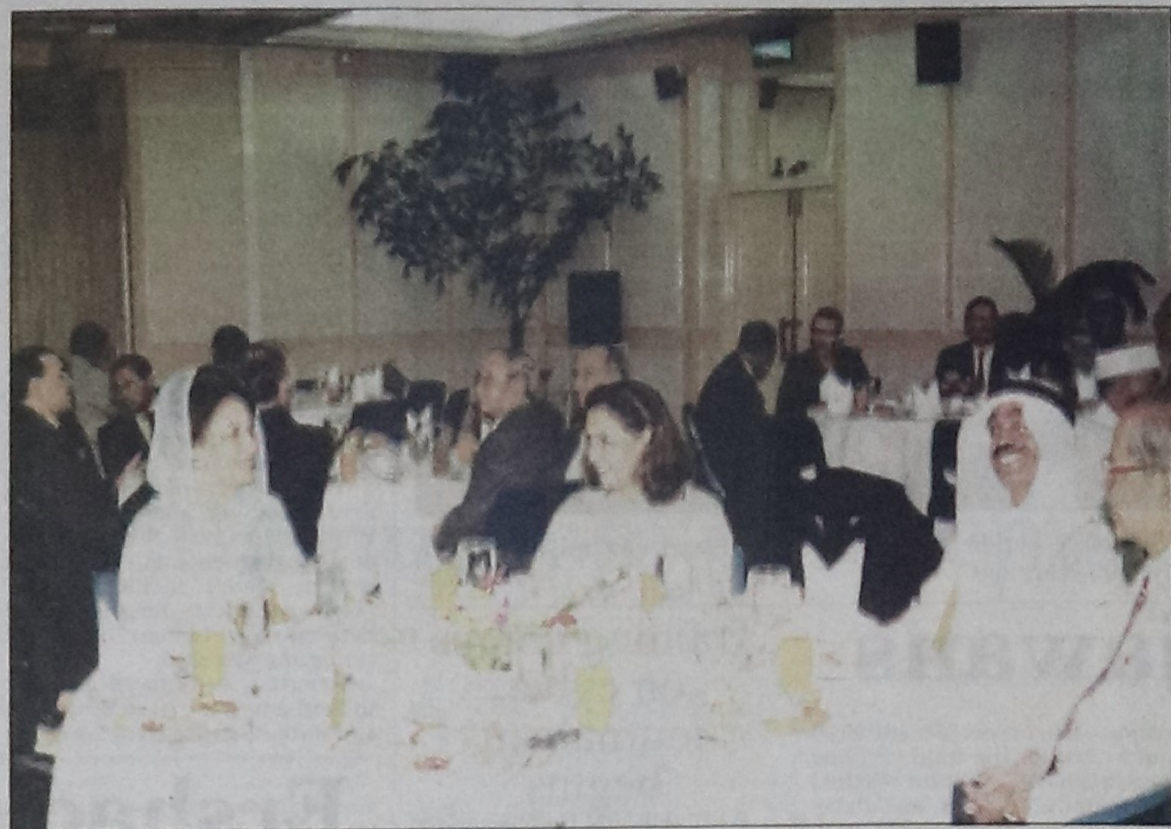
Leader of the Opposition in the Parliament Khaleda Zia hosted an iftar party for foreign diplomats posted in the country at her 29 Minto Road residence yesterday. -- Star photo

Ambassador of the State of See page 11 col 1