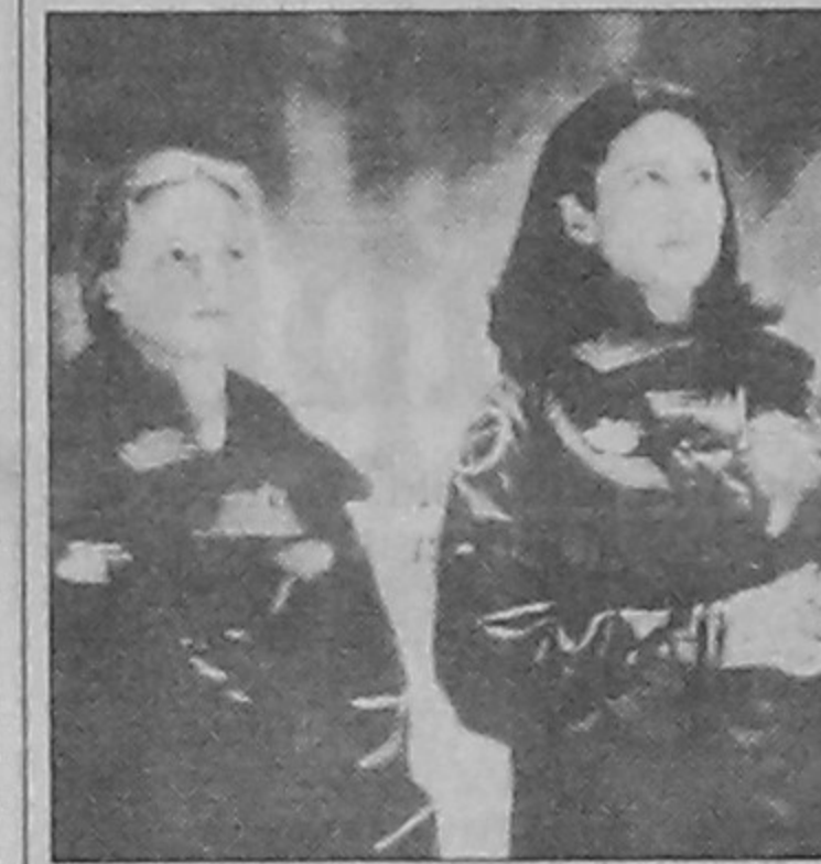
Lost in Space (December 4 at 10.00p.m.)

The New York-New Jersey underworld is a world where emotional ties are strong loyalties are flexible at times and tempers are short. One of the ruling clans is the Corleones headed by Don Vito (Brando). Al Pacino is the Don's youngest son, Michael, who though previously uninterested in the family business, reluctantly takes over when his father is critically wounded in an assassination attempt by a rival gang. It also stars Robert Duvall as the Corleone's attorney and Diane Keaton as Michael's sweetheart.