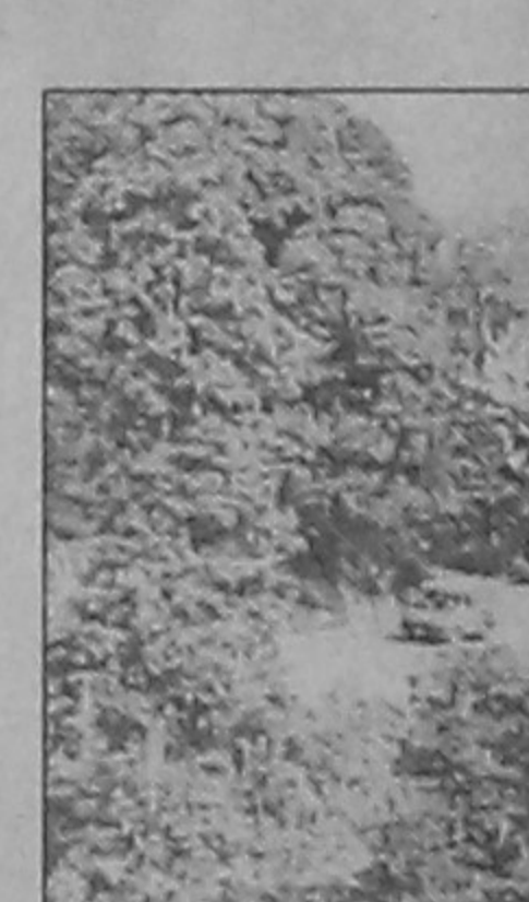
Special documentary on Chittagong hill tracks, today on Ekushey television at 3:00p.m.

6:00 BBC News 6:30 World Business Report 7:00 BBC News 7:30 Asia Today World Business Report 8:00 BBC News 8:30 Asia Today World Business Report 9:00 BBC News 9:30 Asia Today World Business Report 10:00 BBC News 10:30 Hardtalk 11:00 BBC News 11:30 Talking Movies 12:00 BBC