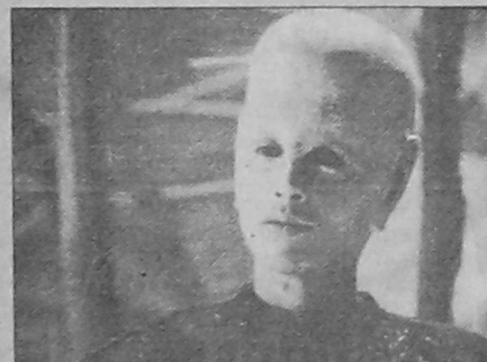
Earth Final Conflict on BTV today at 7:25p.m.

Morning session 9:00 Opening announcement 9:10 Children sports programme 9:35 Angana: Programme for woman 10:00 Programme on mother