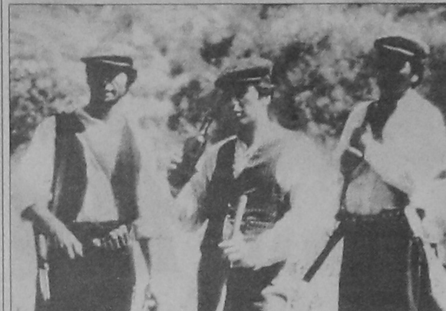
The Godfather (December 3 at 10.00p.m.)

Based on Mario Puzo's best-selling novel, The Godfather has been hailed as 'the 1970s answer to Gone With the Wind - a film of epic proportions, masterfully done.' (Leonard Maltin) Nimicked , parodied and revered, Francis Ford Coppola's 1972 sprawling masterpiece picked up three Oscars: Best Picture, Best Actor (for Brando) and Best Adapted Screenplay.