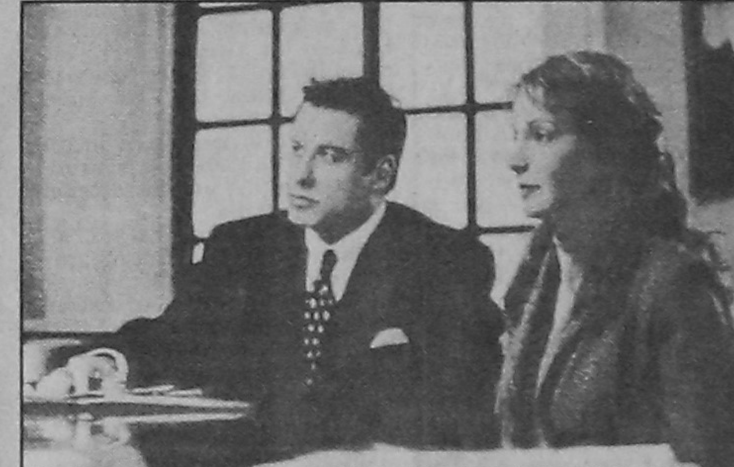
A Civil Action tonight on HBO at 10

Theroux's Weekends (45) Inside Dot Coms (46-49) Moral Combat (50-52) Global Sunrise (53) 3:00 BBC News 3:30 Talking Movies 4:00 BBC News 4:45 The Entertainment Biz (45-47) Pull Of The City (48-50) Nobel Minds (51) TBA (52) Royal Collart (53) 8:00 BBC News 8:30 Click Online 9:00 BBC News 9:45 Generous Rich (45) Bubble Trouble (46-48) Tate Mod (49-50) Shock (51) Royal (52) Global Sunrise (53) 10:00 BBC News 10:30 Mastermind India 11:00 BBC News 11:30 Talking Movies 12:00 BBC News 12:30 This Week 1:00 BBC News 1:30 Earth Report ex World Review 2:00 BBC News/Louis