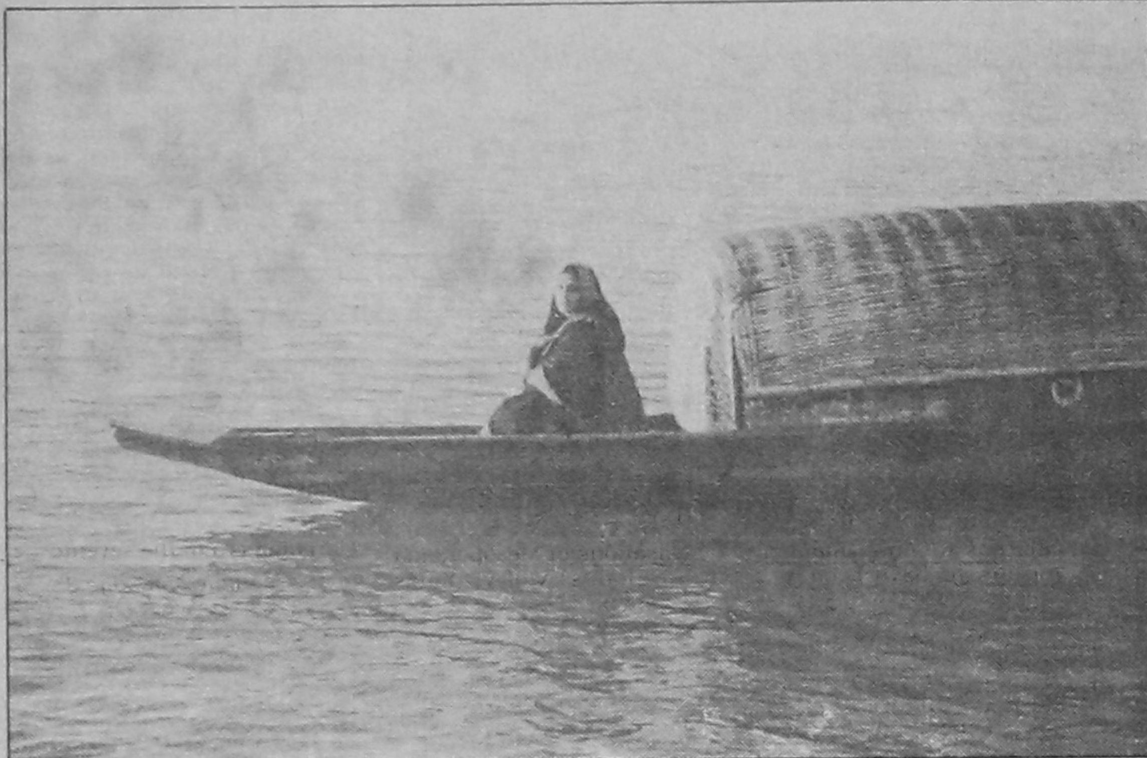
Naiori on the way to her father's house