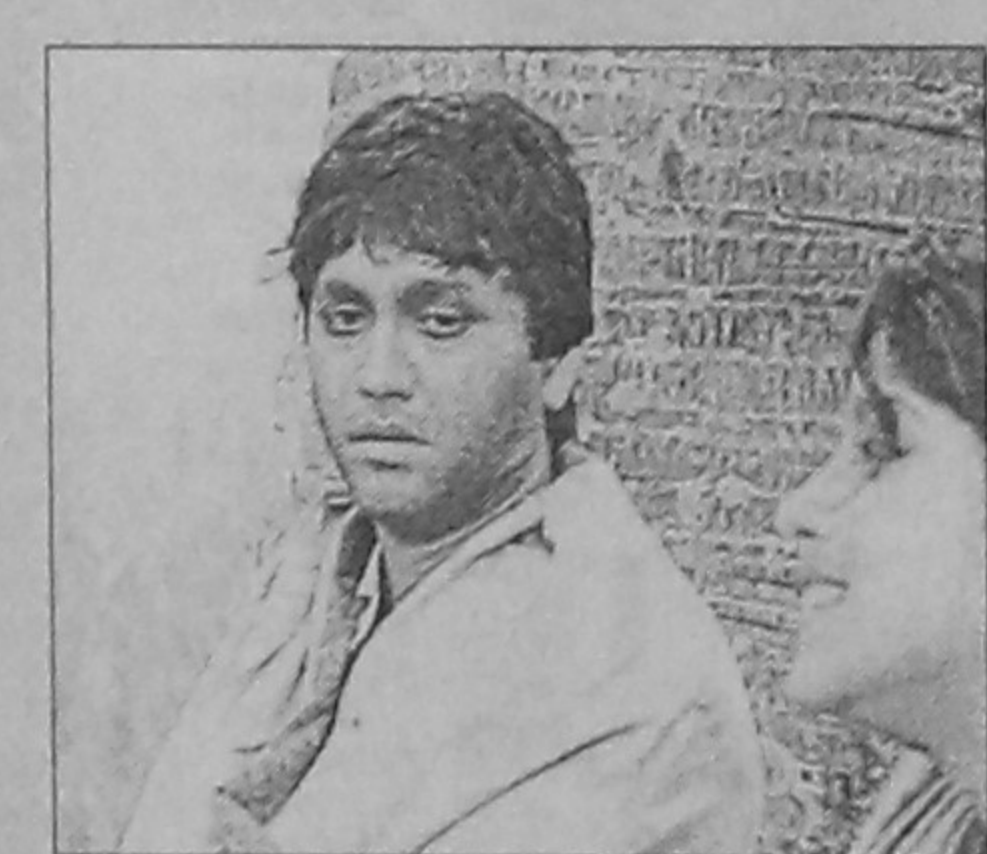
World Aids Day special drama: Hobona Badhon Hara on Ekushey television tonight at 8

6:30 Alaap 7:00 Grihosajja 7:30 News/Arghya 8:00 Andolon 8:30 Cine News 9:00 News/Bharat Bhromon 9:30 Bahari Aahar 10:00 Grihosajja 10:30 Jhara Samayer Upakatha 11:00 Bhawani Purer Chattujera 11:30 Googly 12:00 Bahari Aahar 12:30 Manabi 1:00 Daibadha 1:30 Chena Mukh Achena Manush 2:00 Sat Kahan 3:30 Feature Film 5:00 Zee Jalsa 5:30 Googly 6:00 Arghya 6:30 Apna Der Janya 7:00 Surer Ni Jhama Dhar 7:30 News 8:00 Hiyar Majhe 8:30 Chokher Bali 9:00 Major Khela Kobitae 9:30 Jeman Bolben Sir 10:00 News/Trityo Purush 10:30 Sa Re Ga Ma 11:30 Monniye 12:00 Arghya 12:30 Bharat Bhromon 1:00 Shudhu Tomake Chai 1:30 Feature Film 4:00 Manabi 4:30 Chihosajja