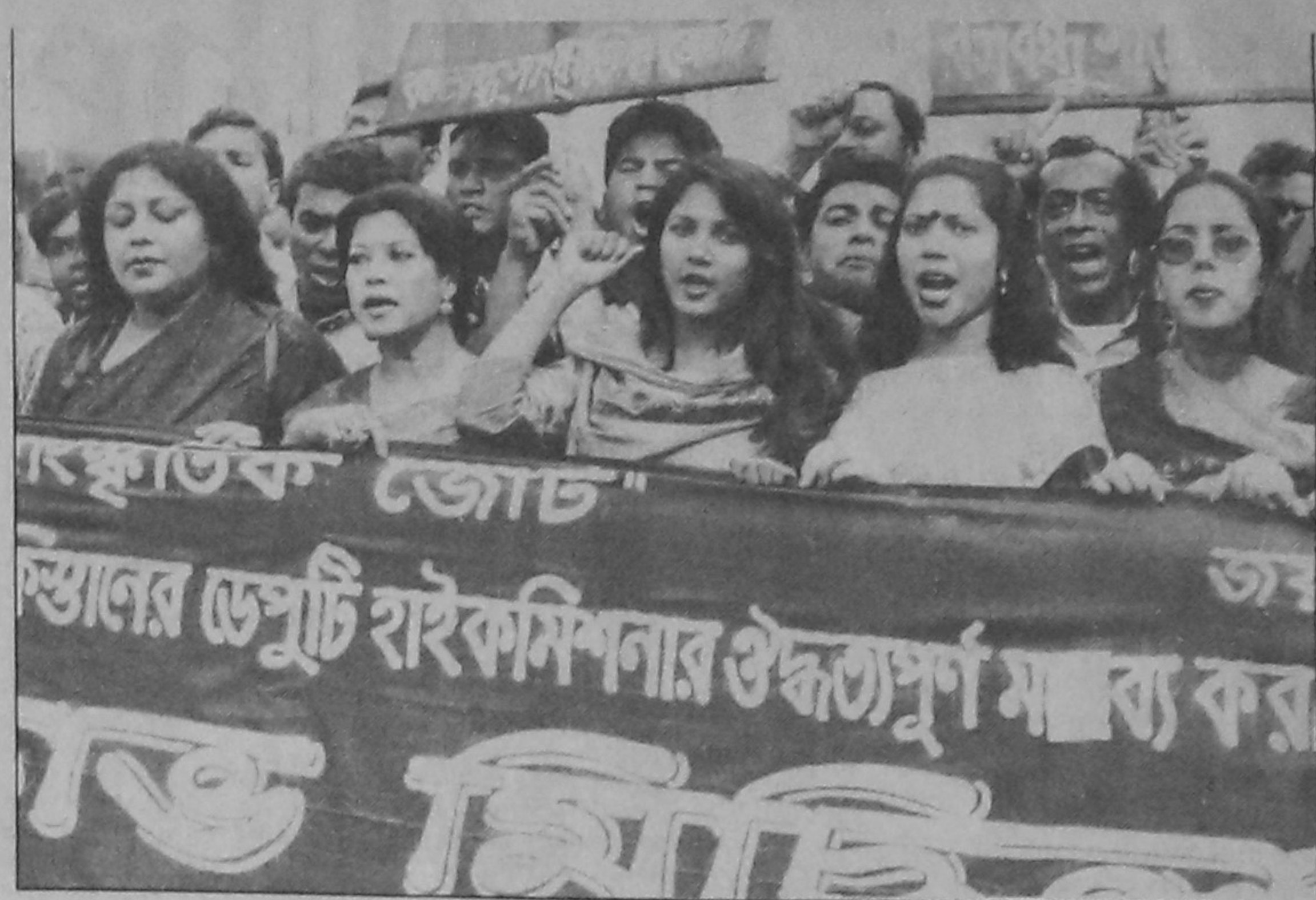
Bangabandhu Sangskritik Jote brought out a procession yesterday protesting the audacious and derogatory comments by the Pakistan's Deputy High Commissioner in Dhaka.