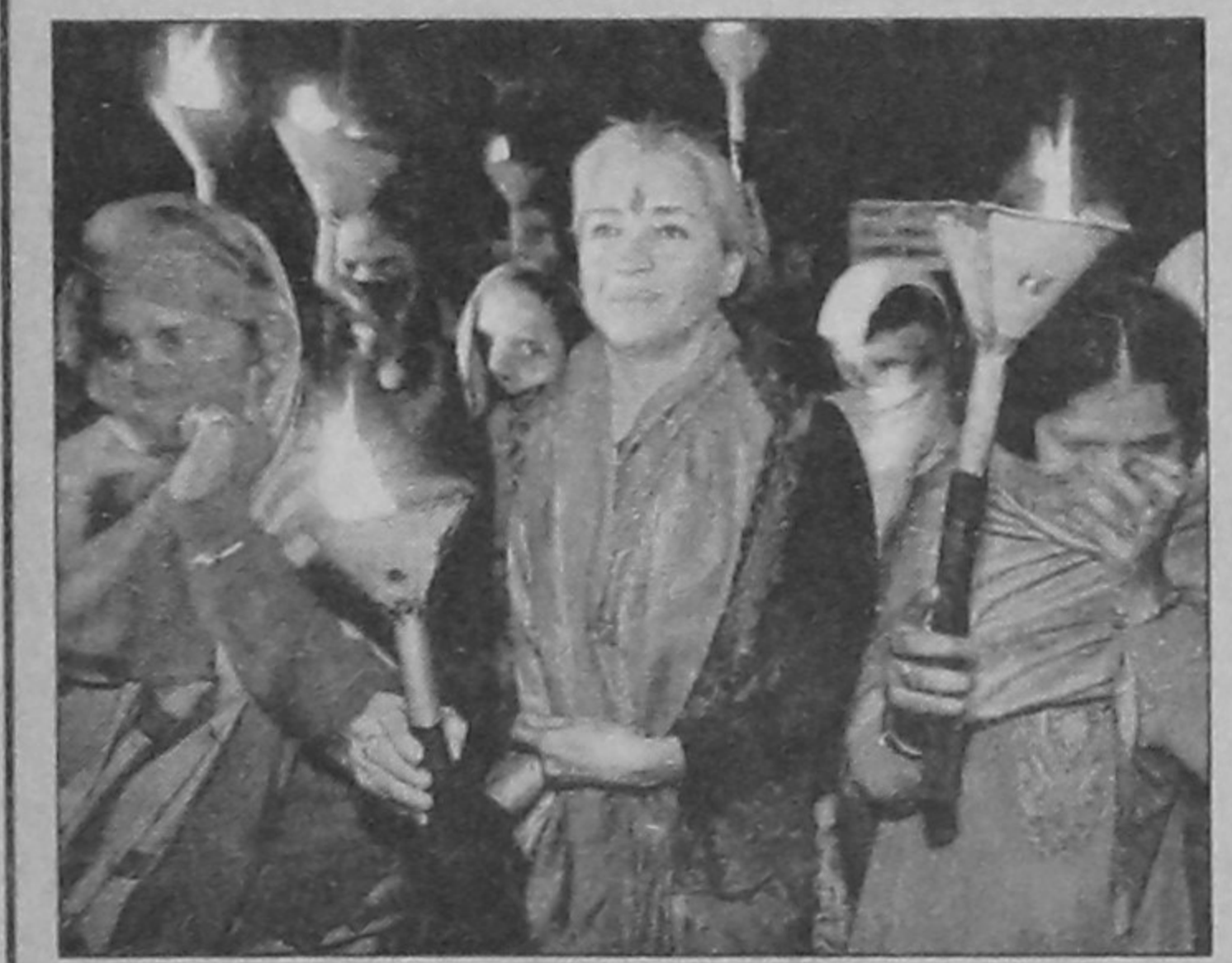
Former actress and AIDS activist Nafisa Ali (C) leads a torchlight procession of sex workers through Delhi's red light district on the eve of the World AIDS Day yesterday. Sex workers, along with Indian AIDS activists took to the streets to raise awareness amongst sex workers and the public. An estimated 3.5 million Indians are HIV-positive.