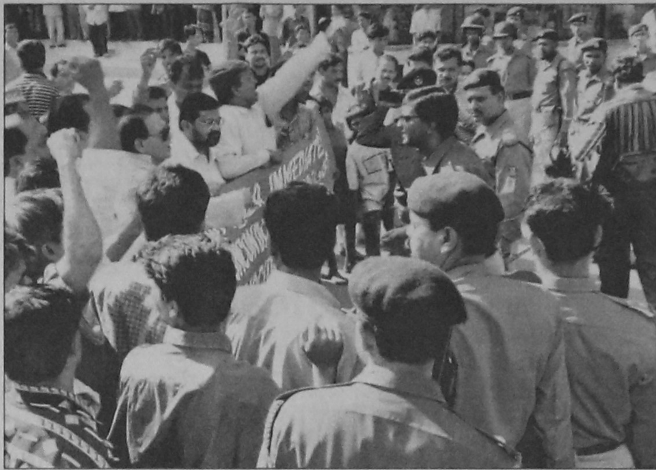
Police intercepted a JSD march at Gulshan Circle 2 yesterday. The processionists planned to lay siege to the Pakistan High Commission protesting audacious and derogatory remarks on Bangladesh's War of Liberation by the Pakistani Deputy High Commissioner.