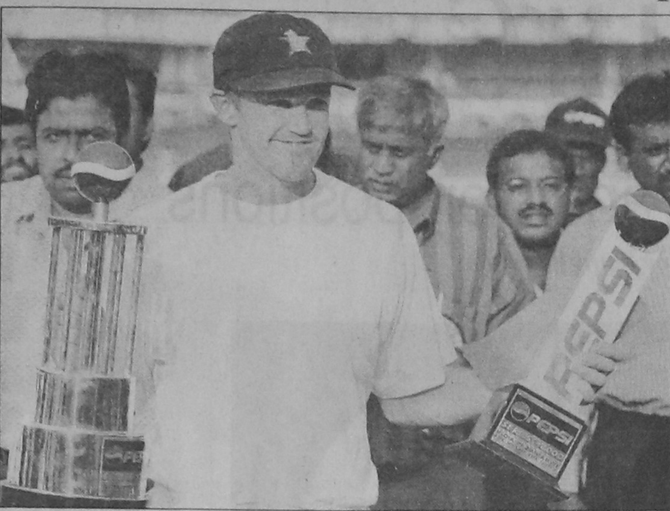
Andy Flower of Zimbabwe poses with the man-of-the-match and man-of-the-series trophies after the second Test against India in Nagpur yesterday.