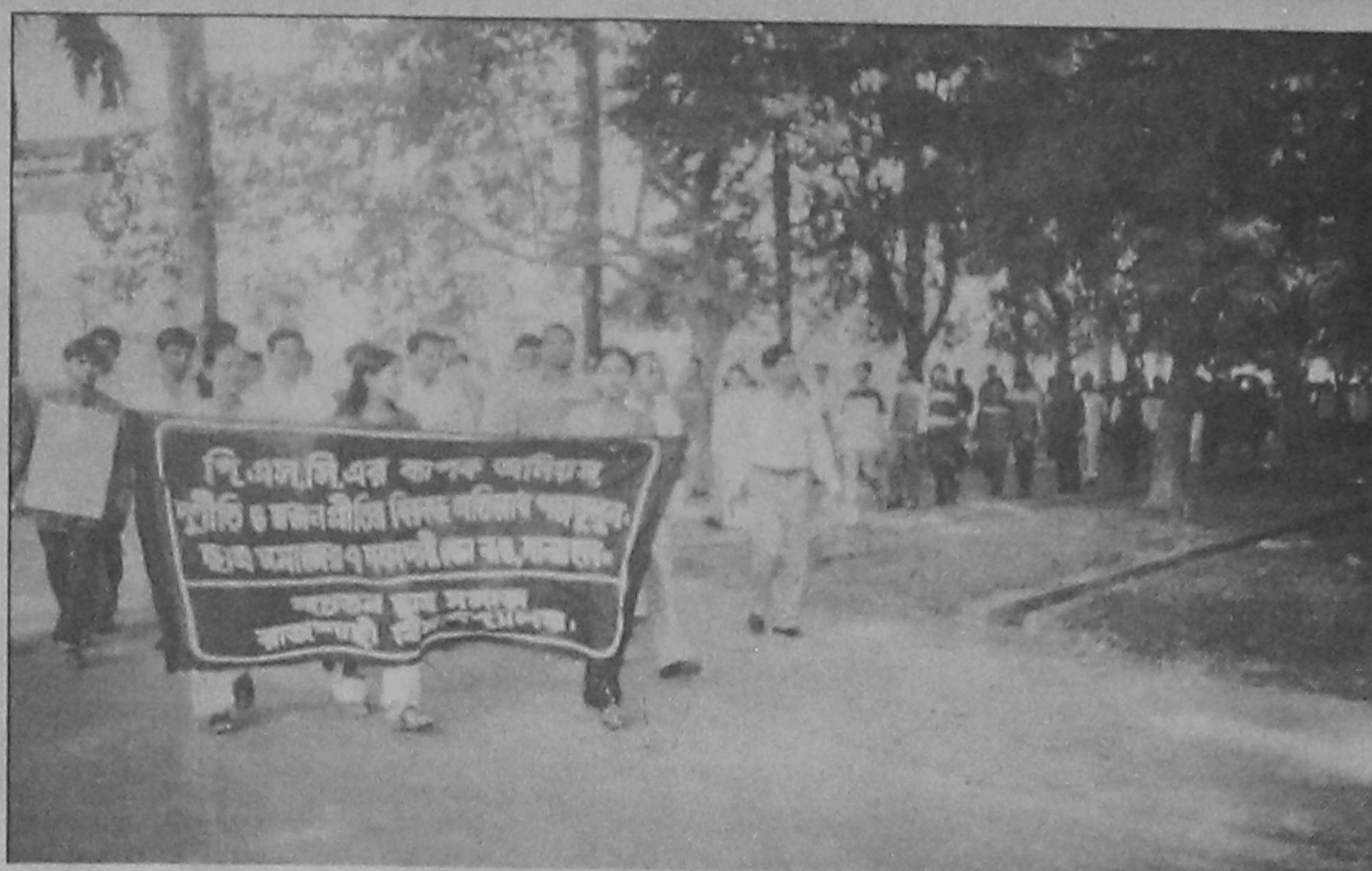
Students of Rajshahi University recently brought out a procession on the university campus demanding cancellation of the result of 20th BCS Examination.