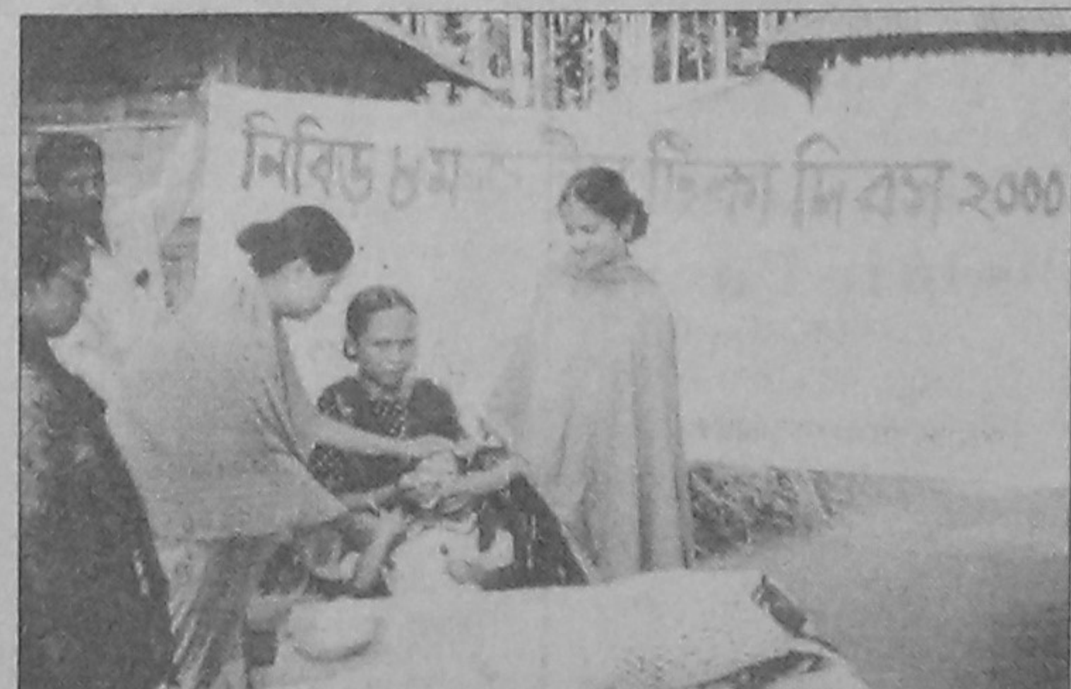
A health worker of Durgapur World Vision administering polio vaccine and feeding Vitamin-A capsule to a child at Durgapur in Netrakona district recently on the occasion of the Eighth National Immunisation Day-2000.

The NGO renders free health care service. It distributes medicine, sanitary latrine and grant to the tribals for major treatment and