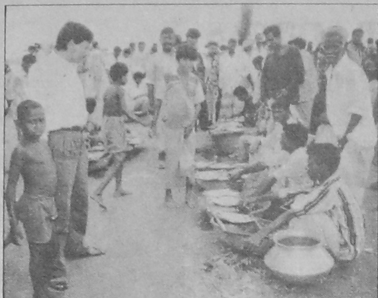
A fish market at Moti Shaheer Ghat in Sirajganj where fish supply is on the wane. The pressure of population and over fishing has taken toll on the River Jamuna, the prime source of fish here.

Experts say that fishes would return to the Jamuna with the