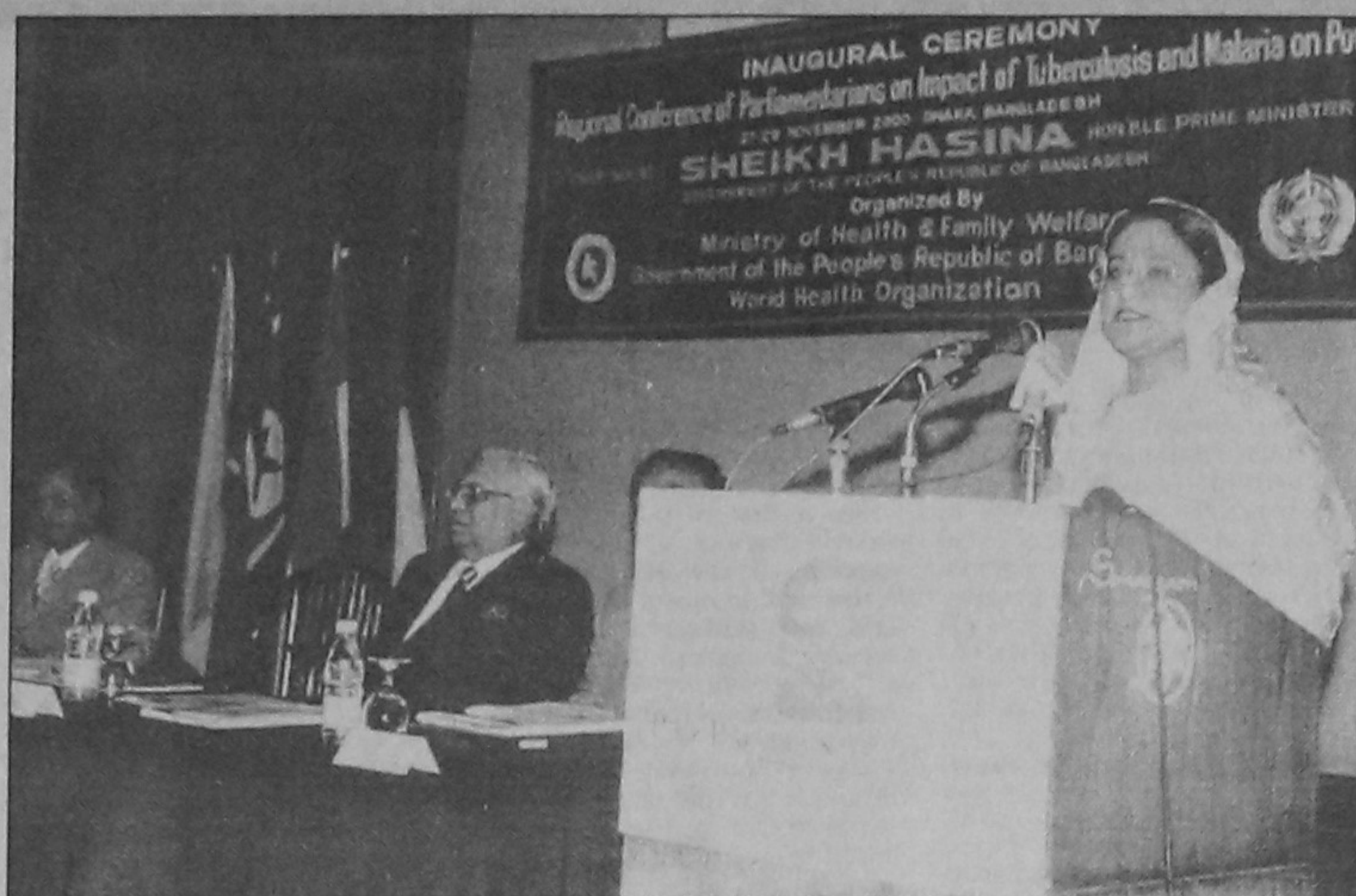
Prime Minister Sheikh Hasina addressing the inaugural ceremony of a three-day 'Regional Conference of Parliamentarians on Impact of Tuberculosis and Malaria on Poverty' at a city hotel yesterday.