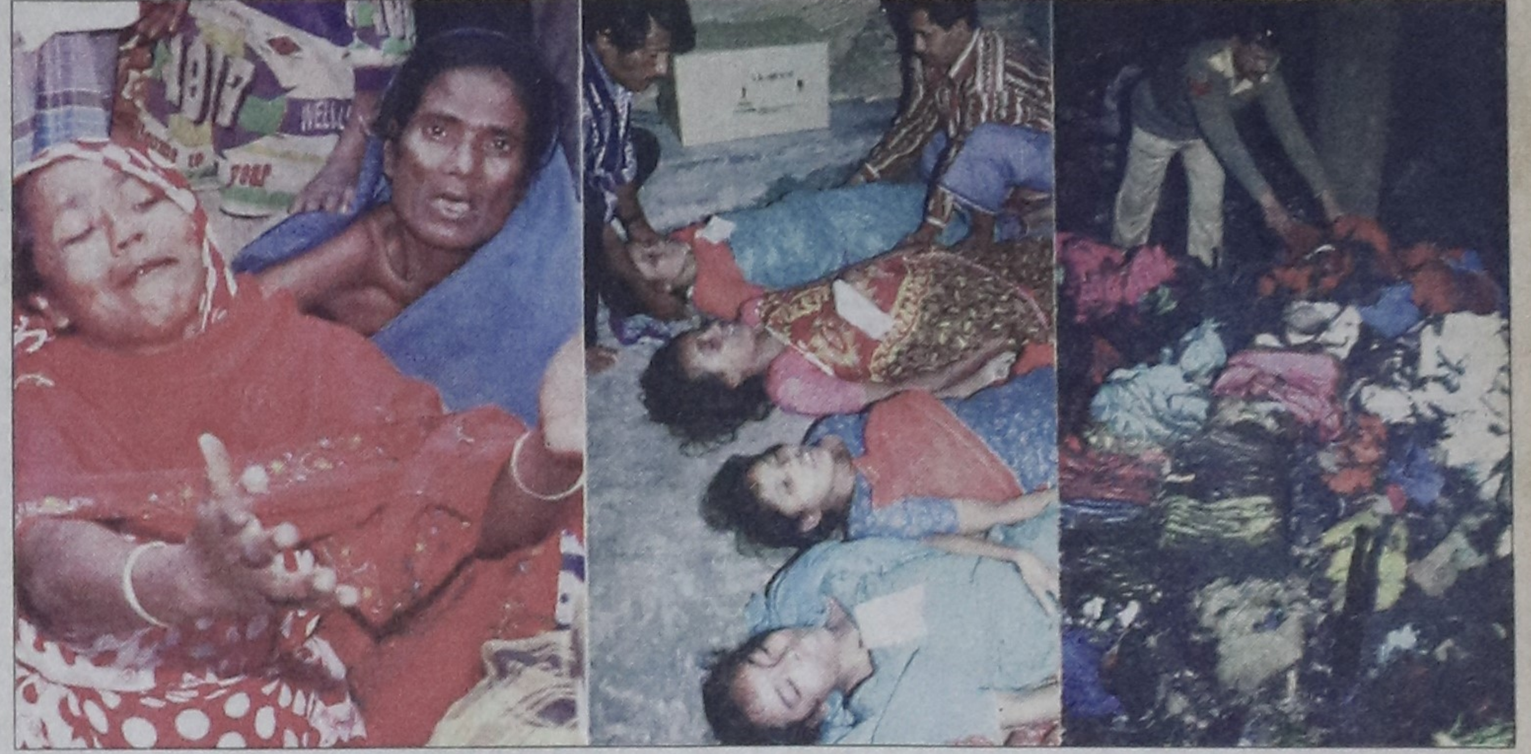
Bereaved relatives (L) of the victims of Narsingdi garment factory fire wail for their lost ones, bodies of the victims being tagged for identification at a hospital (M), and police (R) dig into the debris on the factory premises yesterday.