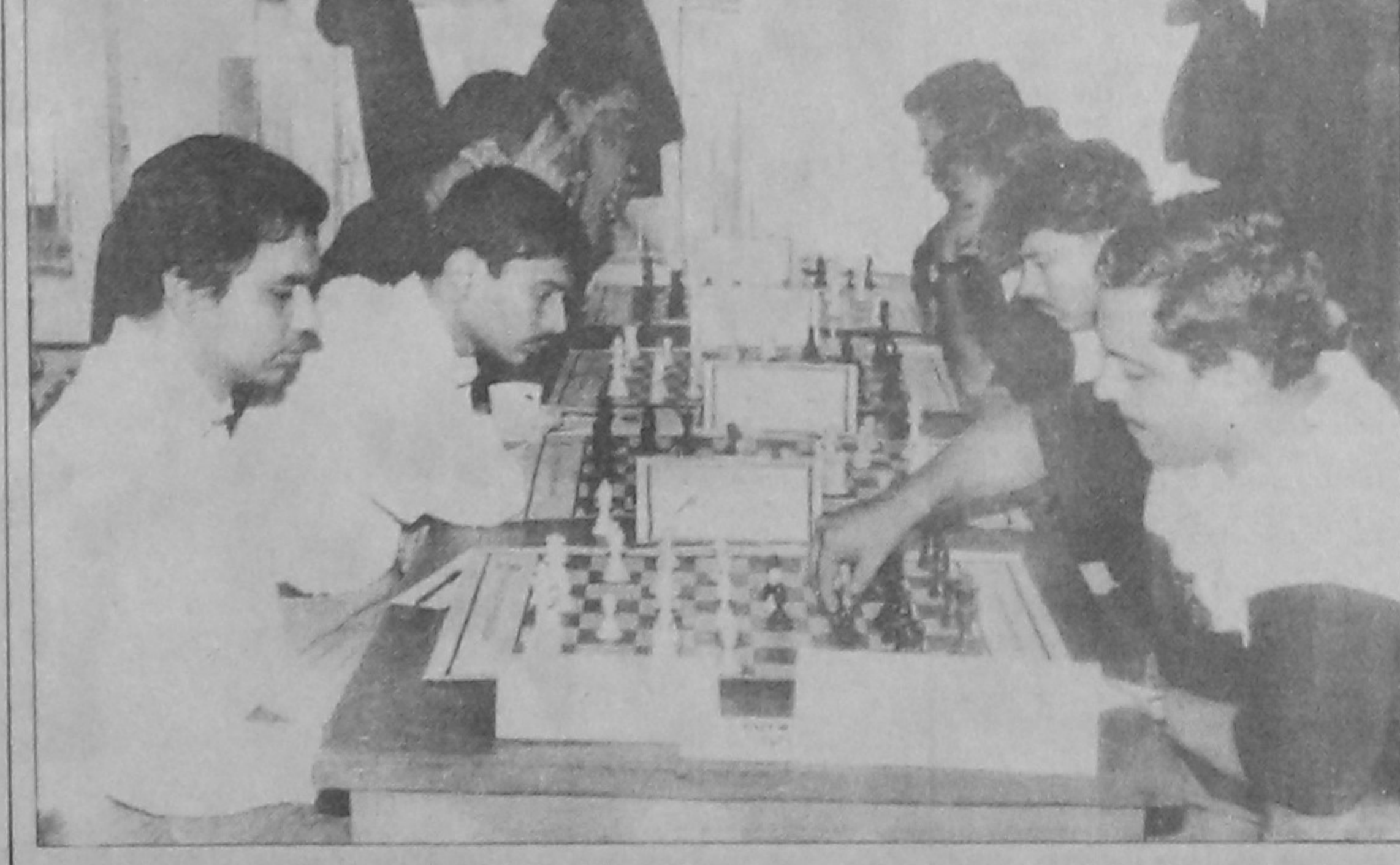
Scene from yesterday's First Division Chess League engagements at the NSC.