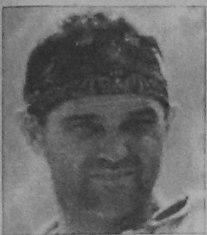
Martin Crowe (Former New Zealand cricket captain)

"I've never had any contact with illegal gambling syndicates. I'm shattered that my name is mentioned when I don't know what it's for."